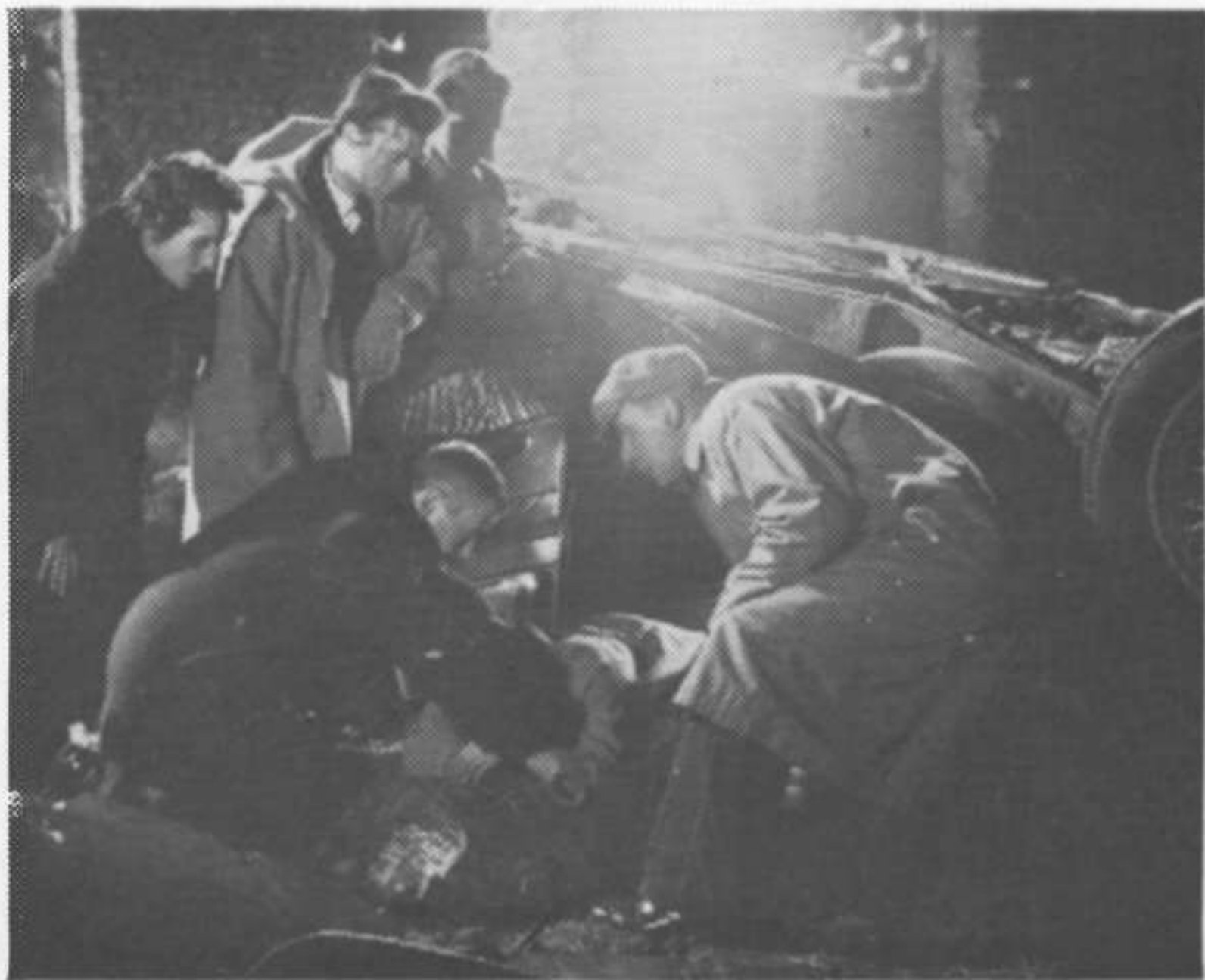
2 Col. Mat 2D

Her latest films include "The Turning Point," "Split Second" and "The Sleeping Tiger," her first British film, in which she co-stars with Dirk Bogarde and Alexander Knox.