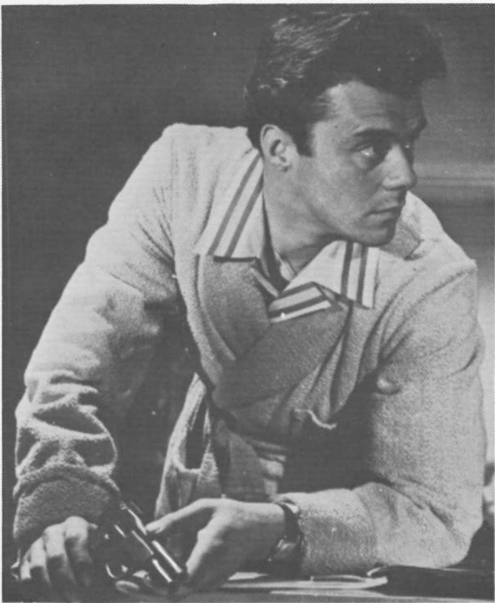
2 Col. Mat 2A

DIRK BOGARDE IN ONE OF THE MANY TENSE SCENES IN "THE SLEEPING TIGER" WHICH ALSO CO-STARS ALEXIS SMITH AND ALEXANDER KNOX, THRU ASTOR PICTURES.