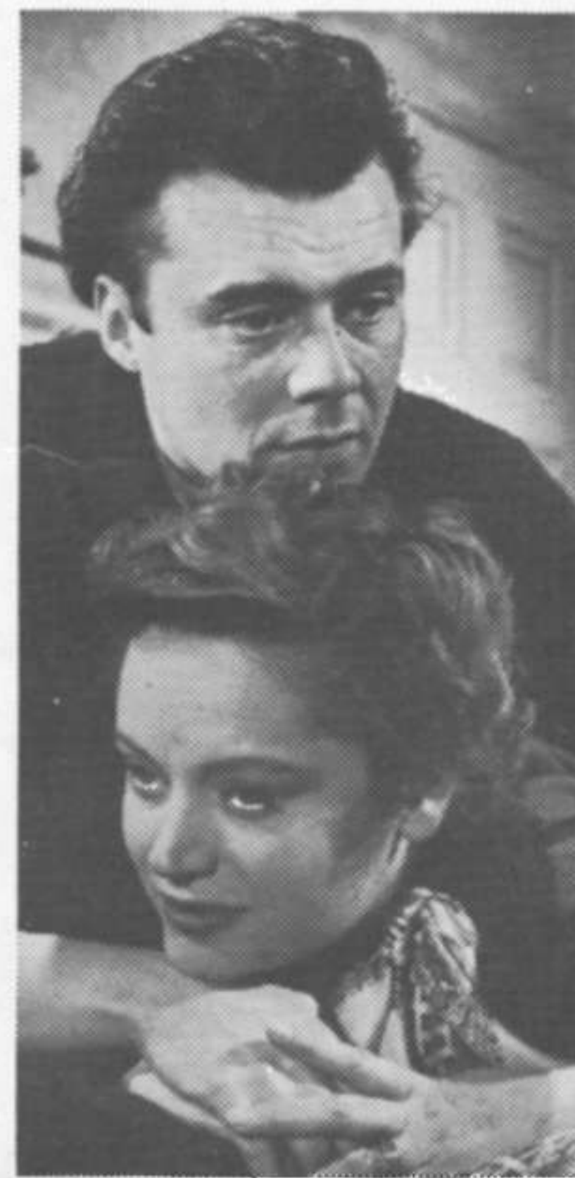
1 Col. Mat 1B

"The Sleeping Tiger" tells a story which is unique in theme and a challenge to both direction and performance. The presentation is a remarkable consolidation of suspense and integrity. The principal characters are a psychiatrist (Alexander Knox), his neglected wife (Alexis Smith) and a handsome criminal (Dirk Bogarde), who becomes an unwilling guinea pig when the doctor decides to reform the thief rather than turn him over to the police. The "cure" entails a six months' residence in the psychiatrist's household. From the beginning there is an aura of tension and a certainty that the doctor's experiment will have tragic repercussions. The wife's initial petulance gives way to an infatuation for the new boarder; the patient reverts to criminal habits; the psychiatrist calmly perseveres in his research. These ingredients explode with startling intensity in the final reel.