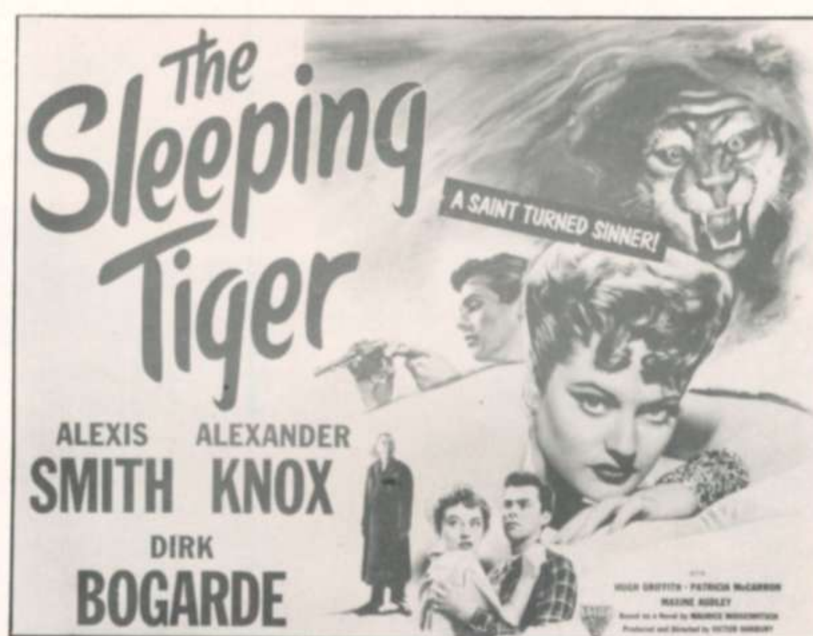
22 x 28 LOBBY

ALSO AVAILABLE 11 x 14 LOBBY PHOTOS 8 x 10 FLAT STILLs