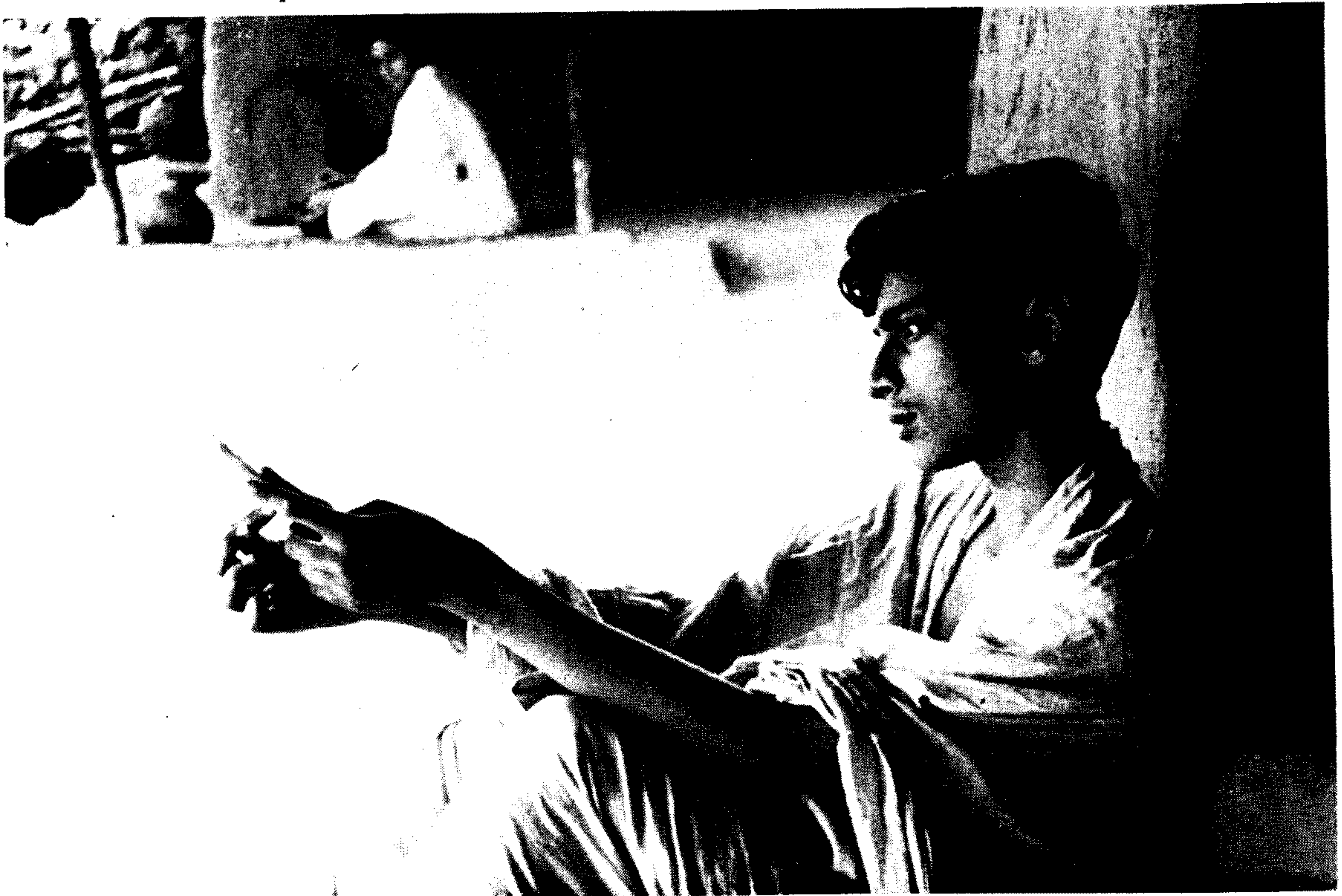
Apu as a student, in APARAJITO, the second film of Satyajit Ray's trilogy.