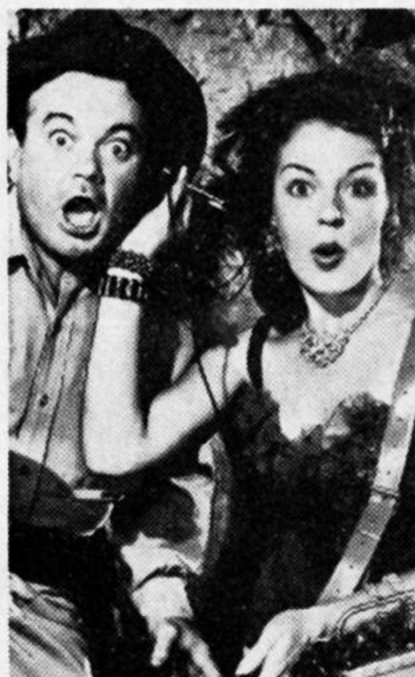
DIG THAT URANIUM