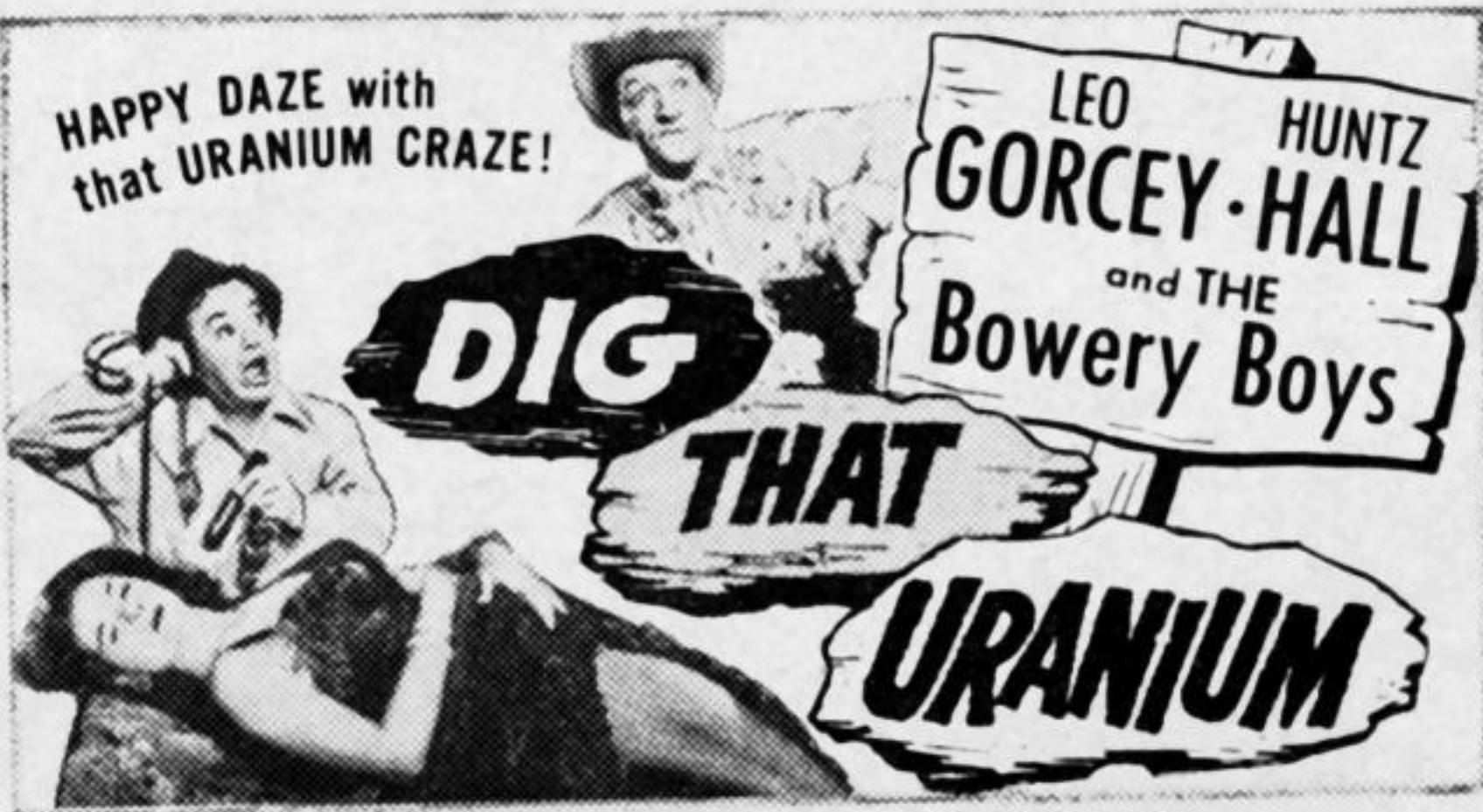
with MARY BETH HUGHES - RAYMOND HATTON AN ALLIED ARTISTS PICTURE