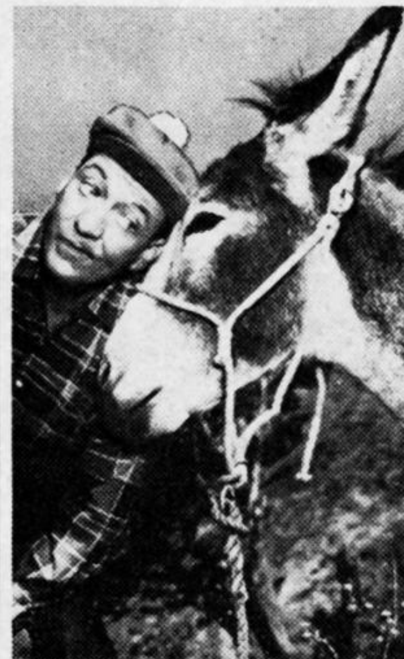
DIG THAT URANIUM