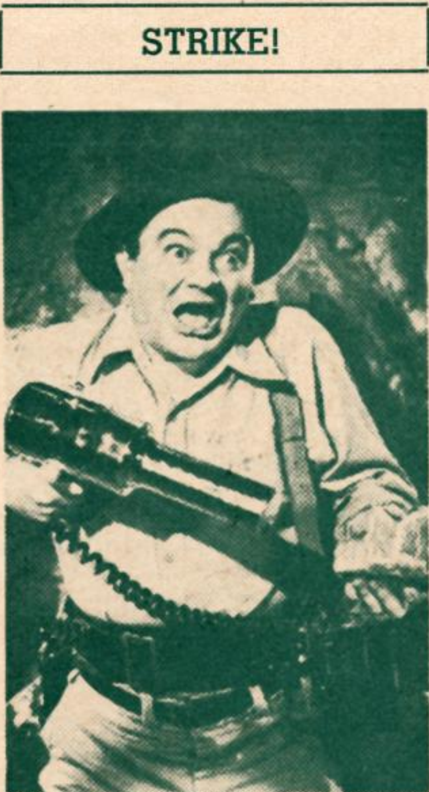
STRIKE! DIG THAT URANIUM No. 2 Leo Gorcey's prospecting tool registers a hit in "Dig That Uranium," latest in Allied Artists' Bowery Boys comedies, co-starring Huntz Hall, now at the ..... theatre.