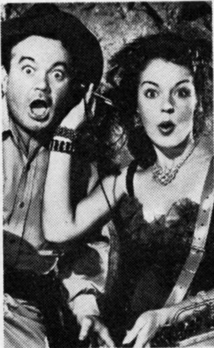
DIG THAT URANIUM