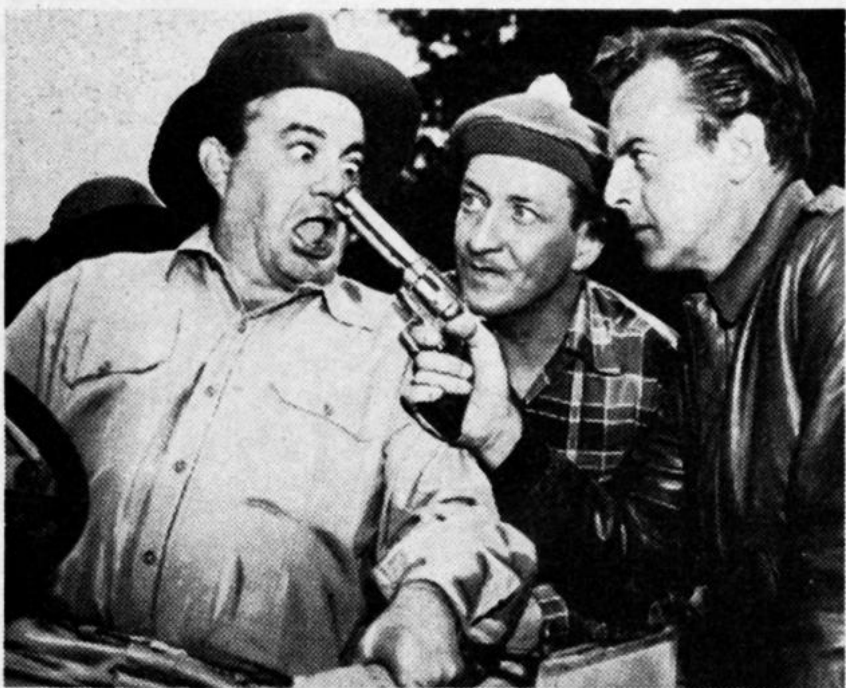
DIG THAT URANIUM