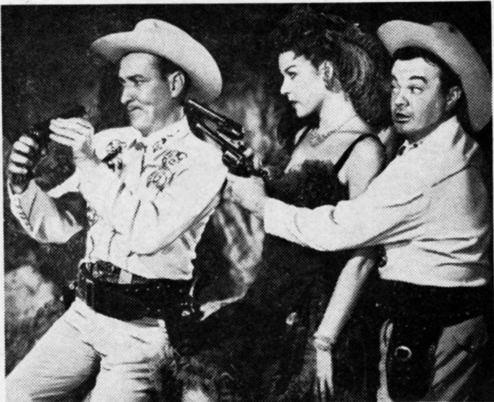
DIG THAT URANIUM