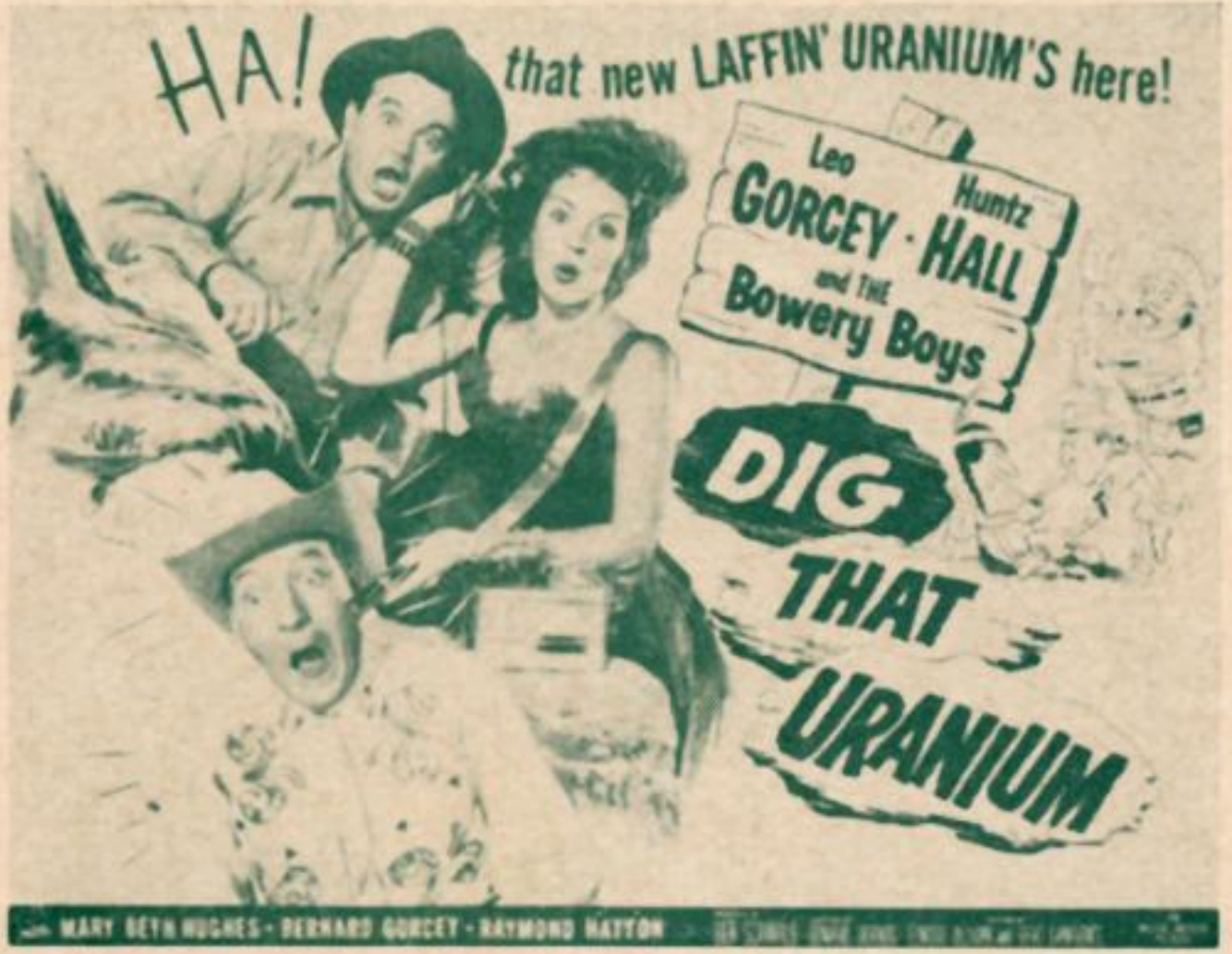
TWO 22 x 28 LOBBY CARDS

Set of Eight Full Color 11 x 14 Lobby Photos Also Available