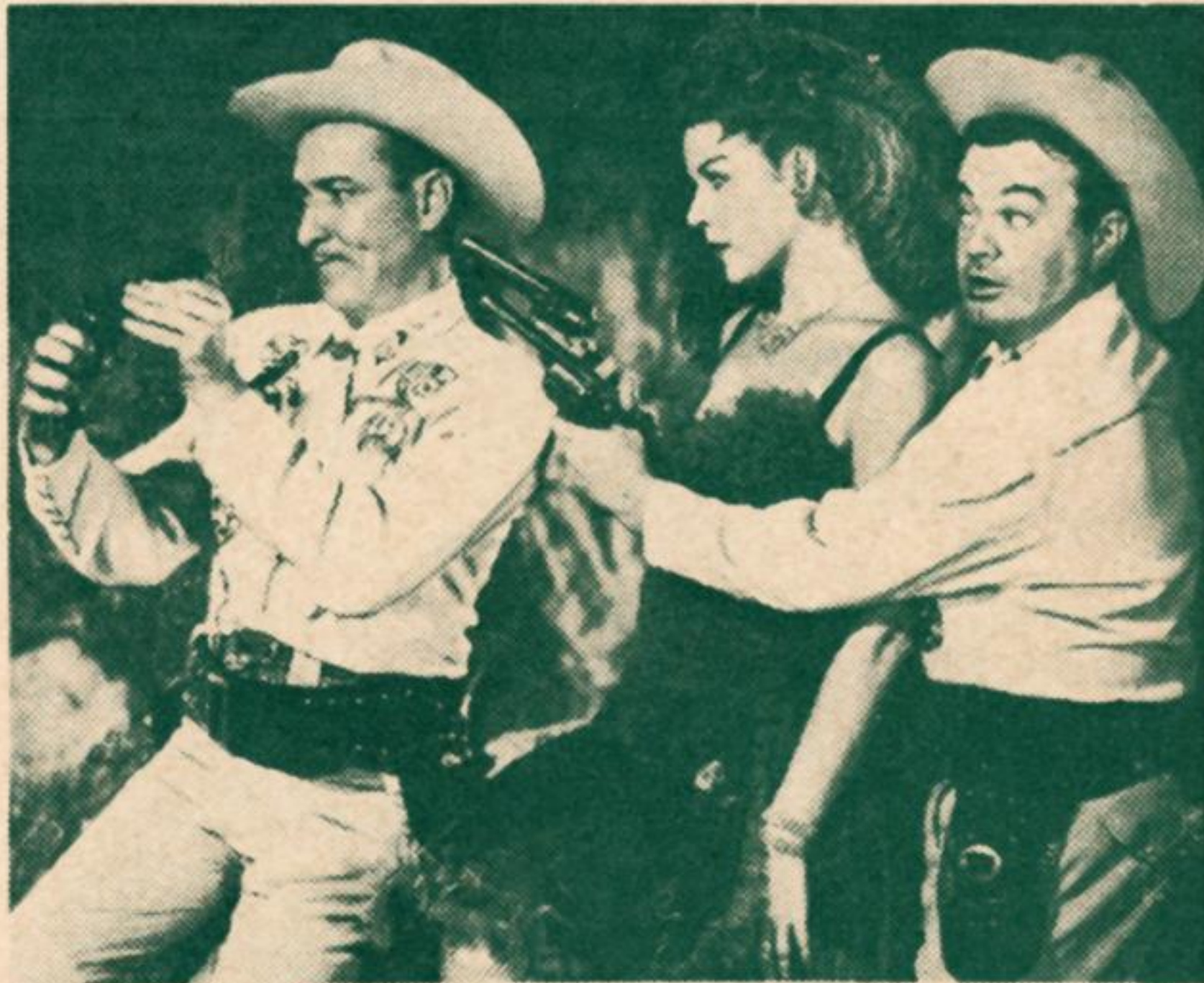
DIG THAT URANIUM No. 22