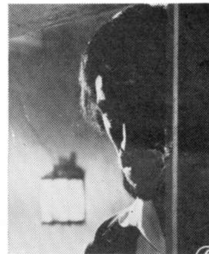
Max von Sydow, star of Ingmar Bergman's "The Magician."