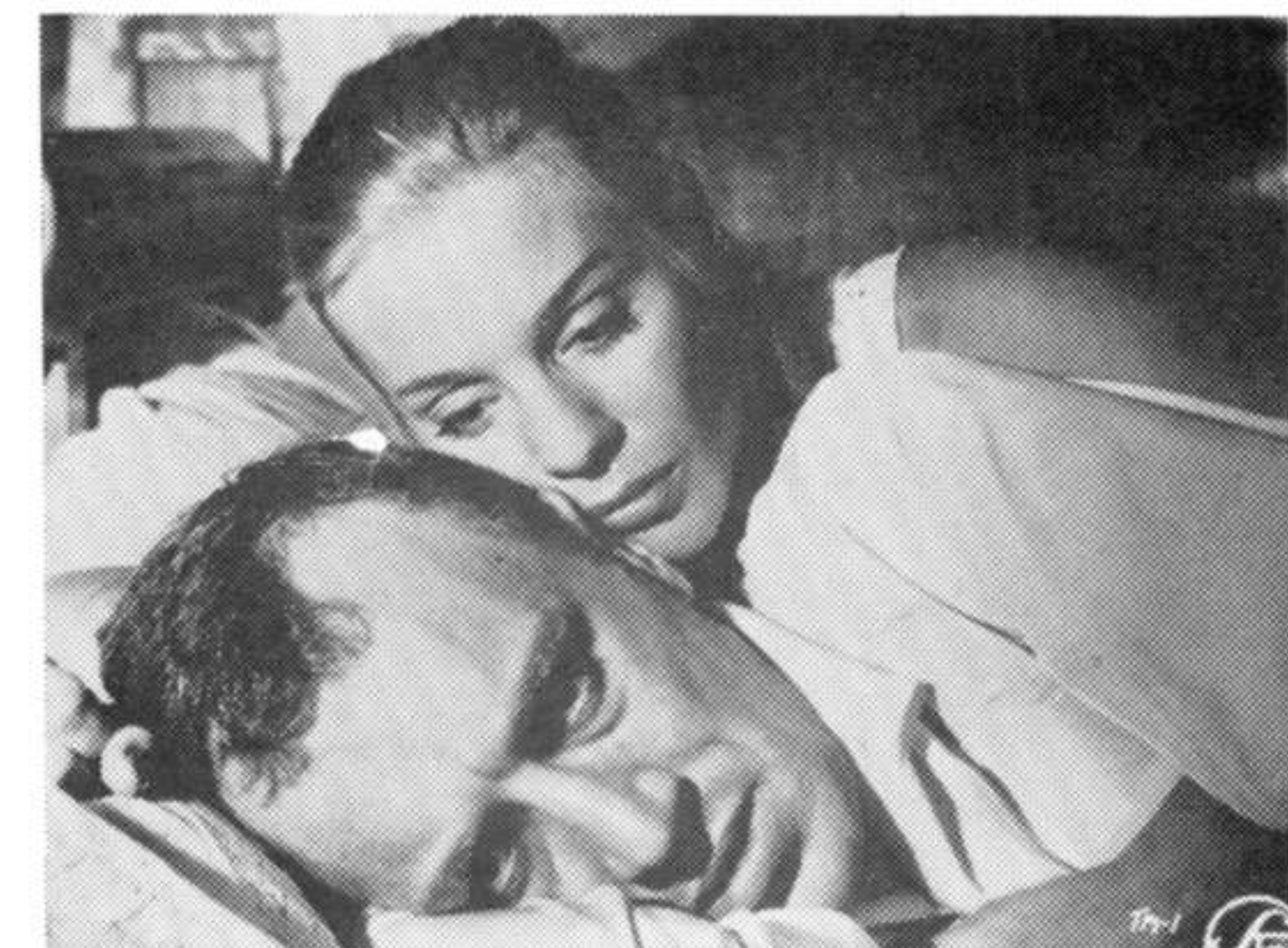
Ingrid Thulin and Max von Sydow in a scene from Ingmar Bergman's "The Magician."