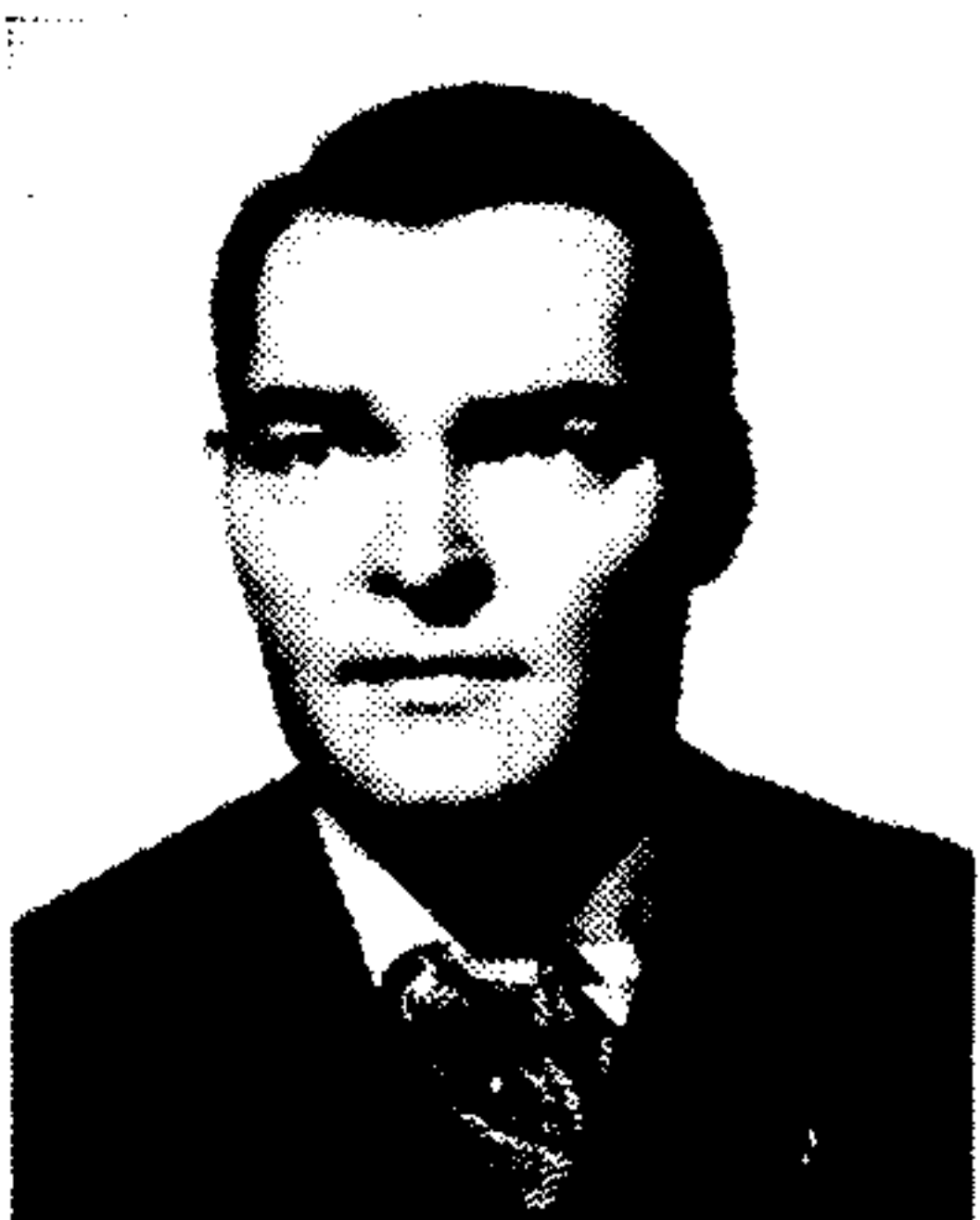
"THE SUN SHINES BRIGHT" (1G)

"THE SUN SHINES BRIGHT," Republic's powerful new John Ford drama currently at the..... Theatre, co-stars handsome John Russell and lovely Arleen Whelan in the romantic leads.