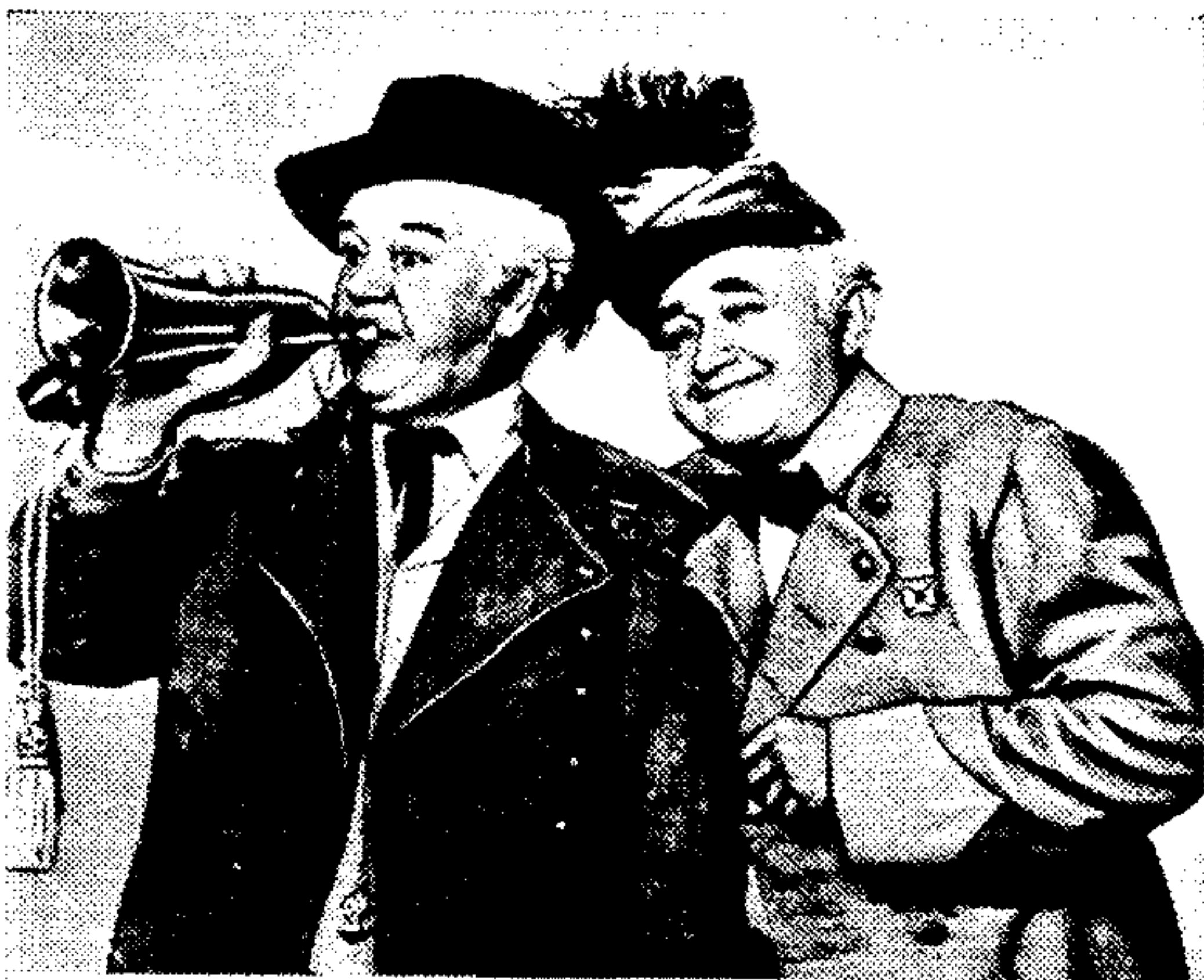
"THE SUN SHINES BRIGHT" (2C)

BUGLER Charles Winninger and Ludwig Stossel as they appear in "The Sun Shines Bright," John Ford's dramatic and heart-warming picturization of Irvin S. Cobb's famous "Judge Priest" stories for Republic which arrives..... at the..... Theatre.