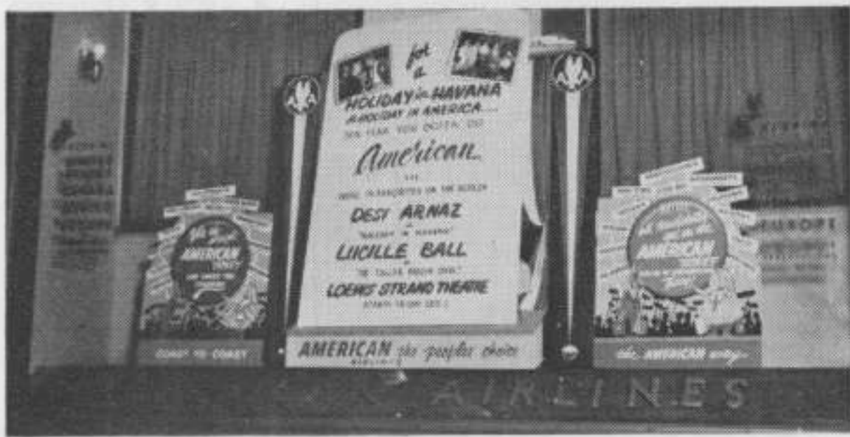
Travel Window Displays