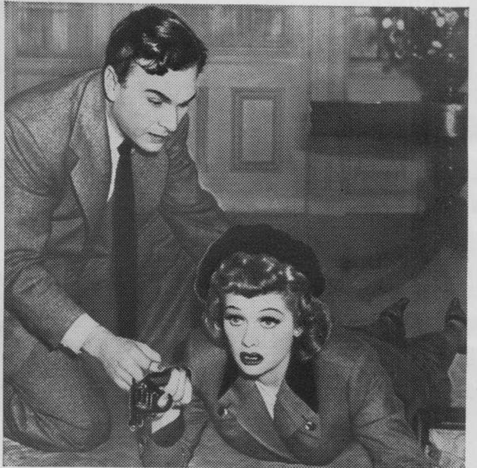
"Fuller Brush Girl" Mat 2-A

THAT DOOR-TO-ROAR SALESMAN, RED SKELTON, and co-star Janet Blair try to tell the police about a murder in Columbia Pictures' reprint comedy, "The Fuller Brush Man," now at the ..... Theatre.