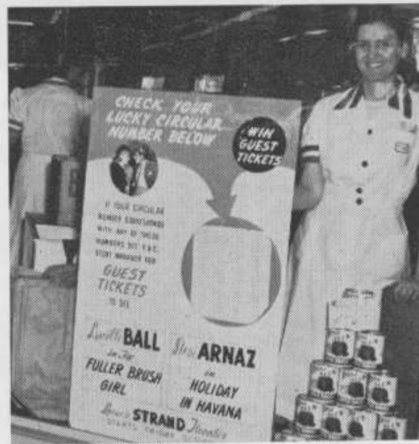
Lucky Number Heralds