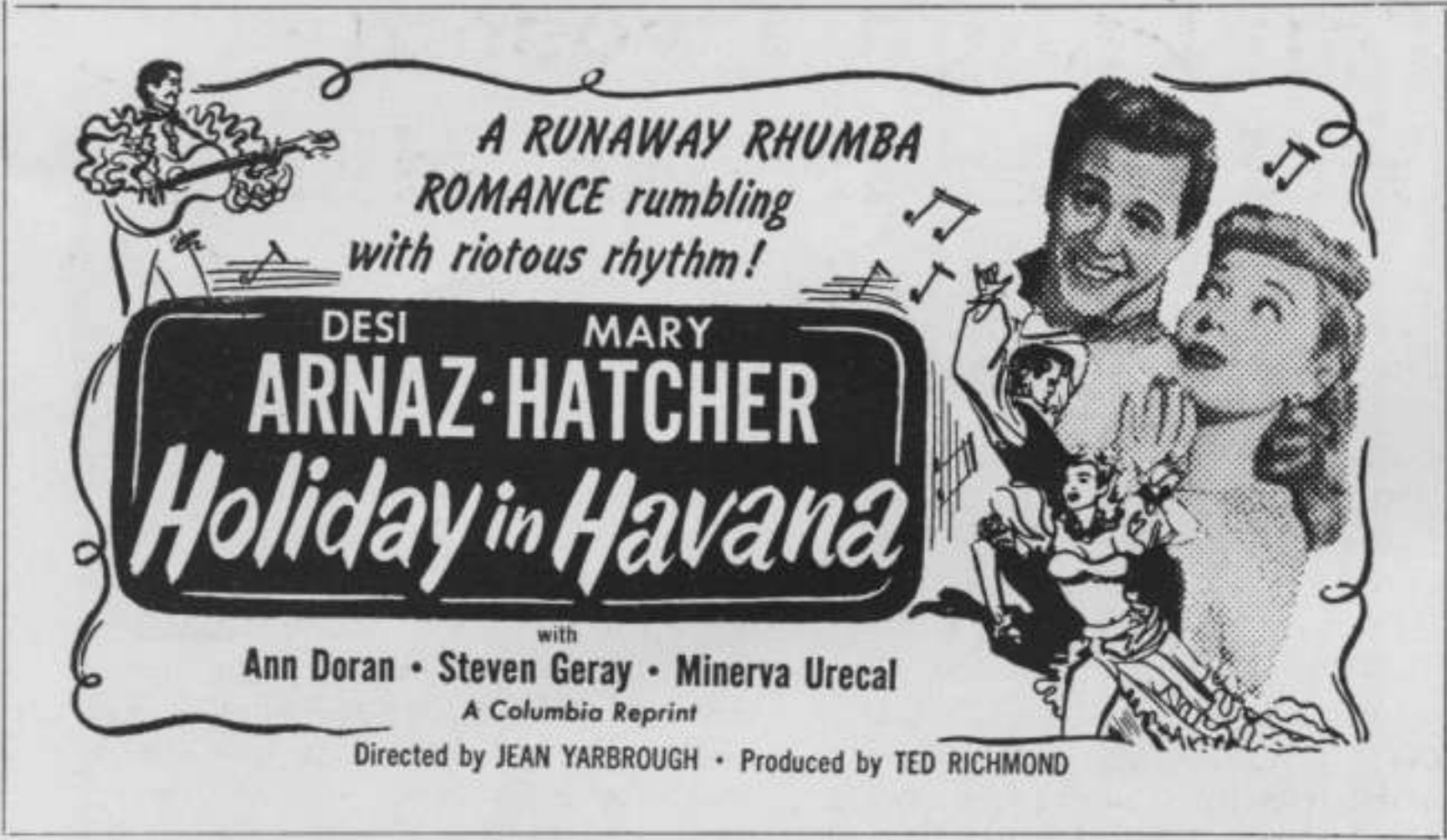
60-Line Ad Mat No. 202 R — 2 Cols. x 30 Lines