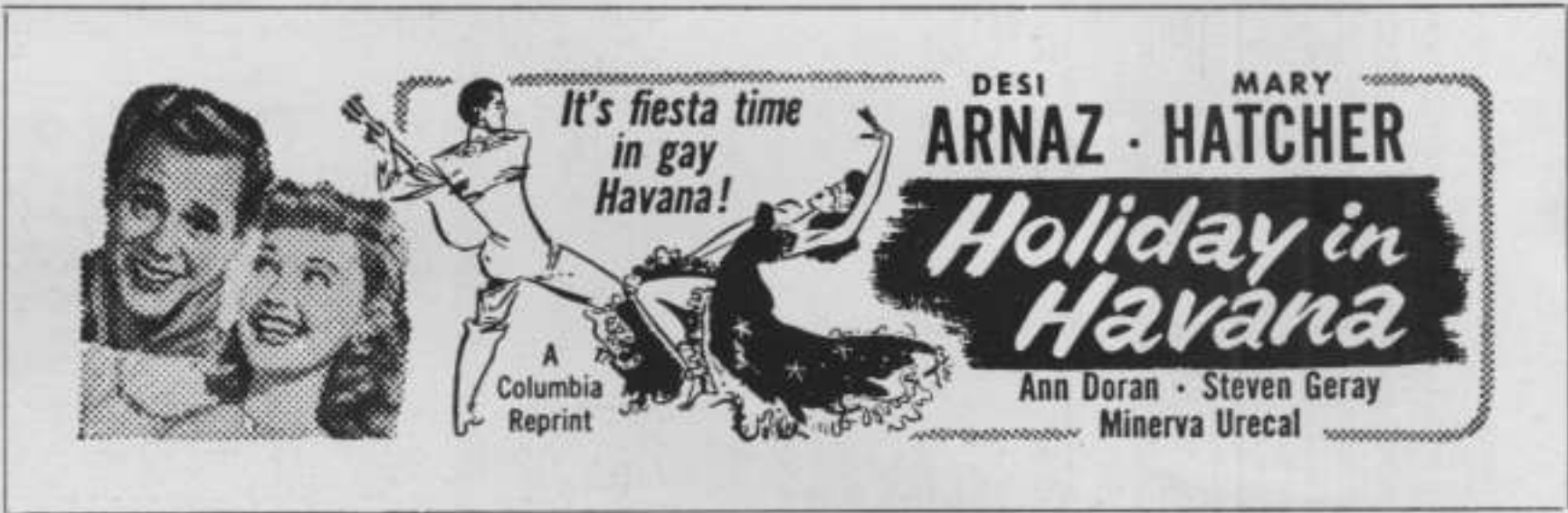
30-Line Ad Mat No. 201 R—2 Cols. x 15 Lines