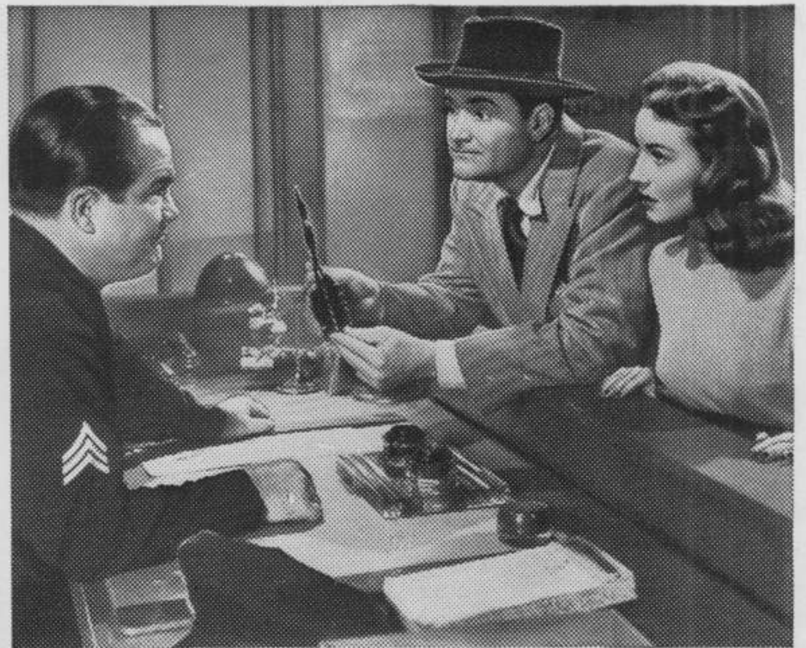
"Fuller Brush Man" Mat 2-C

In ordering publicity and advertising mats, stills and other accessories from your National Screen Service exchange, be sure to specify exactly which picture the promotional material is from.