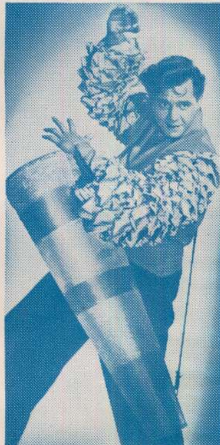
"Holiday in Havana" Mat 1-C

LUCILLE BALL is "The Fuller Brush Girl" in the Columbia picture at the ..... Theatre. Eddie Albert co-stars with Lucy in the reprint.