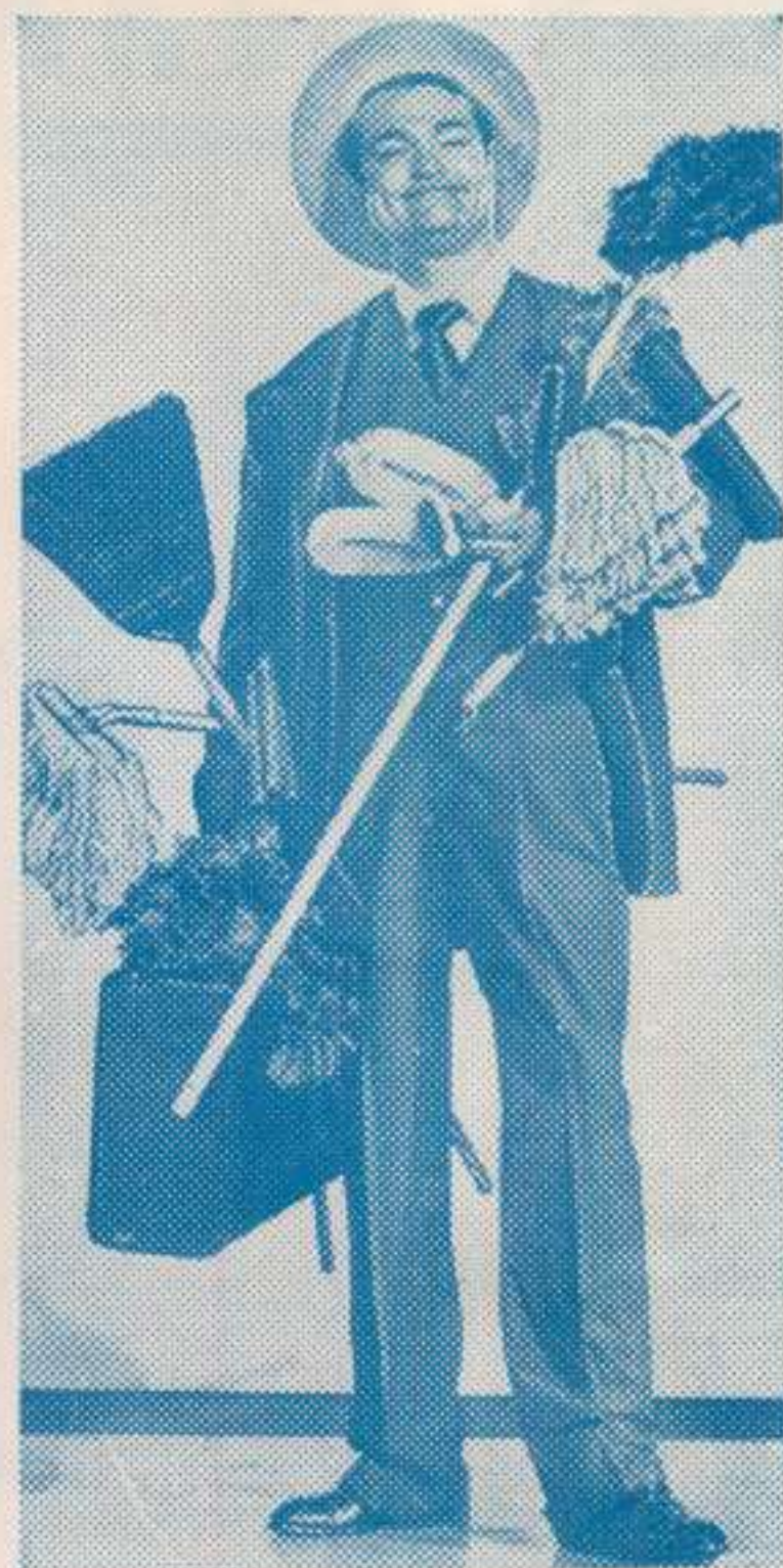
"Fuller Brush Man" Mat 1-B

RED SKELTON stars in Columbia Pictures' reprint comedy, "The Fuller Brush Man," at the ..... Theatre. Janet Blair co-stars with Skelton.