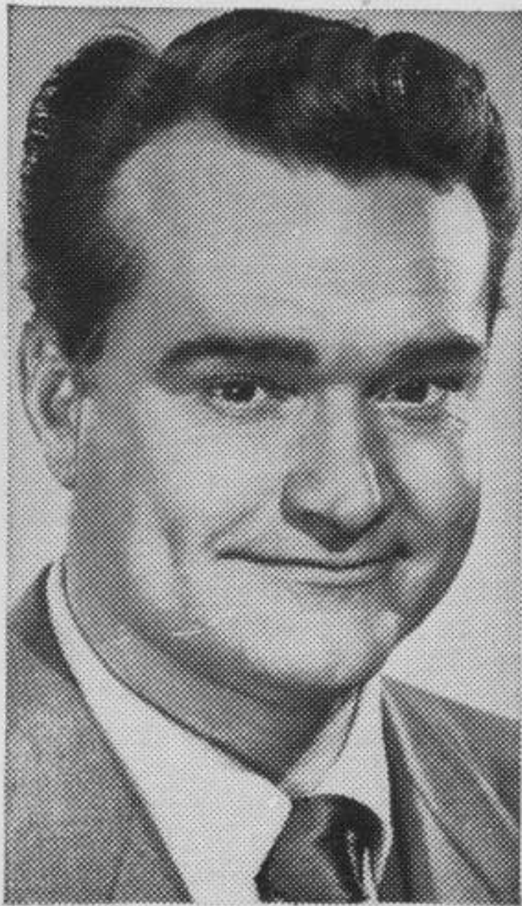
"Fuller Brush Man" Mat 1-E