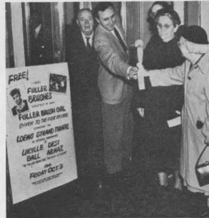
Fuller Brush Giveaway