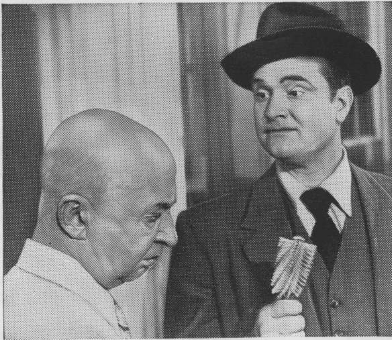
"Fuller Brush Man" Mat 2-A

To judge from audience reaction when "The Fuller Brush Girl" was first released, you'll love Lucy in a film in which the beautiful and hilarious Miss Ball has lines even "The Fuller Brush Man" can't compete with. Miss Ball, starred with Eddie Albert, is seen as a would-be house-to-house cosmetic dealer, getting into all kinds of scrapes. The