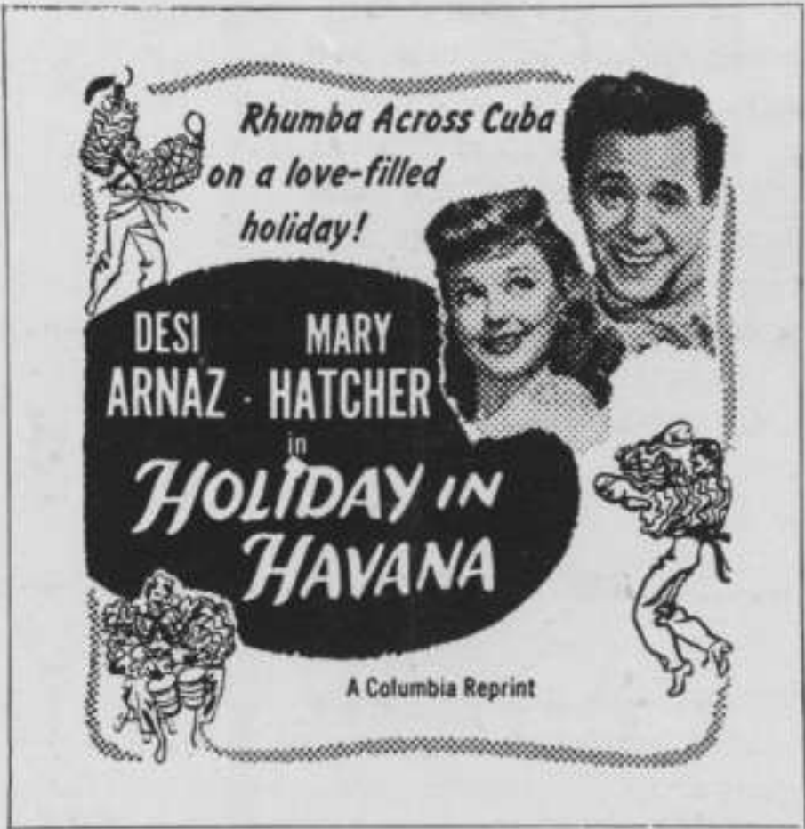
Ad Mat No. 102 R—28 Lines