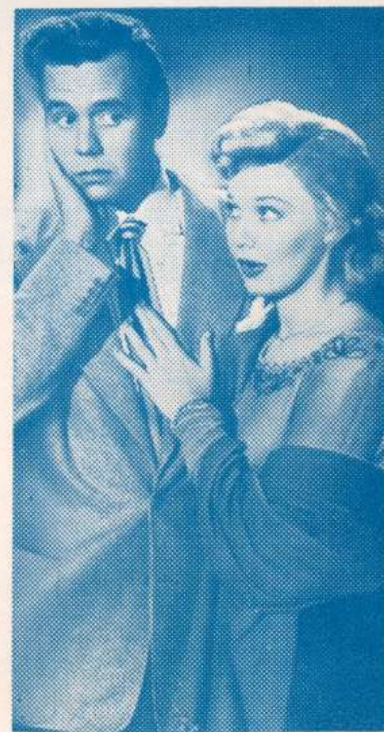
"Holiday in Havana" Mat 1-A