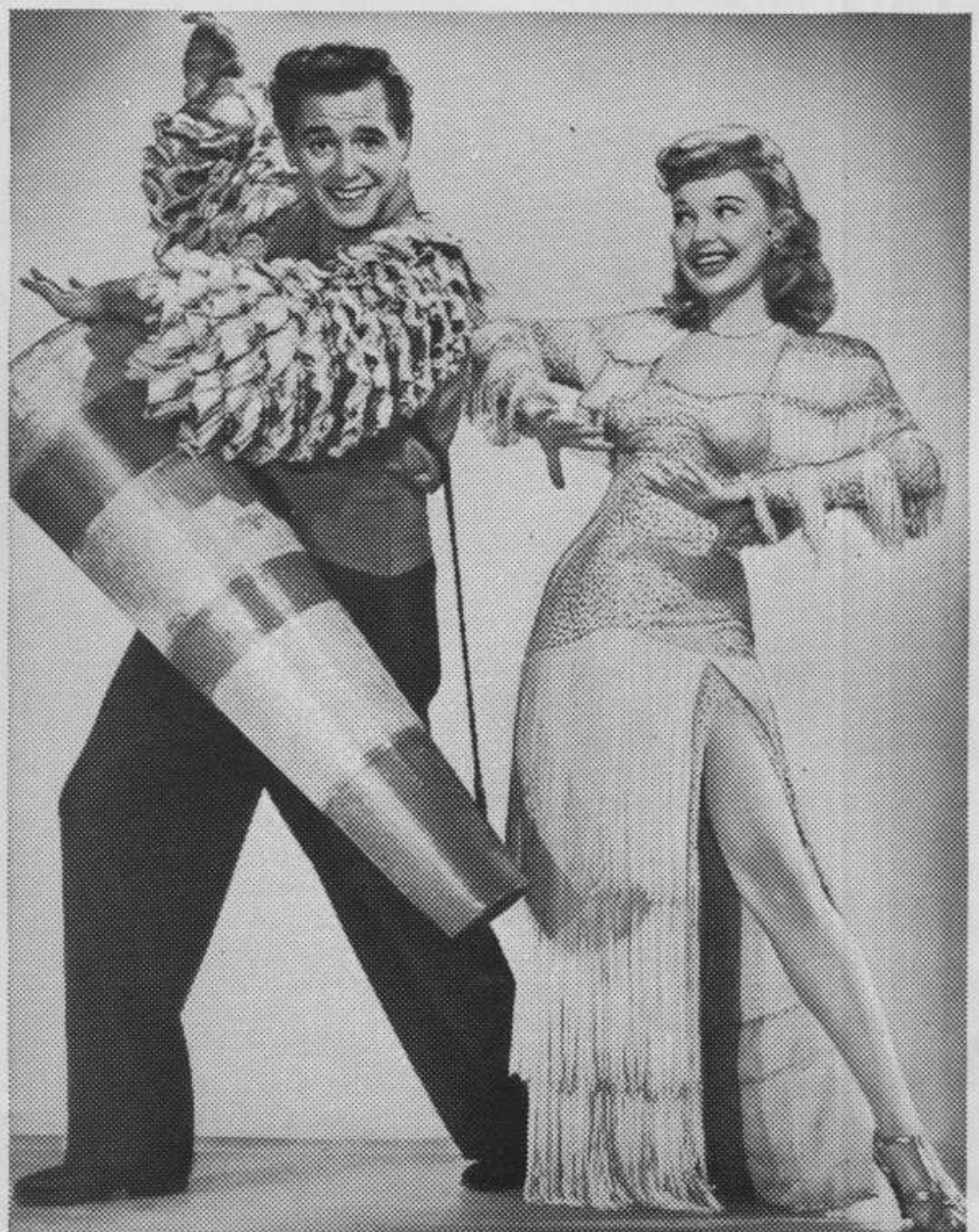
"Holiday in Havana" Mat 2-A

LUCILLE BALL GETS A LESSON in merry mayhem from co-star Eddie Albert in this scene from Columbia Pictures' reprint comedy, "The Fuller Brush Girl," now at the ..... Theatre.