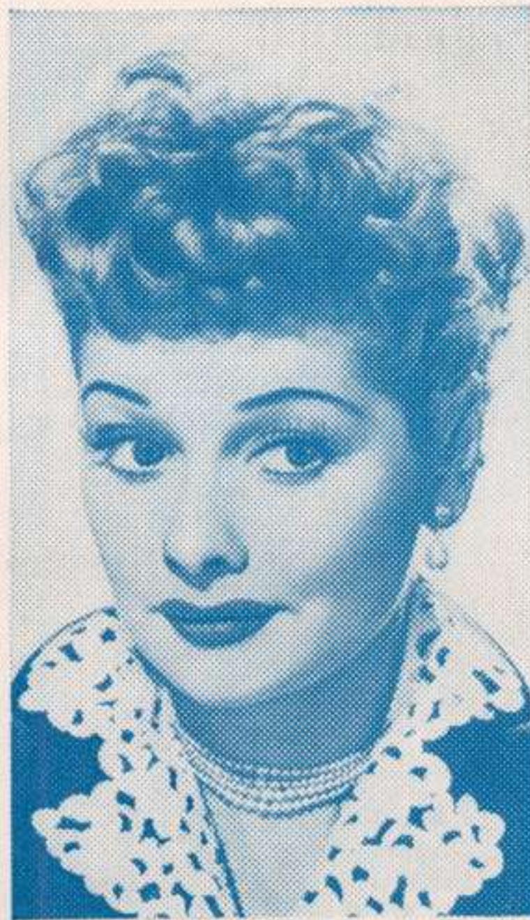
"Fuller Brush Girl" Mat 1-A

Columbia Pictures' reprint, "The Fuller Brush Girl," starring Lucille Ball and Eddie Albert, will open ..... at the ..... Theatre. The movie relates the adventures of a would-be house-to-house cosmetics dealer.