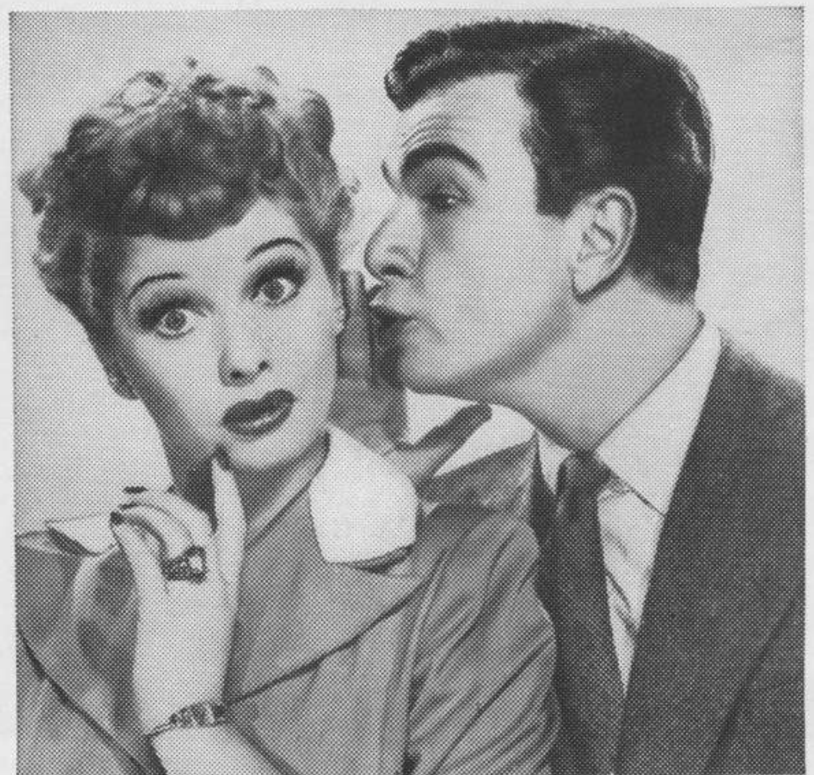
"Fuller Brush Girl" Mat 2-C

If you saw "The Fuller Brush Girl" and "Holiday in Havana" when they were first shown, you'll find yourself enjoying them just as much on second sight. If you never saw them—well, be sure not to miss them this time!