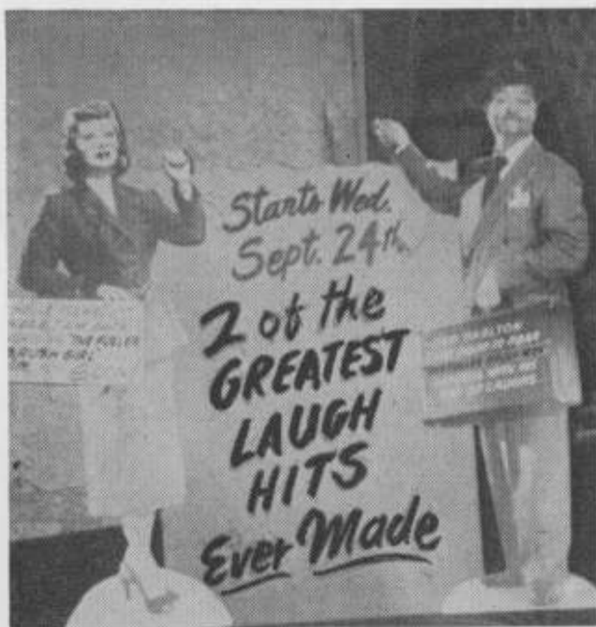
Displays (See Below)