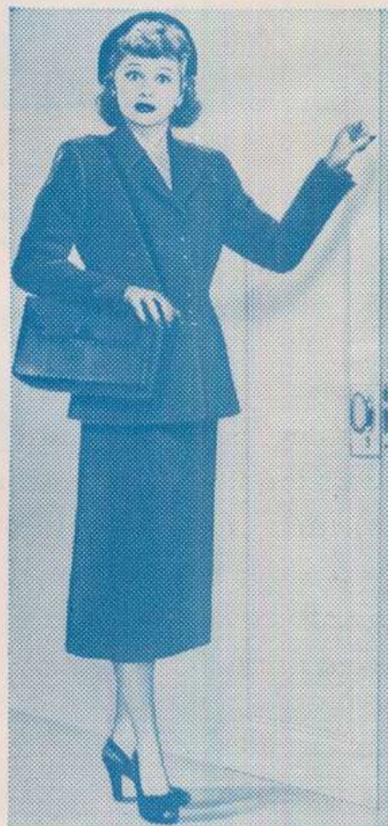
"Fuller Brush Girl" Mat 1-C

RED SKELTON stars in Columbia Pictures' reprint comedy, "The Fuller Brush Man," at the ..... Theatre. Janet Blair co-stars with Skelton.