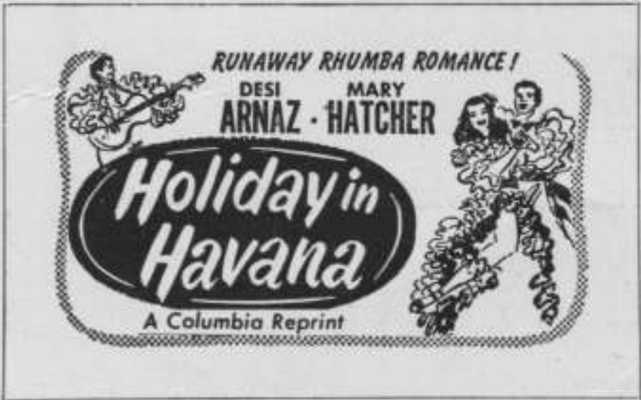
Ad Mat No. 101 R—15 Lines