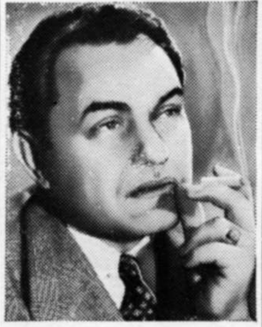
1-Col. Star Cut or Mat TIC—13A