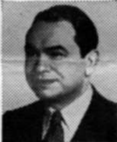
Cut or Mat TIC—2

Edward G. Robinson, who stars as 'Dan Armstrong,' the American ballyhoo artist, in Atlantic Film production, "Thunder in the City," was born in Bucharest, Roumania. Brought to this country by his parents when a very young child. Educated at New York City public schools and at Columbia University, whence he graduated with an M. A. Amateur theatricals and vaudeville led him to