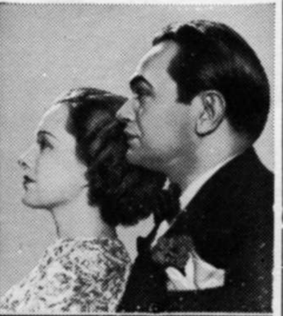
1-Col. Scene Cut or Mat TIC—6A

LULI DESTE and EDWARD G. ROBINSON share the leading roles in "Thunder In The City," which opens ..... at the ..... Theatre. The film is a powerful drama with an abundance of comedy-satire. Robert Sherwood and Aben Kandel collaborated on the script under the direction of Marion Gering.