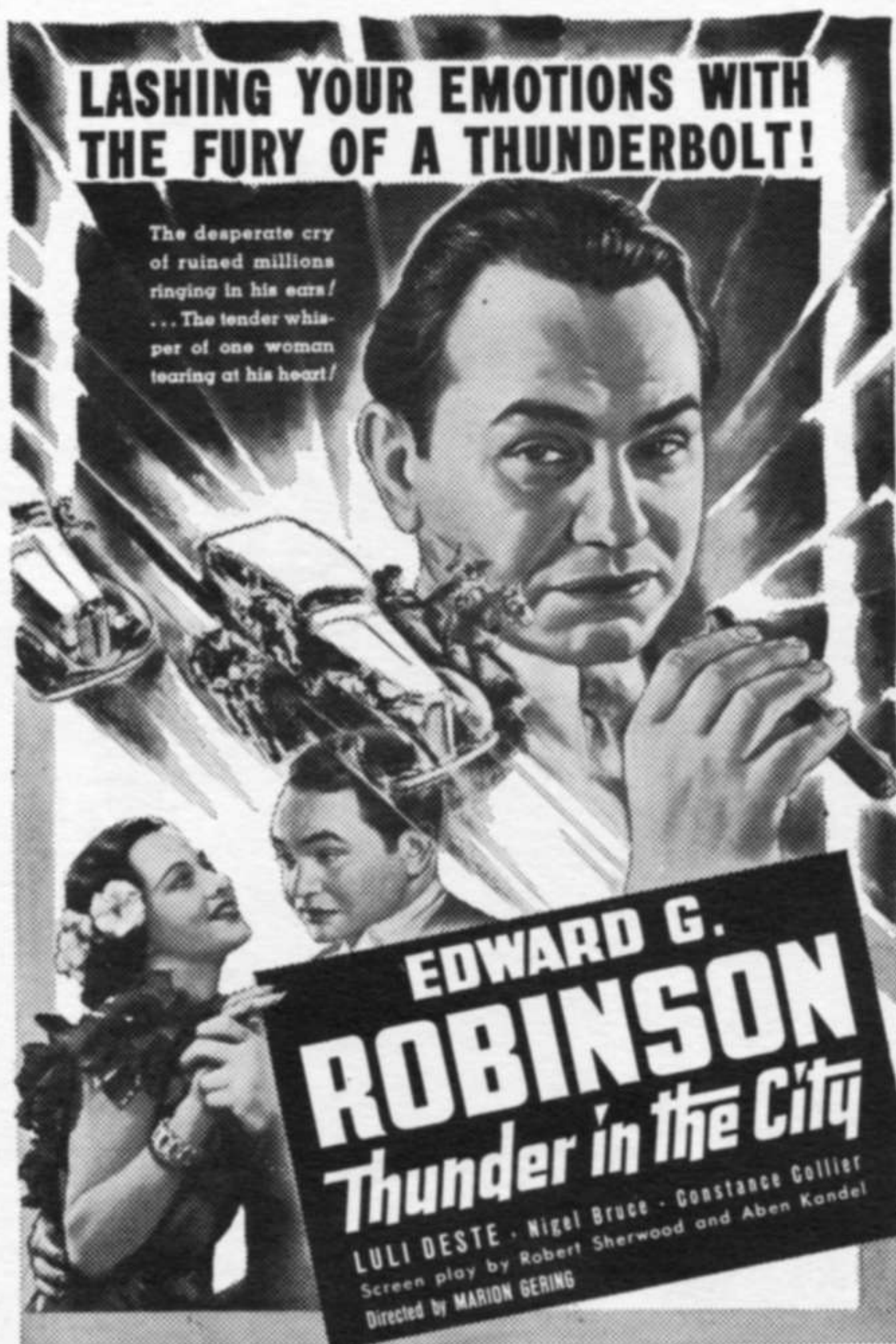
Ad Cut or Mat TIC—15B—2 Col. x 85L