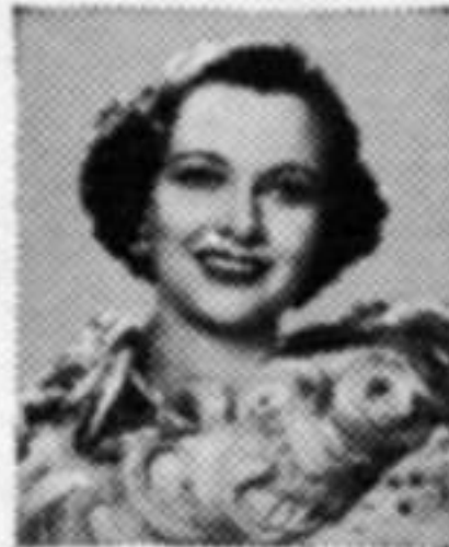
Cut or Mat TIC—1