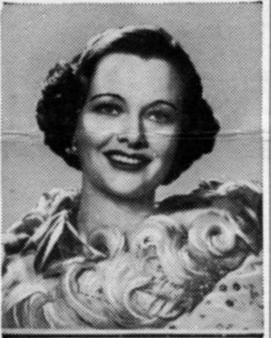
1-Col. Star Cut or Mat TIC—7A

LULI DESTE, continental screen favorite, makes her American debut opposite Edward G. Robinson in "Thunder In The City," which opens ..... at the ..... Theatre. Miss Deste, in private life, is the Baroness Hohenberg of Austria. She has just been placed under long-term contract by Columbia Pictures.