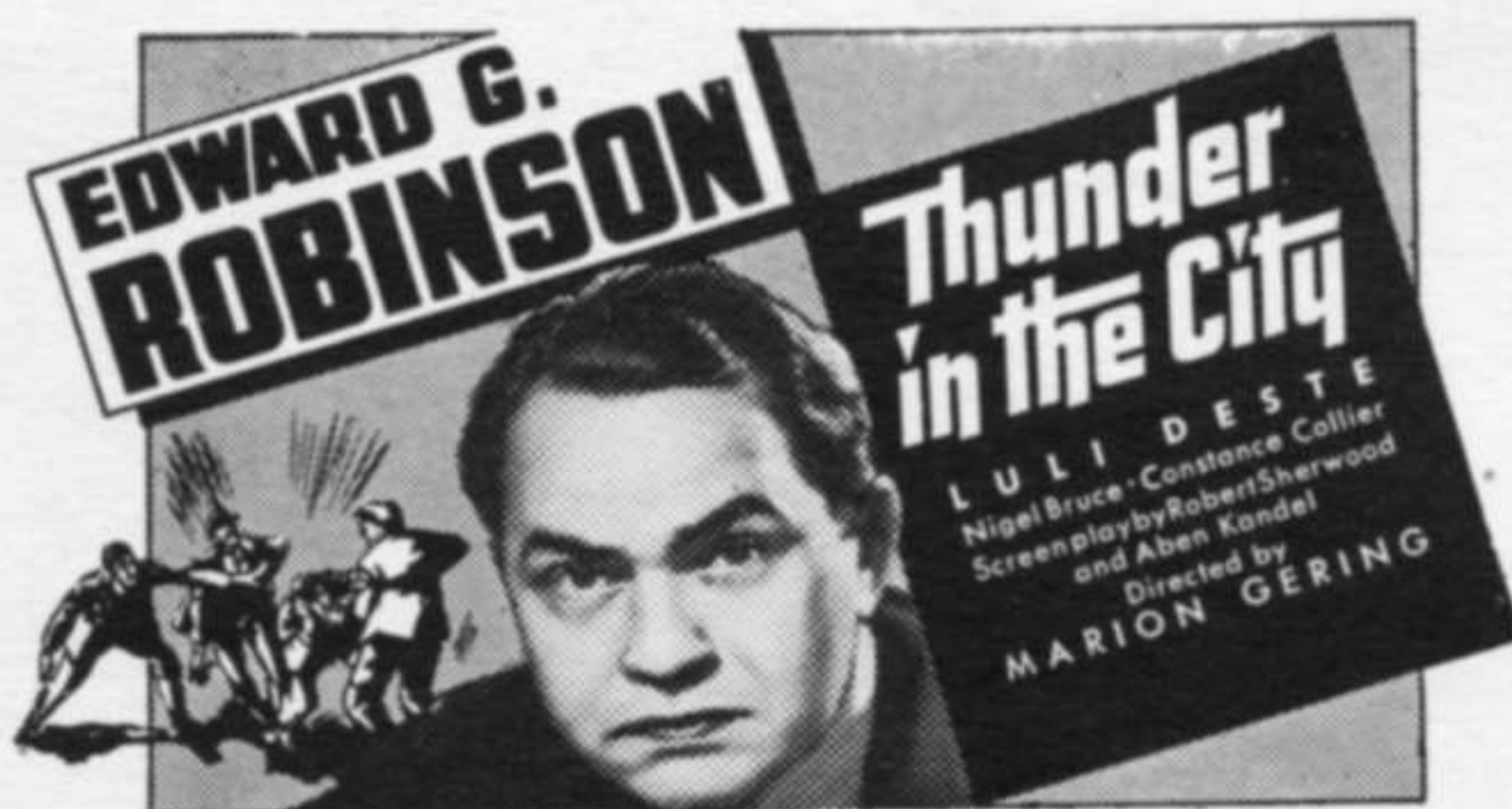
Ad Cut or Mat TIC—17B—2 Col. x 28L