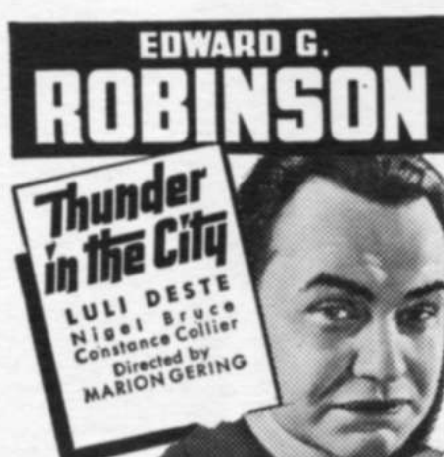
Ad Cut or Mat TIC—23A—I Col. x 30L