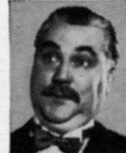
Cut or Mat TIC—3