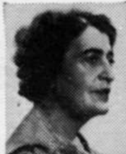
Cut or Mat TIC—4

Constance Collier, who enacts the role of the "Duchess of Glenavon" in Atlantic Film production, "Thunder in the City," with Edward G. Robinson, is one of England's most famous actresses. Born in 1878 of theatrical parents, Miss Collier appeared in "The Silver King" while still a child, and has been on the stage ever since. After appearing under Sir Herbert Tree in a number of Shakespearean productions, she