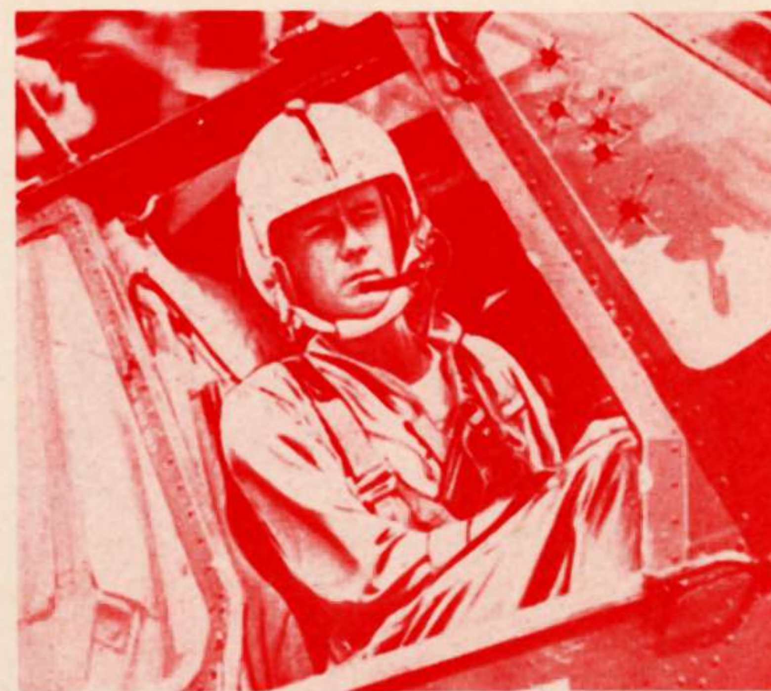
A YANK IN VIET-NAM No. 22

Marshall Thompson carries the beautiful Kieu Chinh to safety in this scene from Allied Artists' "A Yank in Viet-Nam" in which they star. The picture is the first American film to have been filmed in its entirety in Viet-Nam, and much of it was photographed within sound of the raging battles between the South Viet-Nam and the Viet Cong.