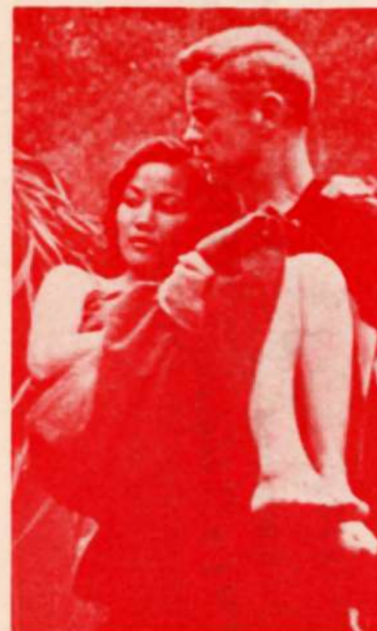
A YANK IN VIET-NAM No. 2