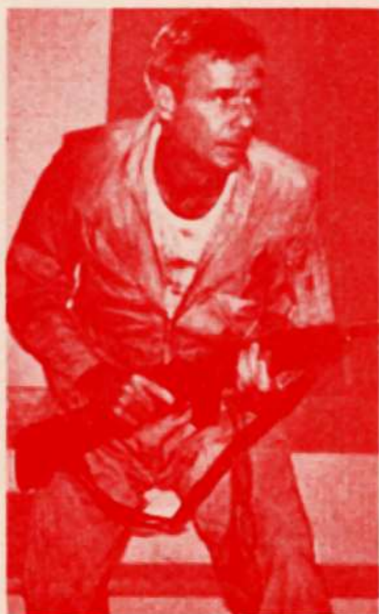
A YANK IN VIET-NAM No. 3