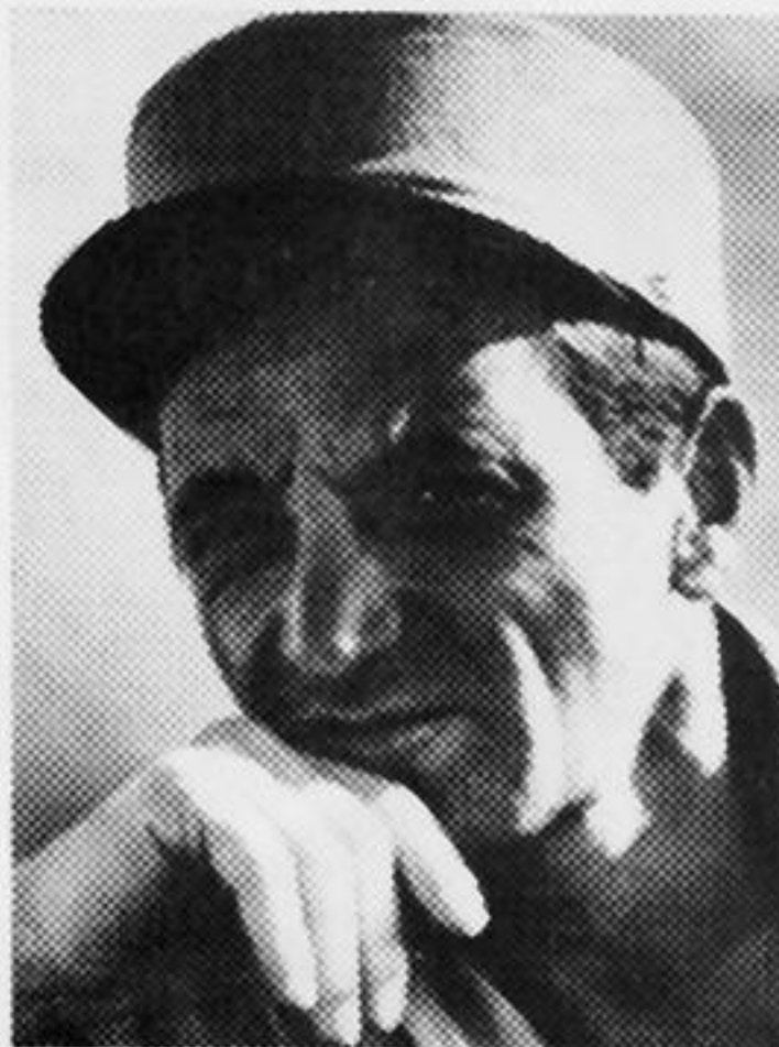
CHARLES AZNAVOUR plays one of the four French Commandos stranded in the North African desert in the taut war drama, "Taxi For Tobruk", opening ..... at the ..... MAT 101

"Taxi For Tobruk" is being released by Seven Arts Pictures.