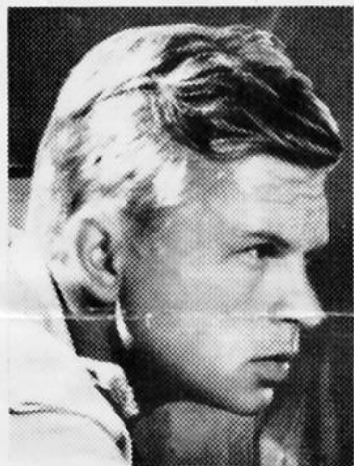
HARDY KRUGER stars in "Taxi For Tobruk", a suspenseful drama of men at war with each other and the enemy. Set in North Africa, the adventure opens ..... at the ..... MAT 102

"Taxi For Tobruk" is being released by Seven Arts Pictures.