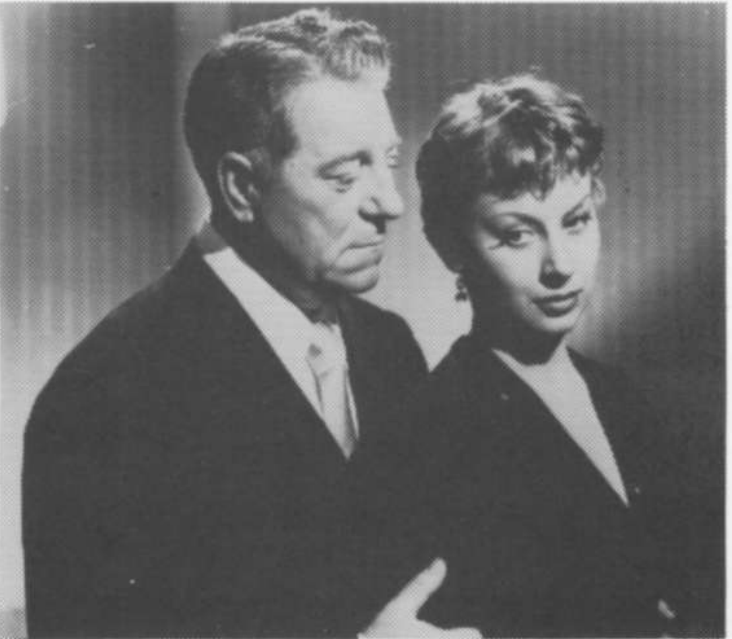
Mat 2B—Jean Gabin and Magali Noel are the lovers in "Razzia," the new shocker by the author of "Rififi," now current at the ..... Theatre.