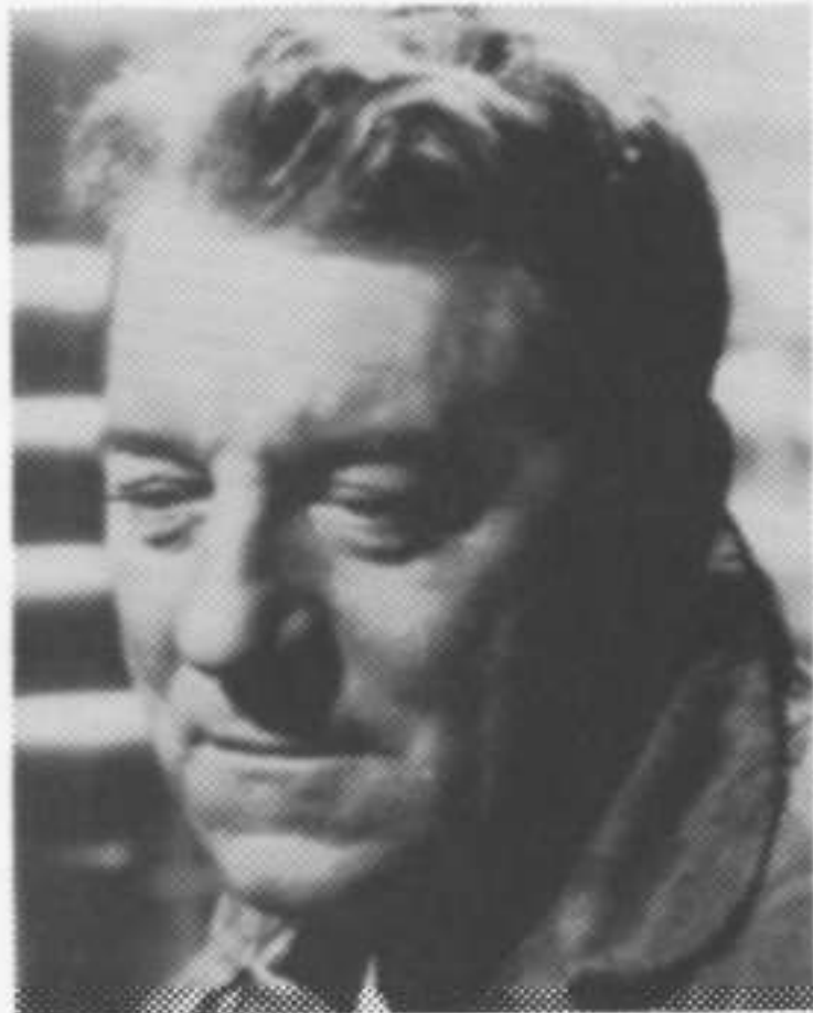
Mat 1B—Veteran Jean Gabin plays the head troubleshooter of the international drug gang, in "Razzia," new shocker by the author of "Rififi," opening on ..... Theatre.