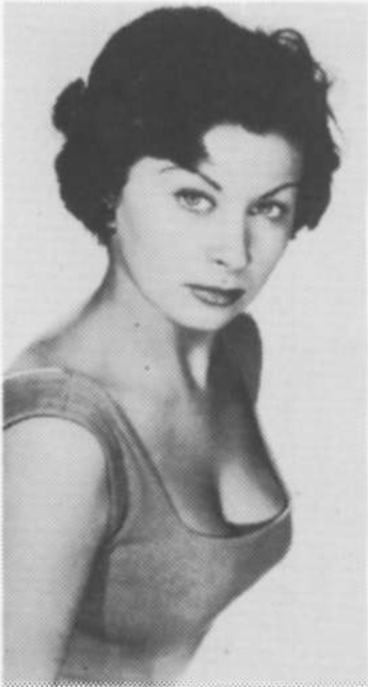
Mat 1A—Magali Noel is the exciting new French star who appears with Jean Gabin in "Razzia," the new shocker by the author of "Rififi," now at the ..... Theatre. (Note: This still is not from the picture.)

Starring Jean Gabin and Magali Noel, "Razzia" is a Kassler Films release, directed by Henri Decoin from the script and novel of the same name by August Le Breton.