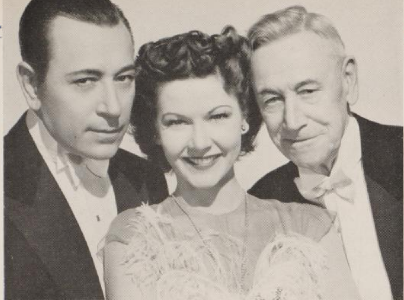
George Raft (L.), pretty Grace McDonald and the veteran Charley Grapewin, have immensely human roles as father, son and daughter, a vaudeville family, in Universal's star-studded feature film, "Follow the Boys." (Mat 31)