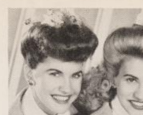
Dazzling Vera Zorina, cast romantically opposite George Raft in Universal's all-star film, "Follow the Boys." (Mat 18)

Young O'Connor is among more than thirty top stars in the cast of "Follow the Boys."