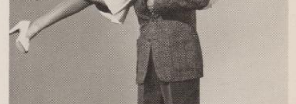
Never a dull moment with young Donald O'Connor and pert Peggy Ryan around. They are seen in Universal's all-star film, "Follow the Boys." (Mat 23)

O'Connor, who is now in the Army Air Forces, also appears in the all-star picture as master of ceremonies in camp shows, introducing Dinah Shore, Jeanette MacDonald, Grace McDonald, Charlie Spivak's orchestra and others.