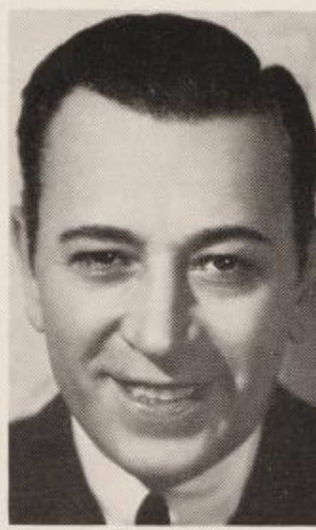
Dynamic George Raft has top male role in Universal's multi-starred feature production, "Follow the Boys."

(Current) Before Dinah Shore began work in Universal's "Follow the Boys," current at the theatre, she was quoted in an interview as saying that she would have none of these quick Hollywood marriages. Before the picture was finished she had eloped with George Montgomery.