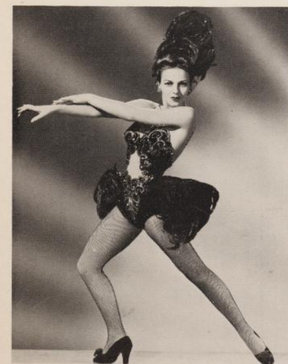
One of the world's greatest contemporary ballerinas, beautiful Vera Zorina, essays a dramatic film role, opposite George Raft, in Universal's "Follow the Boys."