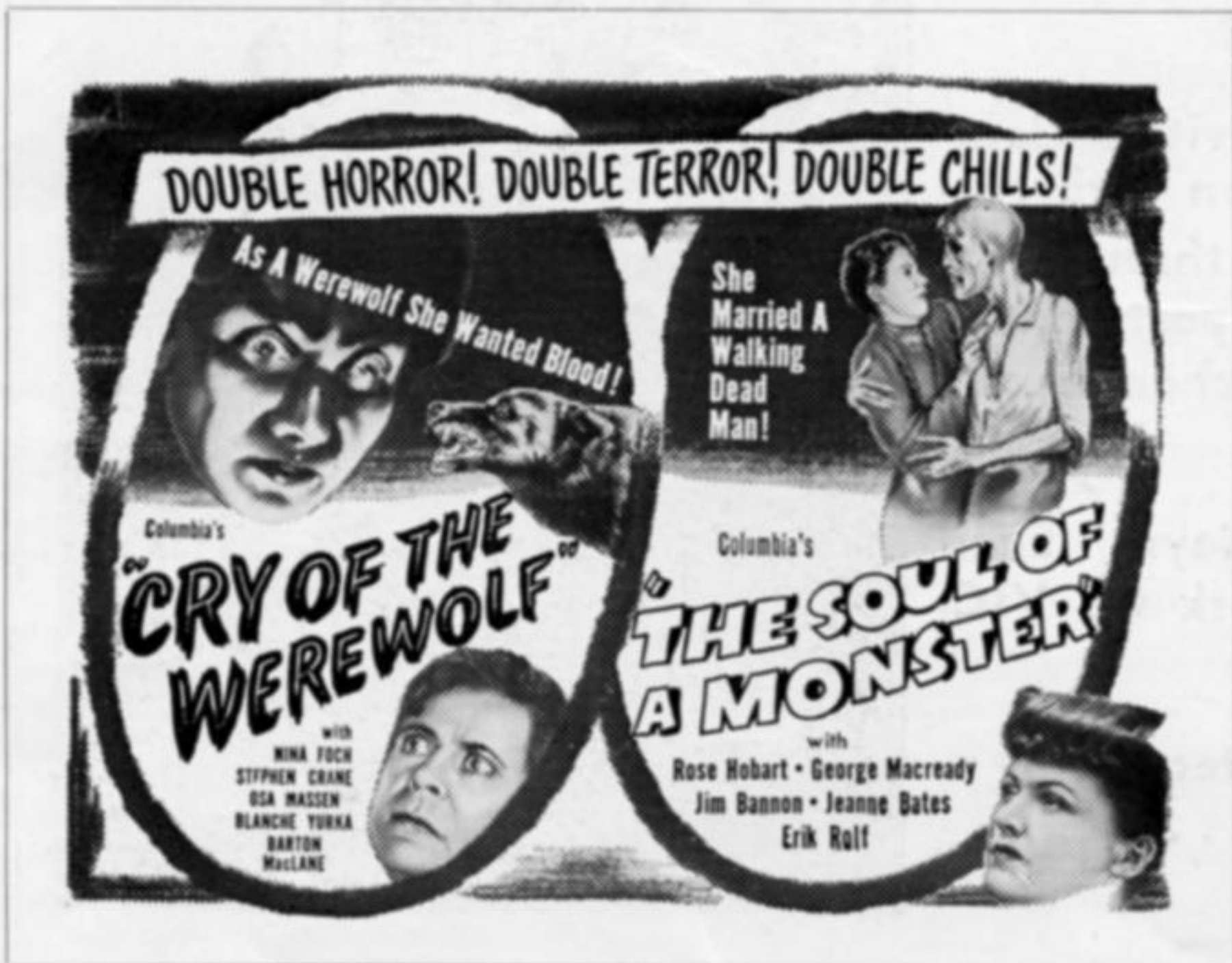
86-Line Ad Mat CWSM-15B—2 Cols. x 43 Lines