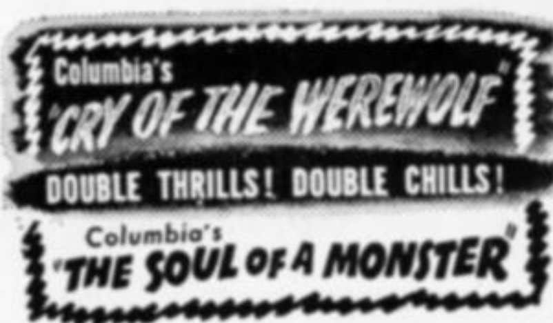
15 Lines—I-Col. Ad Mat CWSM-11A

All Mats: 15c Per Column at your Columbia Exchange