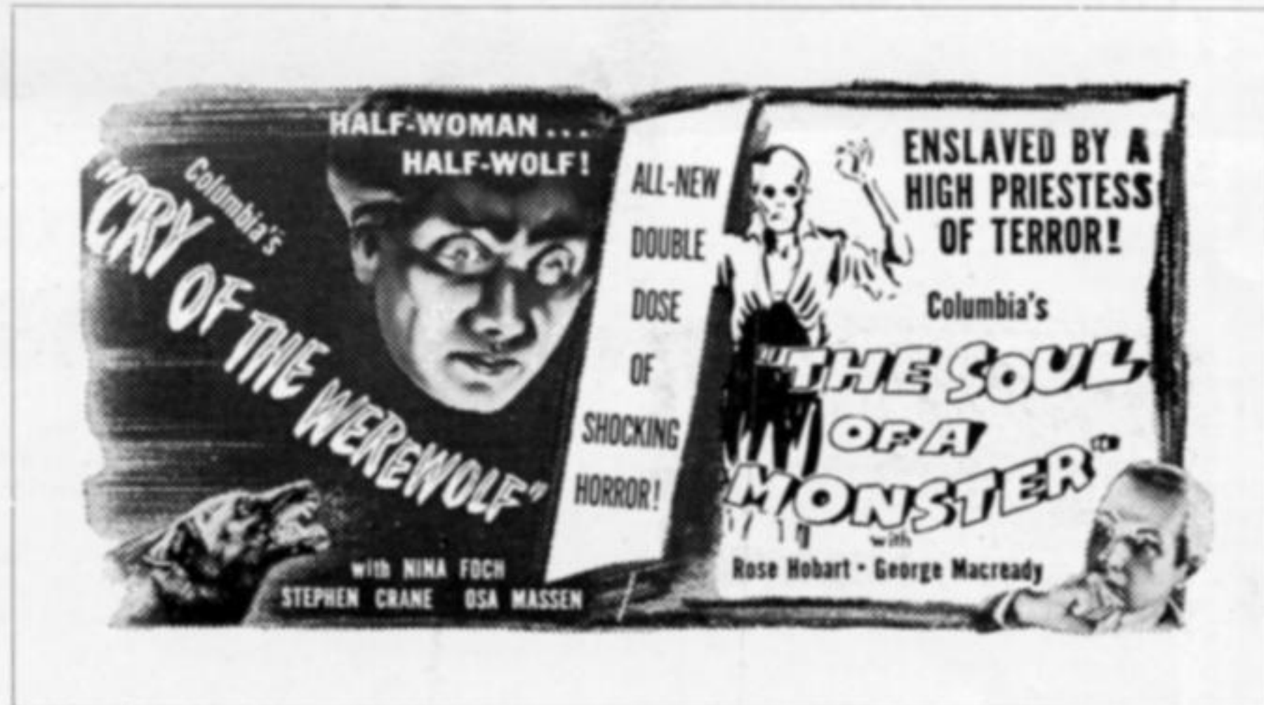
54-Line Ad Mat CWSM-6B—2 Cols. x 27 Lines