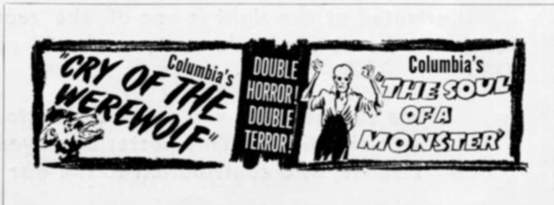
30-Line Ad Mat CWSM-16B—2 Cols. x 15 Lines