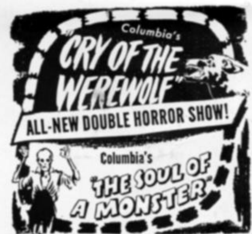
26 Lines—I-Col. Ad Mat CWSM-12A