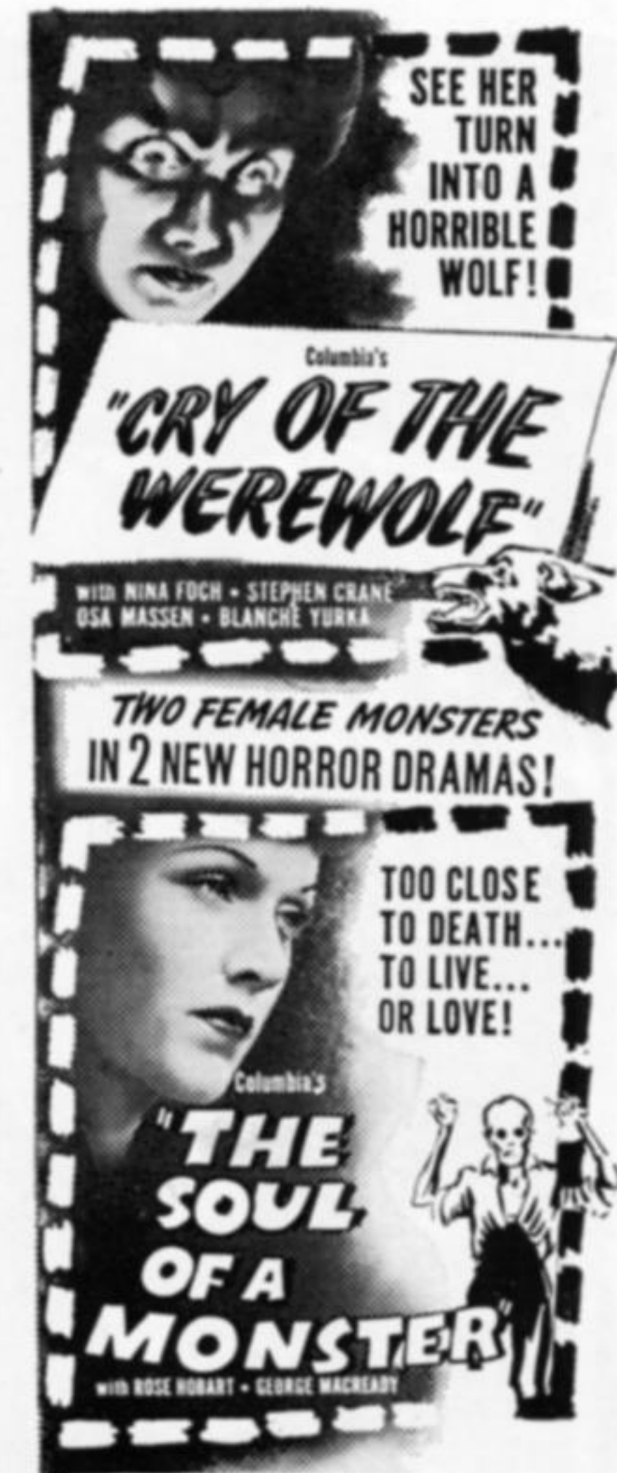
73 Lines—I-Col. Ad Mat CWSM-10A

All Mats: 15c Per Column at your Columbia Exchange