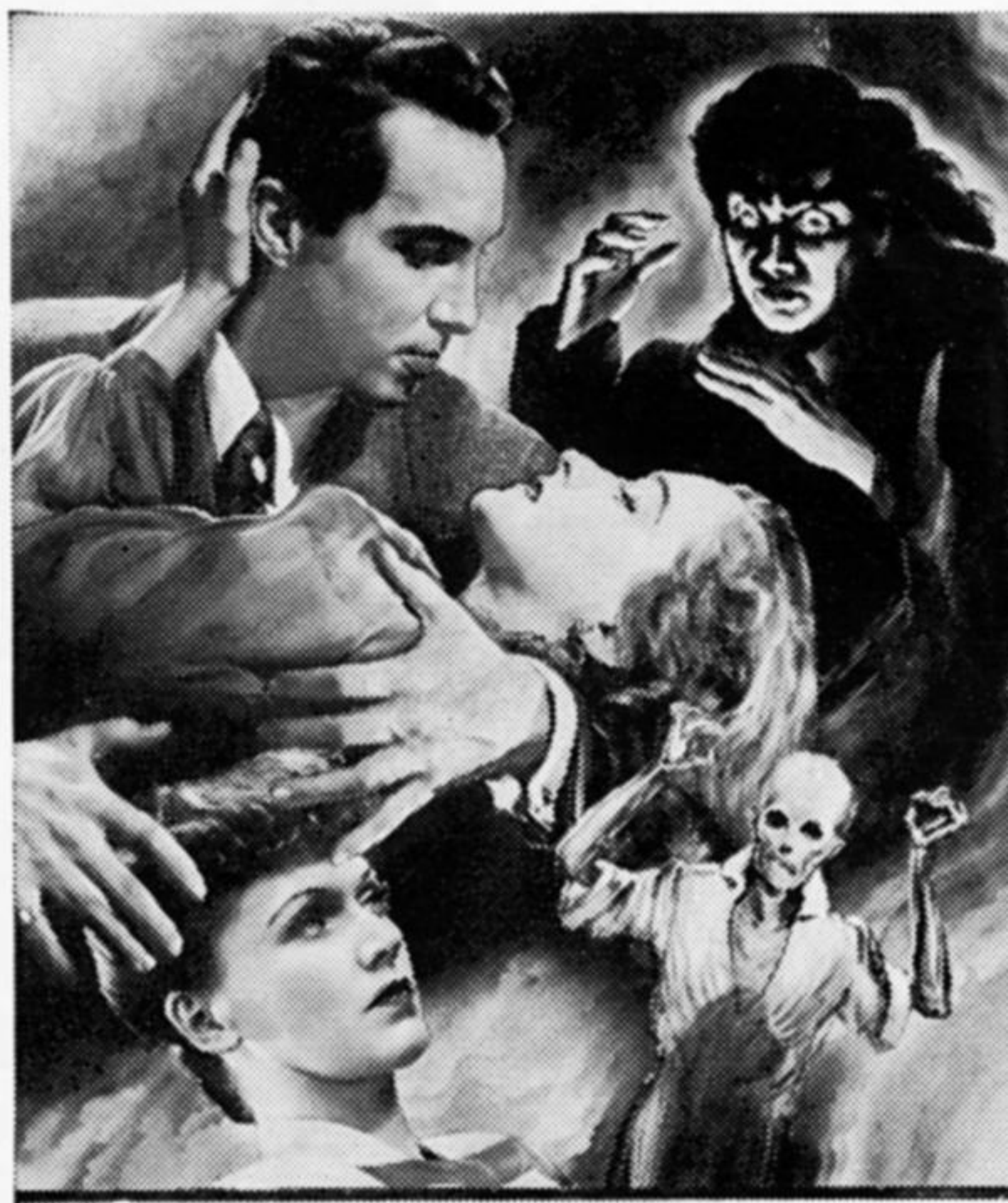
Stills used are 1037-55 and 1037-Art 1, 1044-6 and 1044-Art 2.