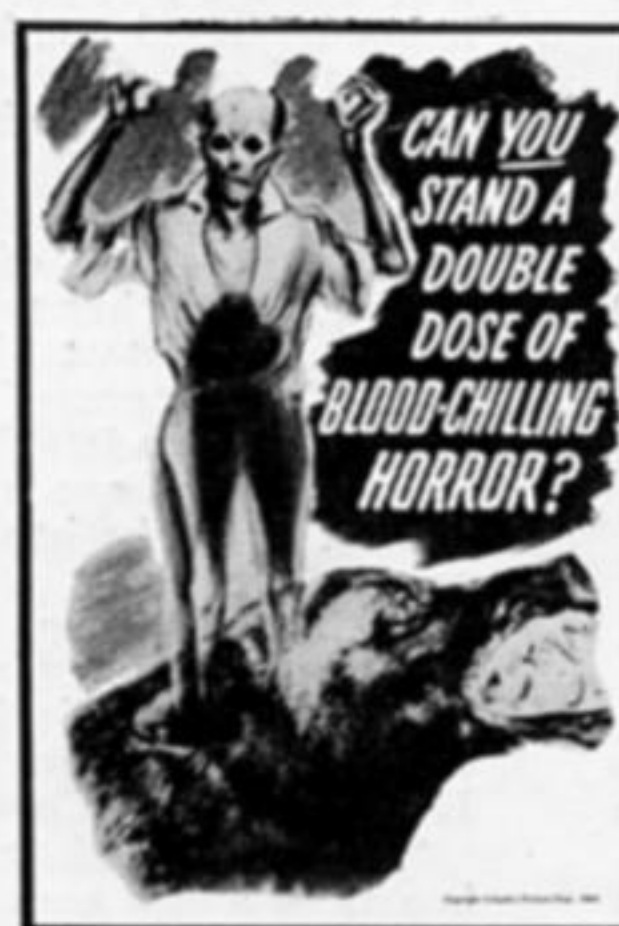
6" x 9" COVER