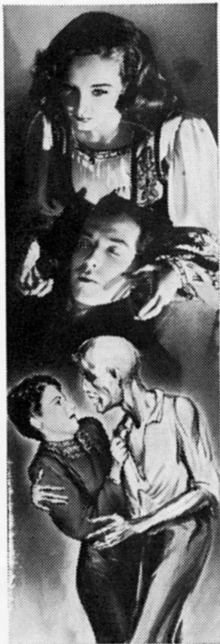
Stills used are 1037-3 and 1044-Art 1.

For double horror, double terror, double chills don't miss this double bill at the Theatre.