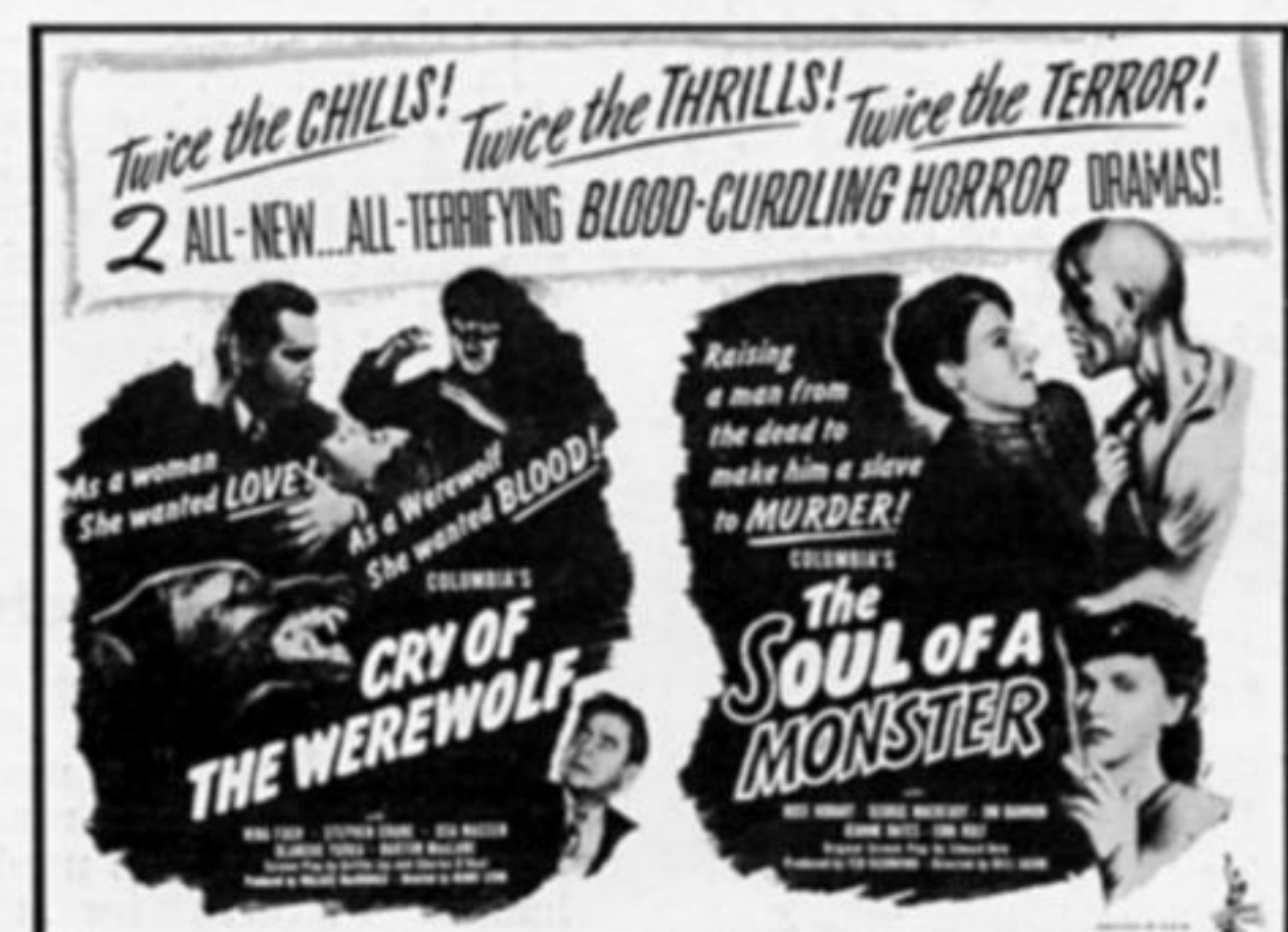
9" x 12" CENTER SPREAD