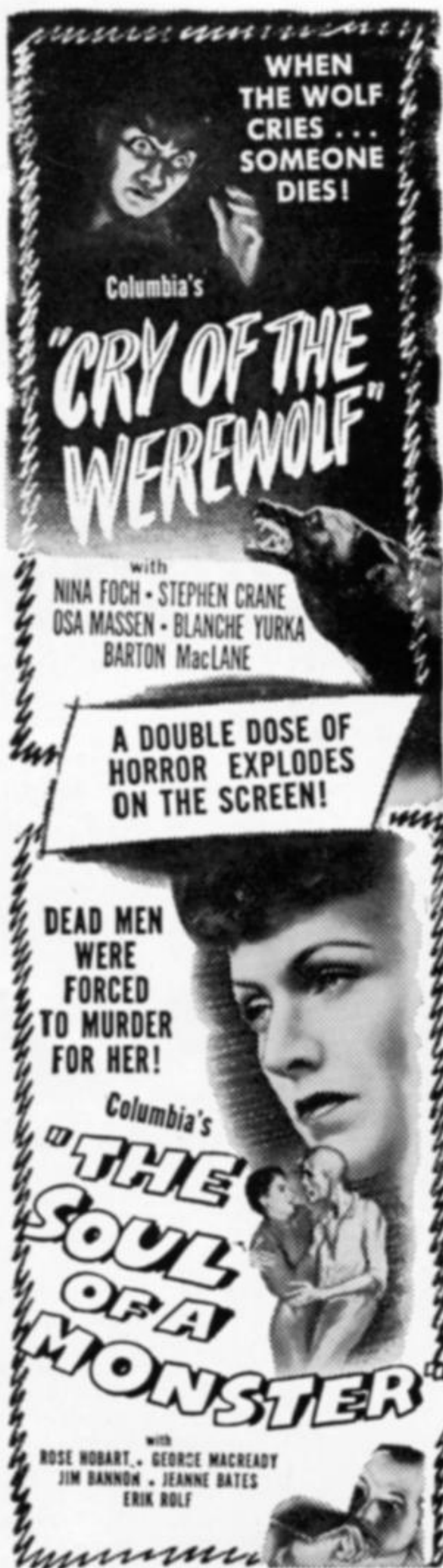
99 Lines—I-Col. Ad Mat CWSM-13A