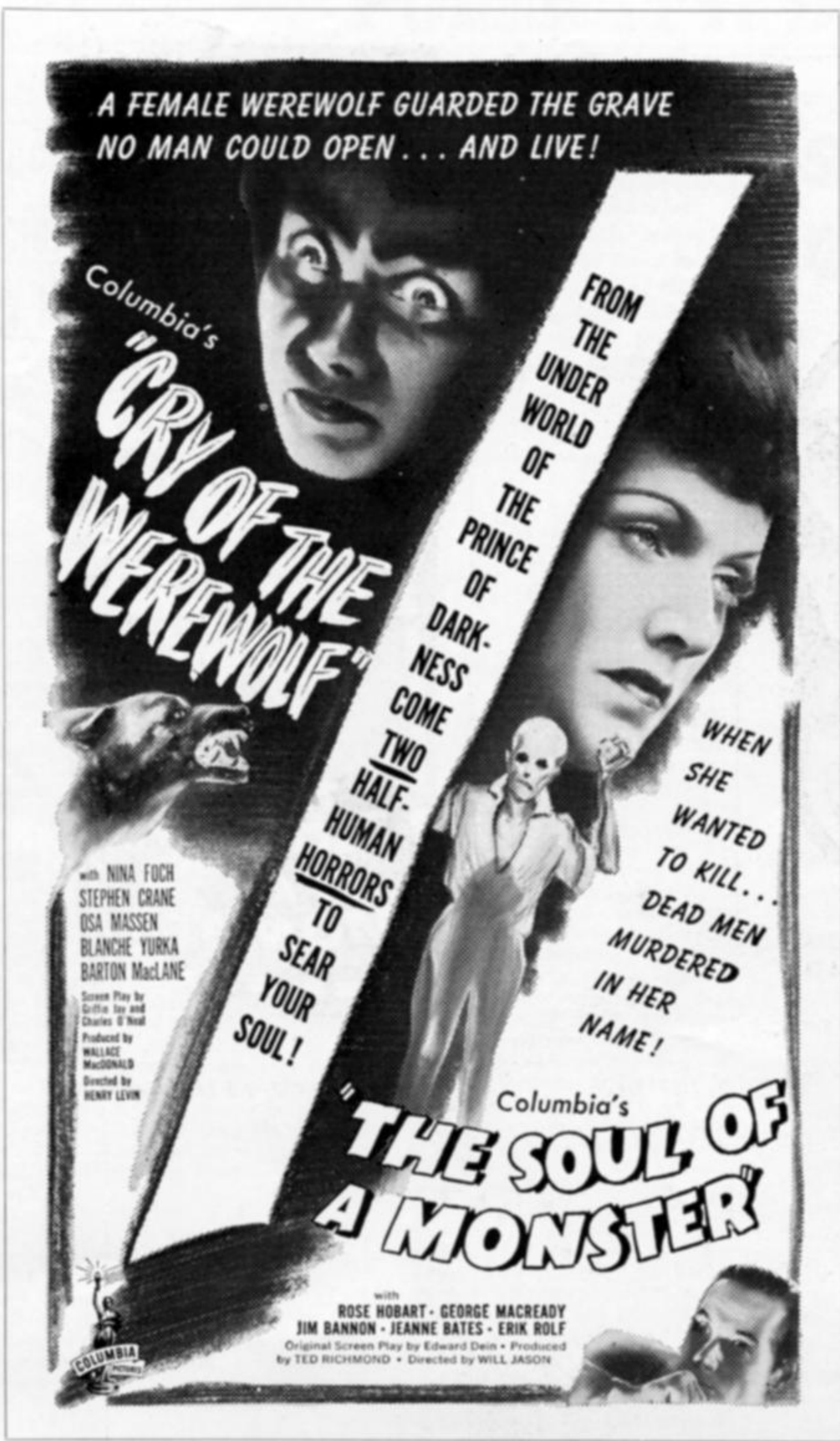
200-Line Ad Mat CWSM-7B—2 Cols. x 100 Lines