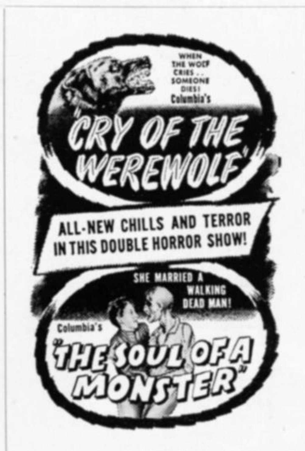
45 Lines—I-Col. Ad Mat CWSM-14A