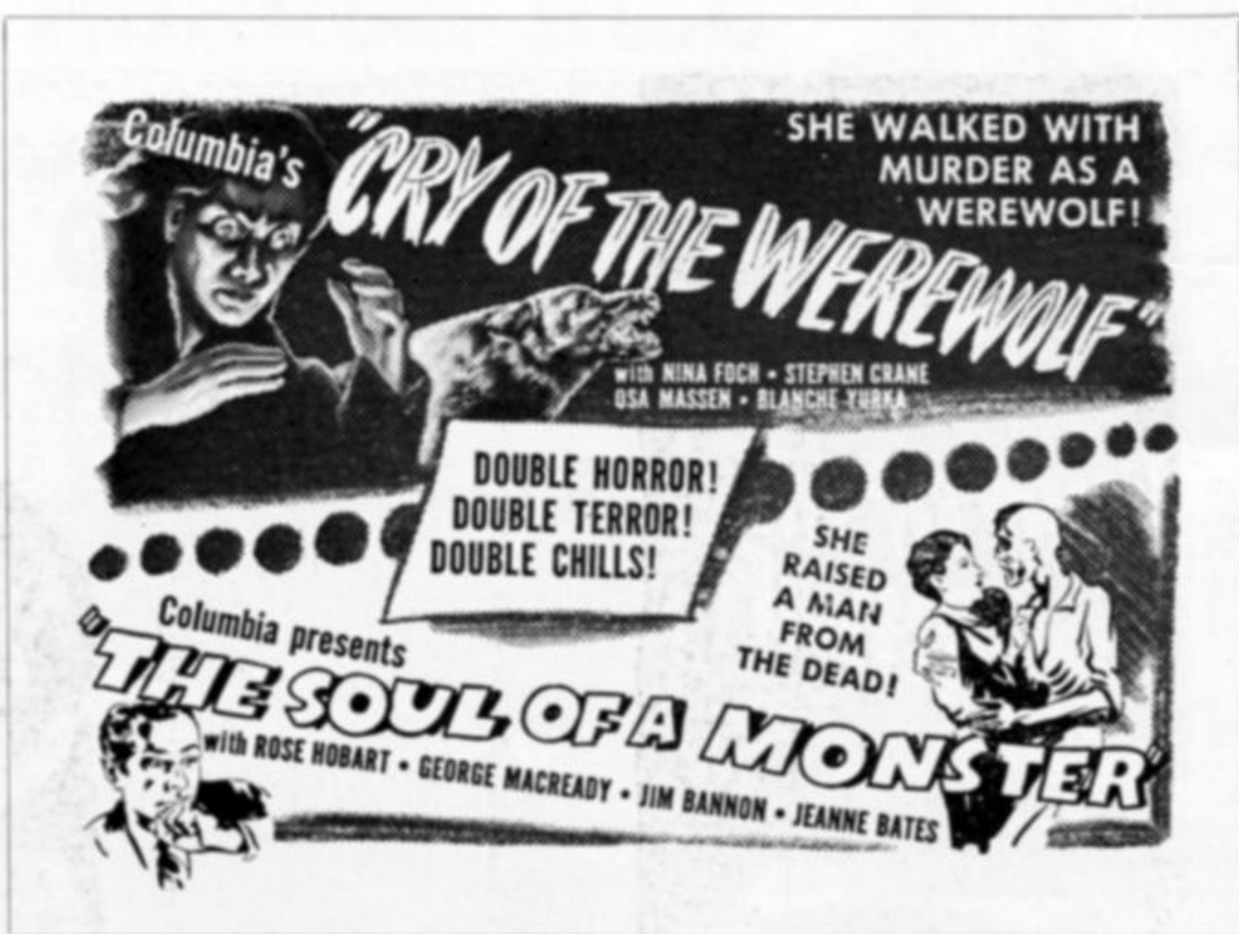
80-Line Ad Mat CWSM-9B—2 Cols. x 40 Lines