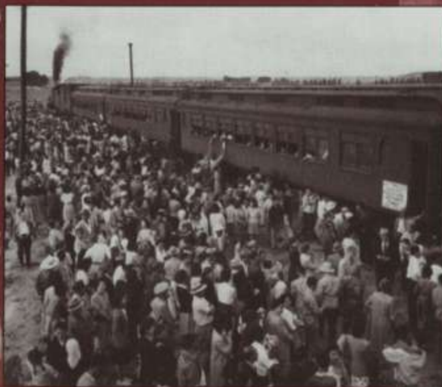
Yone Kubo, WRA