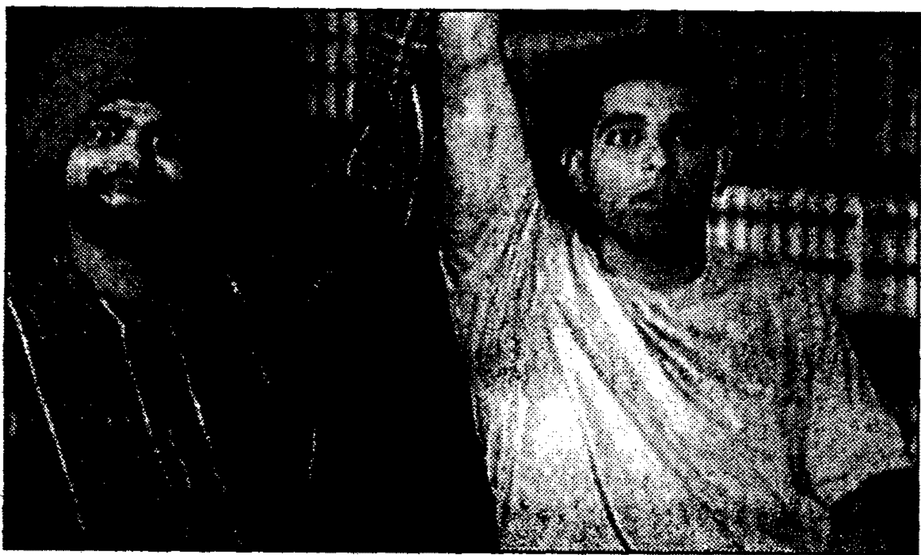
"Jagjit" gives "Kris" a hand in American Desi .