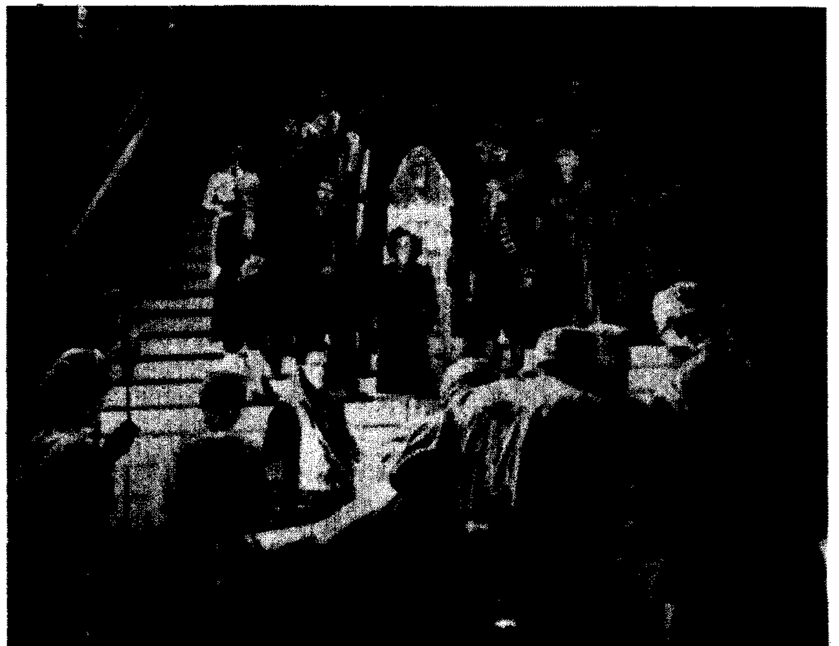
Stairway to Heaven

THE LIFE AND DEATH OF COLONEL BLIMP - "Called 'defeatist' by its critics, pronounced 'disgraceful' by Winston Churchill (who tried to terminate production, attended the film's premiere, and then issued multiple memoranda attempting to halt its export), THE LIFE AND DEATH OF COLONEL BLIMP provides a sardonic course in British military history. Its dubious hero, Clive Candy (Roger Livesey) is based on a jingoist cartoon character, Colonel Blimp. In a brilliant color trip through one man's fantasy of history, Candy describes in flashback how the years have mellowed him from the hothead he likes to think he was at the time of the Boer Wars to the lukewarm, harmless bumbler he in fact is in 1942." — Pacific Film Archive (1943, 153 min. Print courtesy of the British Film Institute, with permission of Rank Films Distributors Ltd.) Sunday, April 26 at 7 p.m. (TENTATIVE—call 664-2606 for confirmation.)