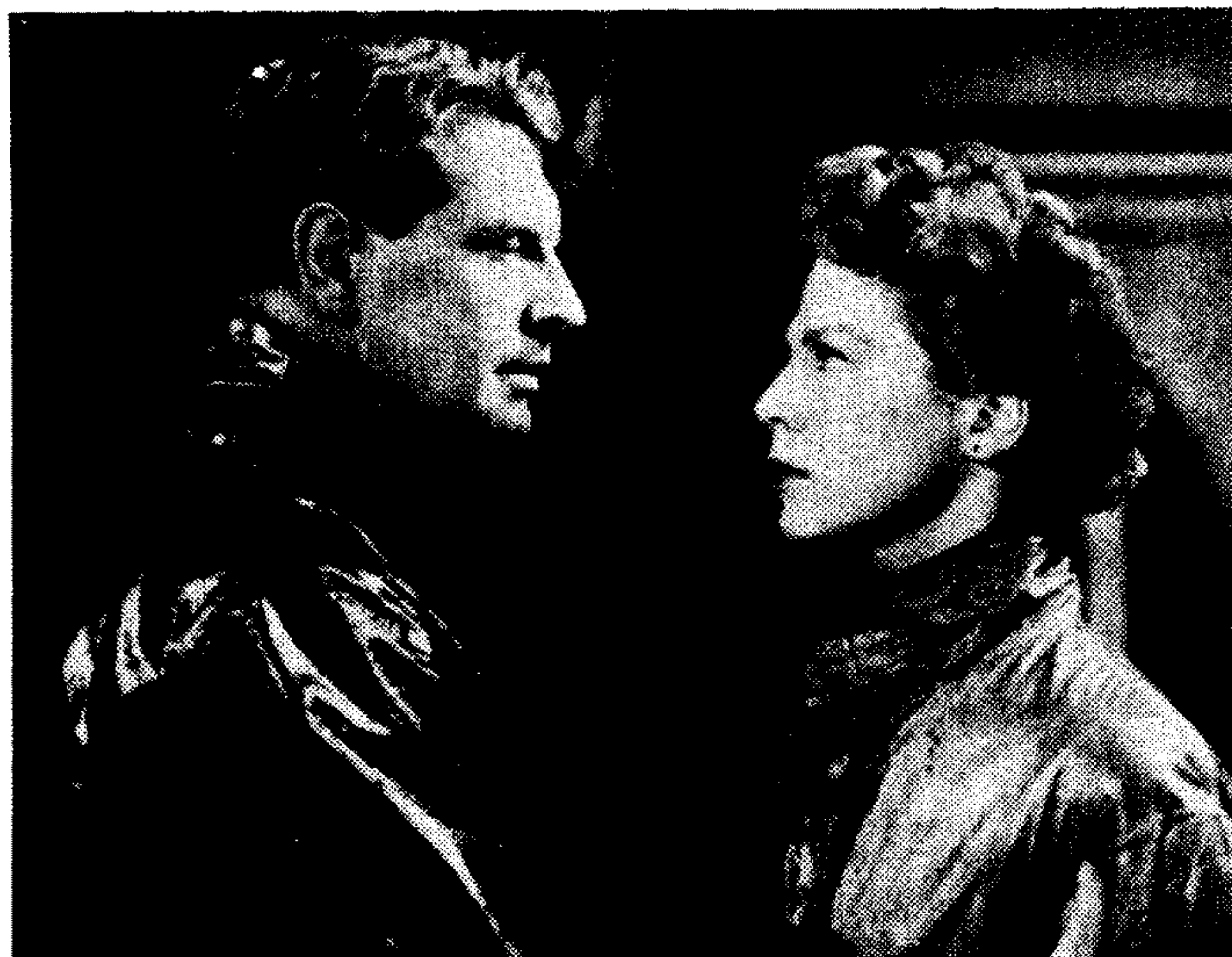
I Know Where I'm Going

THE THIEF OF BAGDAD - The Arabian Nights tale about a wily thief who outwits the Grand Vizier was enhanced in this 1940 film version by magnificent Technicolor photography, awesome sets and phantasmagorical special effects. Directed by Ludwig Berger, Tim Whelan and Michael Powell. (106 min.) Sunday, April 19 at 5 p.m.