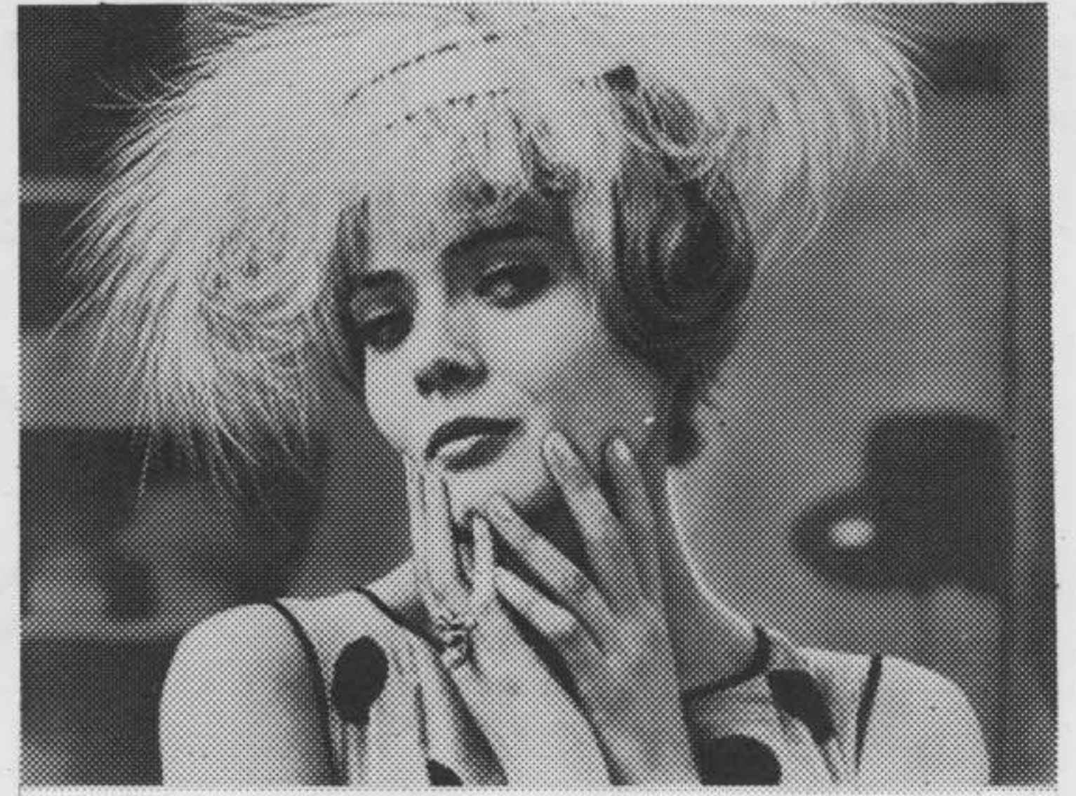
2B "CLEO FROM 5 TO 7"

Miss Varda will shortly commence her next feature which is entitled "MELANGITE" ("Medley"). Monica Vitti will be the star with the producers once again, Ponti and de Beauregard, who evidently also appreciate Miss Varda.