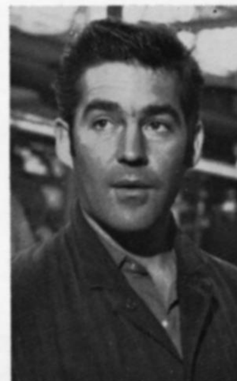
Michael Craig stars in the role of Joe in "The Angry Silence," which also stars Richard Attenborough, and Pier Angeli. Based on one of the most dramatic true incidents ever to hit a small mill town, the picture was directed by Guy Green and produced by Richard Attenborough.