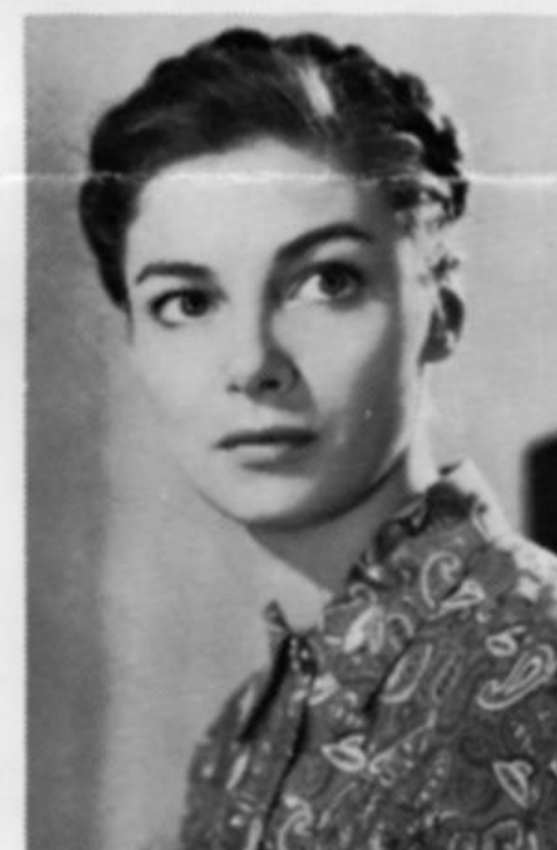
Pier Angeli stars in the role of Anna in the Beaver-Films production of "The Angry Silence". The picture, suggested by one of the most dramatic true incidents in post-war England, also stars Richard Attenborough, Michael Craig and Bernard Lee.

outside London. He's a man's man—as well as attractive to the fair sex—frequents the local pub and relaxes at poker, often for higher stakes than he can afford.