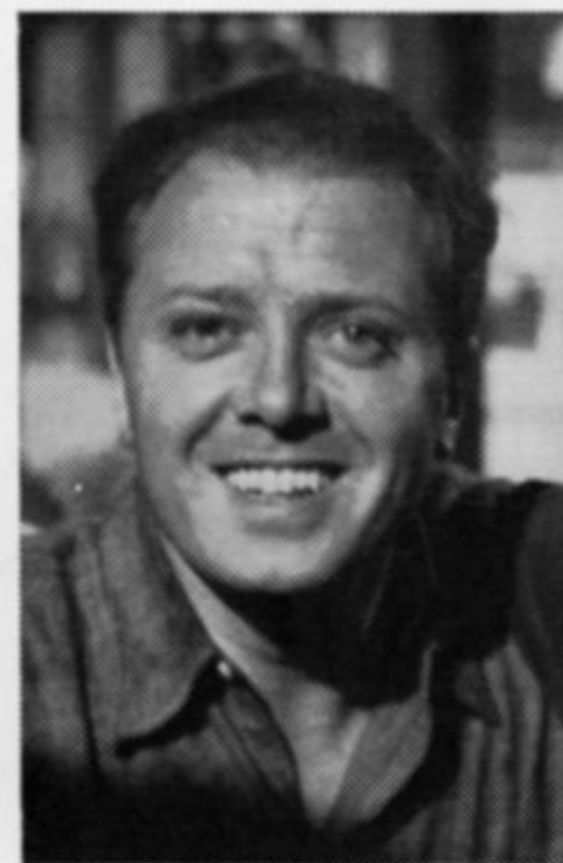
Richard Attenborough, star and producer of “The Angry Silence”, the film destined to become a motion picture classic. The picture also stars Pier Angeli, Michael Craig and Bernard Lee.