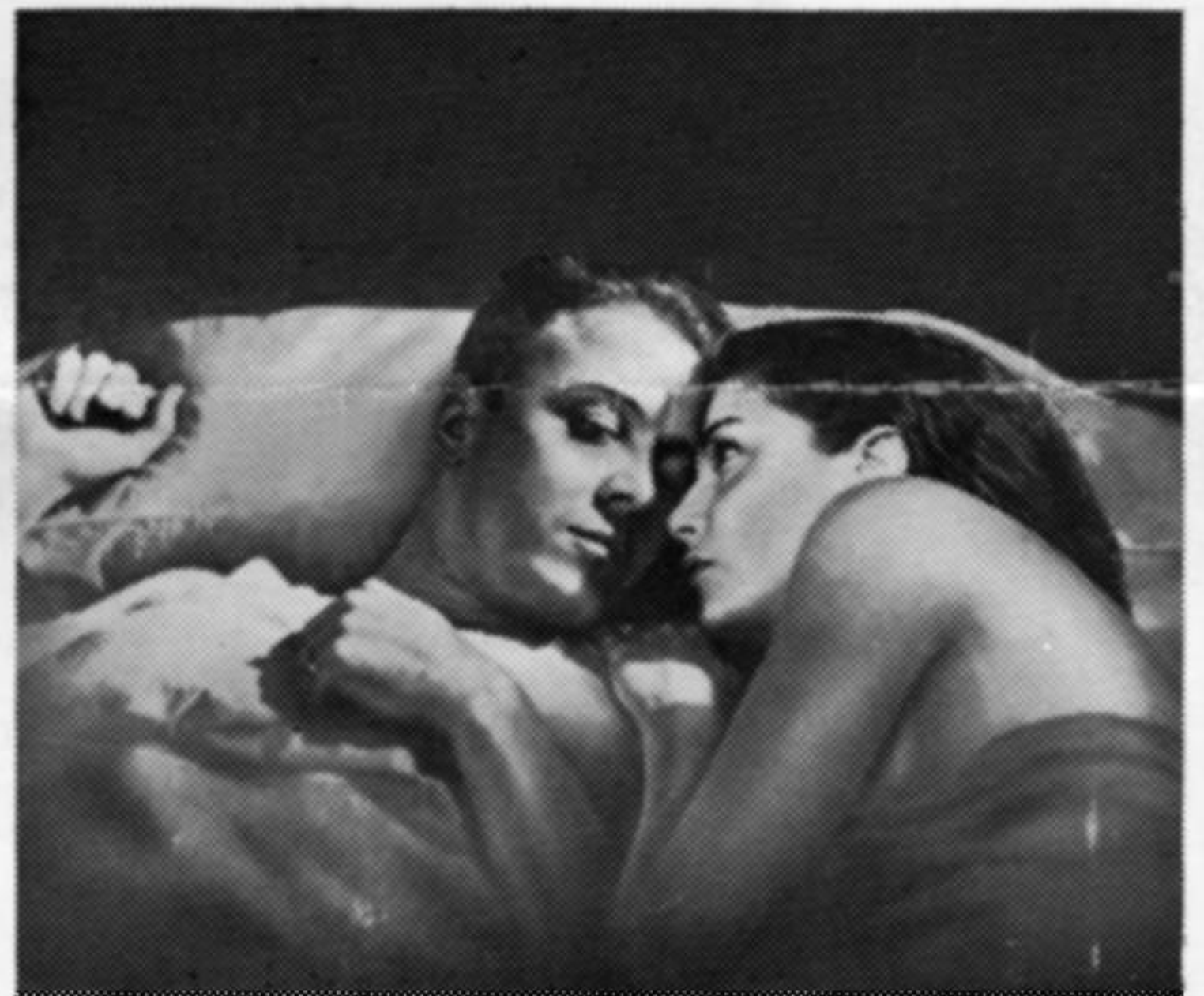
Tom (Richard Attenborough) convinces his wife, Anna (Pier Angeli) that he is glad that she is going to have another baby. Their joy soon turns to sorrow, however, as worry upon worry is piled on him when his fellow workers ‘send him to Coventry’ for not joining the unauthorized strike.