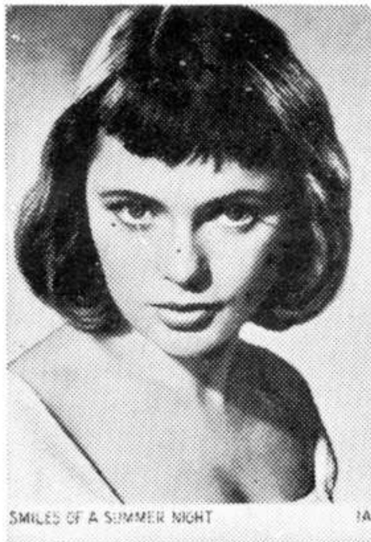
Ulla Jacobsson, brilliant young feminine star of the sparkling comedy, "Smiles Of A Summer Night," now playing at the Theatre.