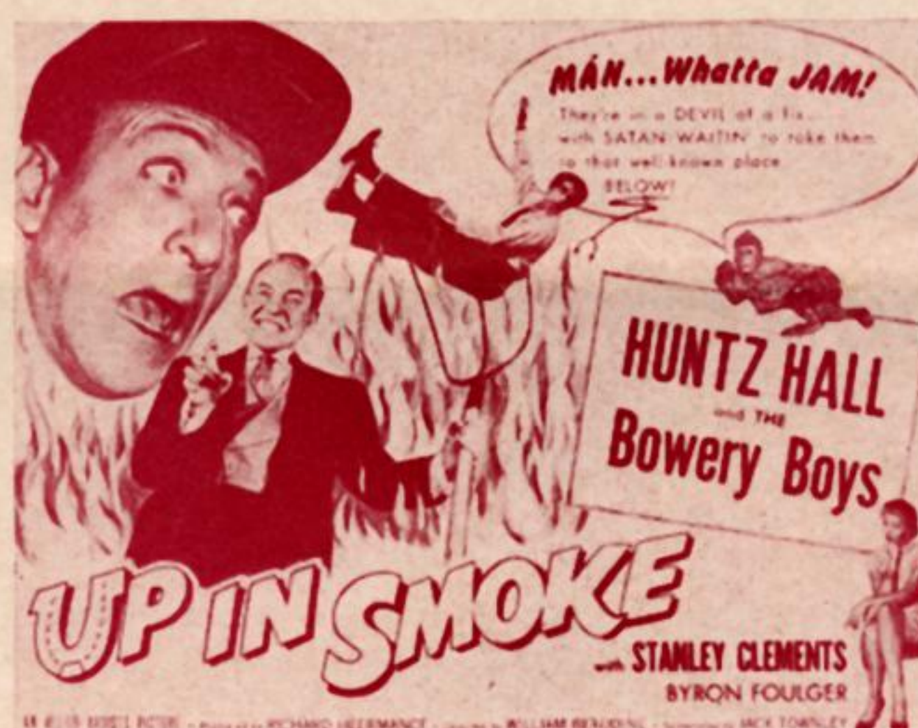
22 x 28 LOBBY CARD (B)