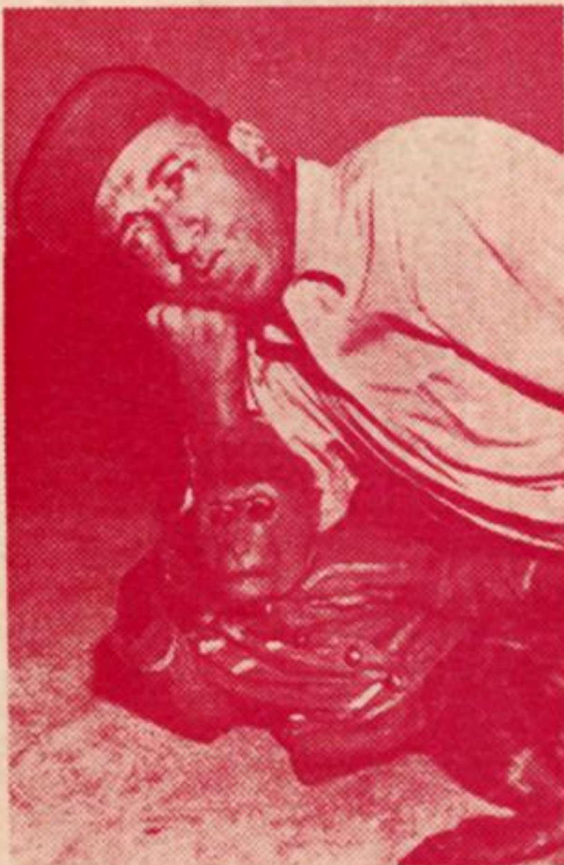
UP IN SMOKE

Hall finds himself in a heck of a predicament in this film because he sells his soul to Satan in return for winners at the race track. The picture has been described by critics as one of the best of the Bowery Boys.