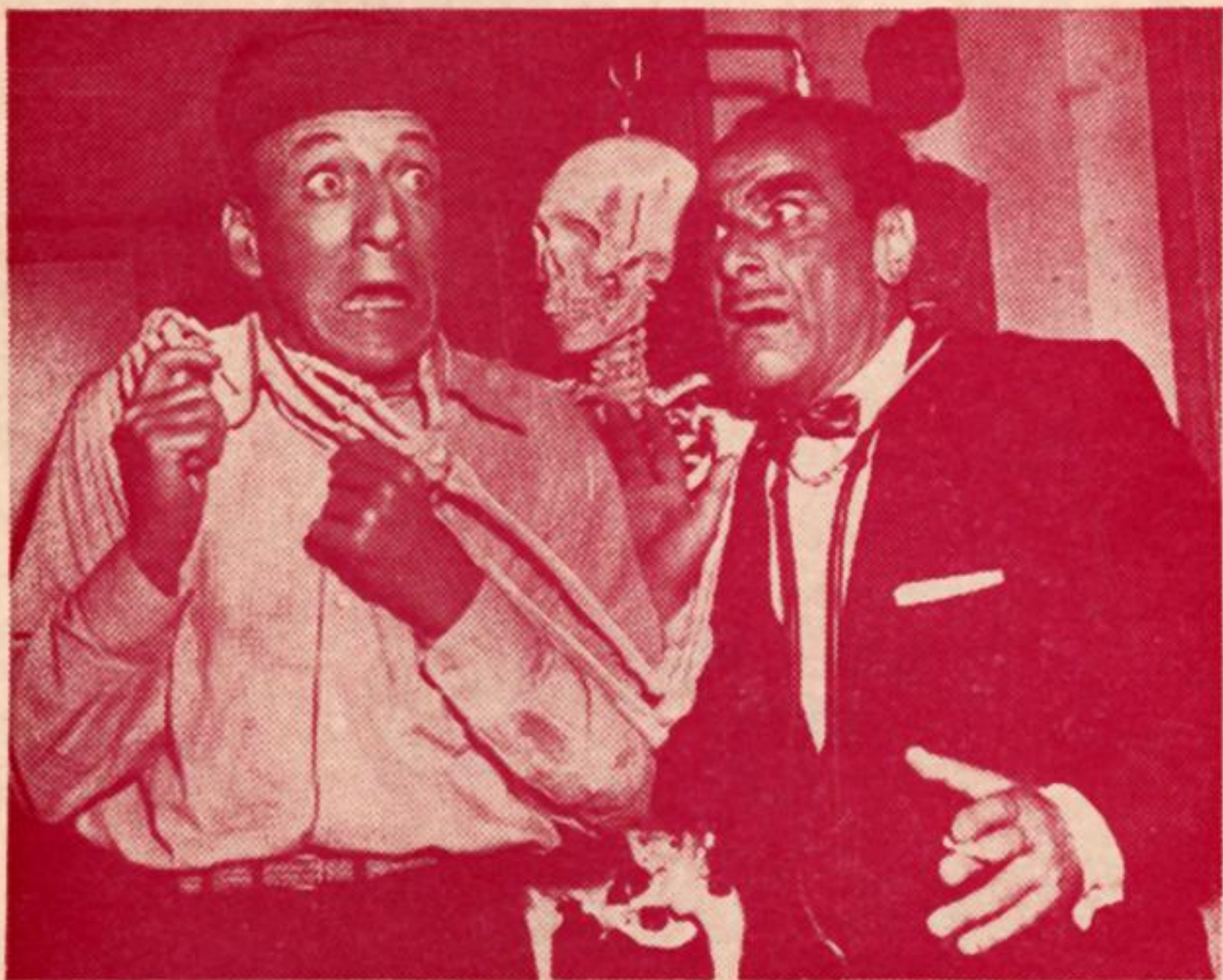
UP IN SMOKE