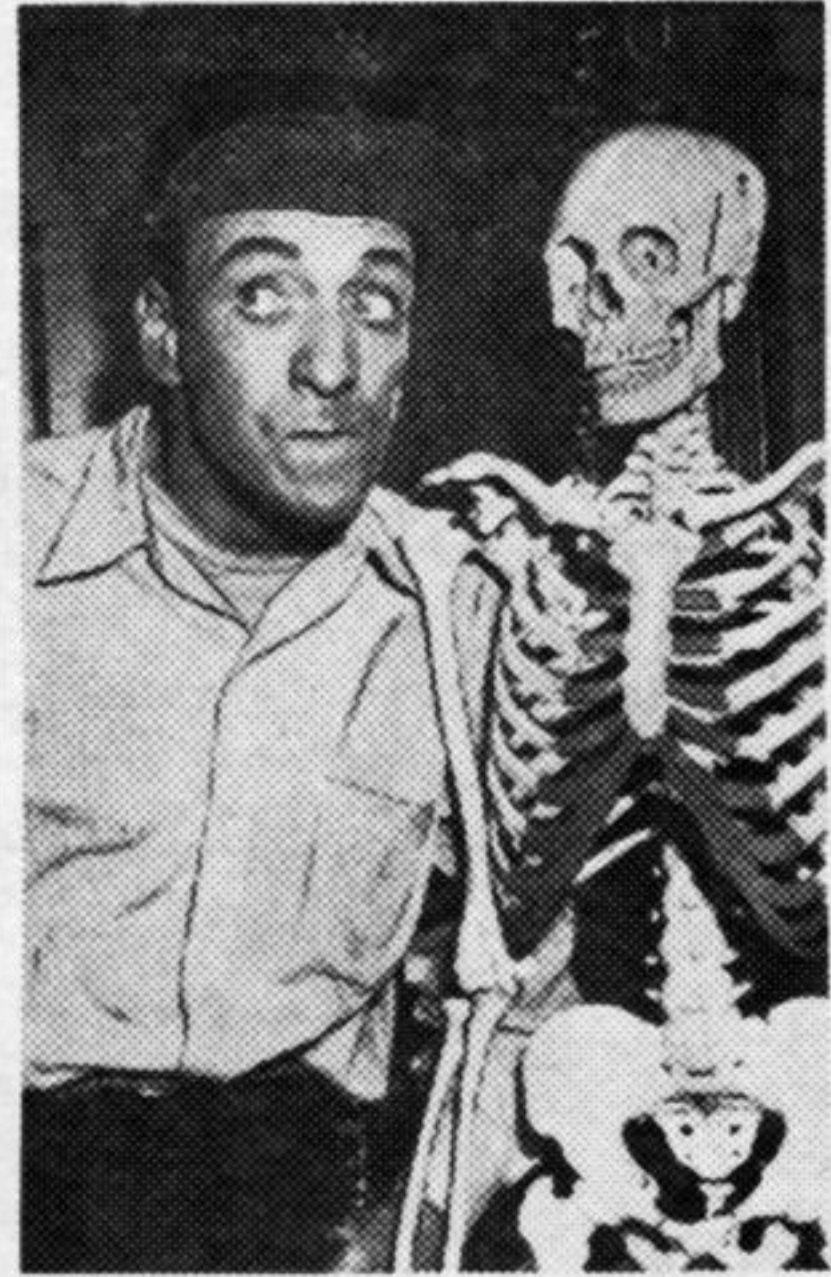
UP IN SMOKE NO. 2