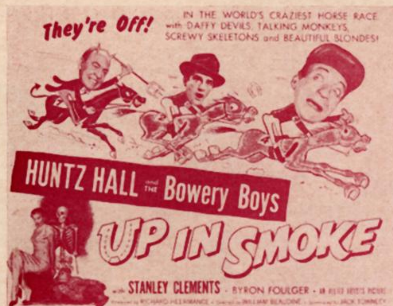
22 x 28 LOBBY CARD (A)