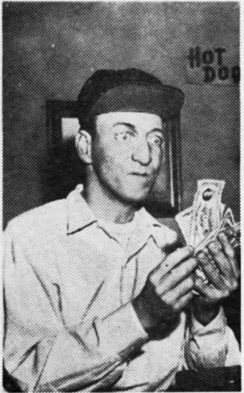
UP IN SMOKE NO. 3

Huntz Hall, starred with the Bowery Boys in Allied Artists' current comedy hit, "Up In Smoke," now at the theatre, has starred in literally scores of pictures during his Hollywood career. The youthful veteran, who made his screen debut as one of the "Dead End Kids" in 1937, has appeared in more than 100 pictures during his enduring career.