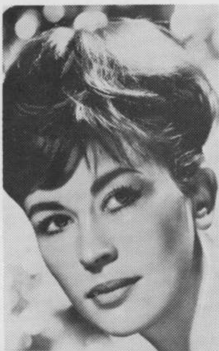
LOVELY Nanette Newman as she appears sans bathtub in the hilarious, suspense screen-thriller, "The League of Gentlemen."

Jack Hawkins has the leading role of the retired colonel, master mind of the plan. Hawkins was featured in "The Bridge on the River Kwai" and is currently appearing in "Ben-Hur."