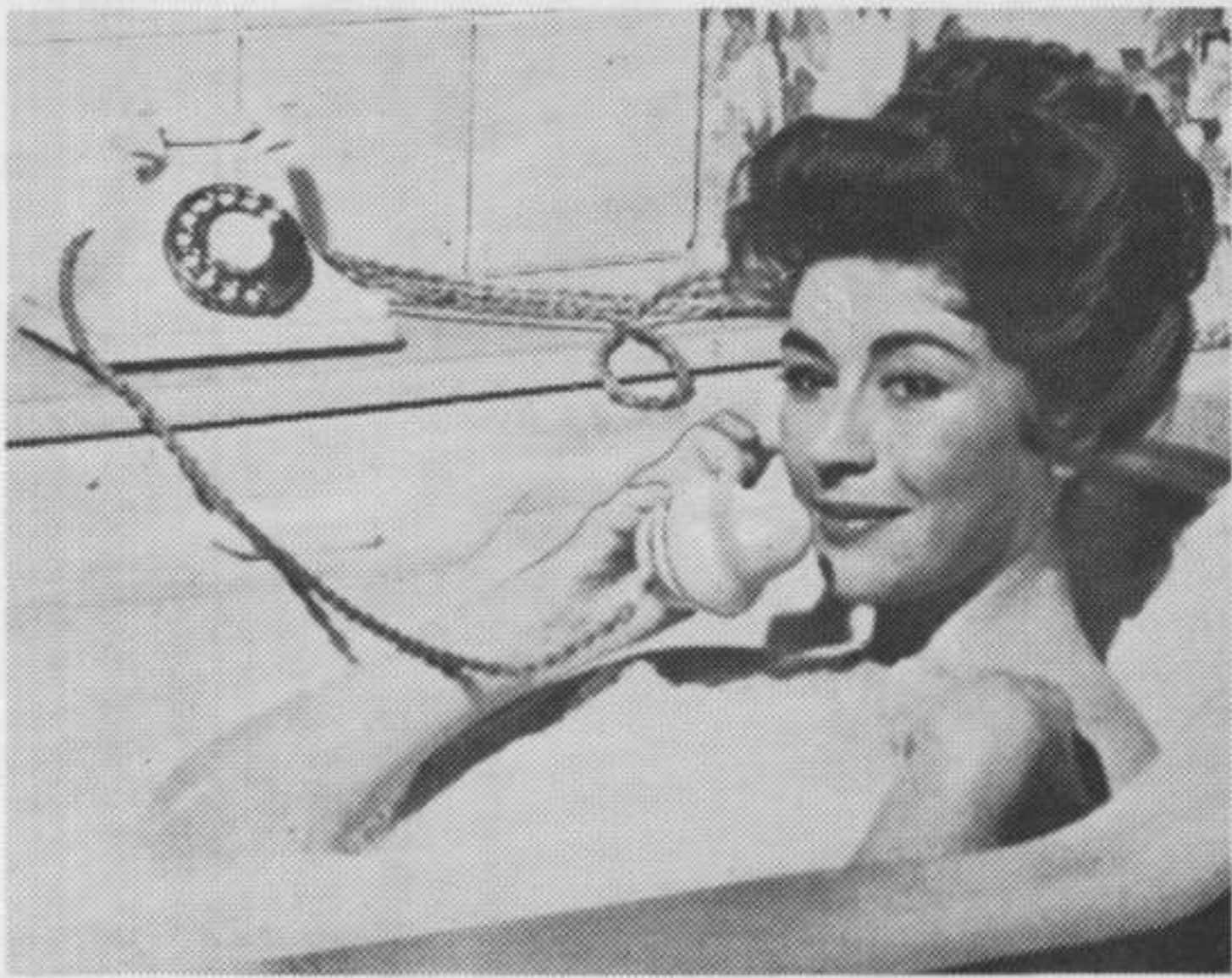
BATHTUB IS VEHICLE to stardom for Nanette Newman, who scores sensational success in comedy thriller, "The League of Gentlemen." The Kingsley International release co-stars Jack Hawkins, Nigel Patrick and Richard Attenborough. Still LG Art 2