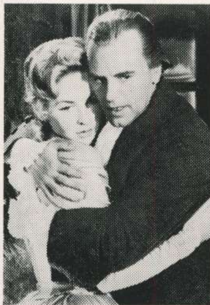
K.S.2 8/- A moment of fear for Odile Versois and O. W. Fischer in this scene from the powerful drama "KING IN SHADOW" which is in Eastman Colour and also stars Horst Buchholz.

Alone, the Queen sailed into the unfriendly cold morning towards her native country.