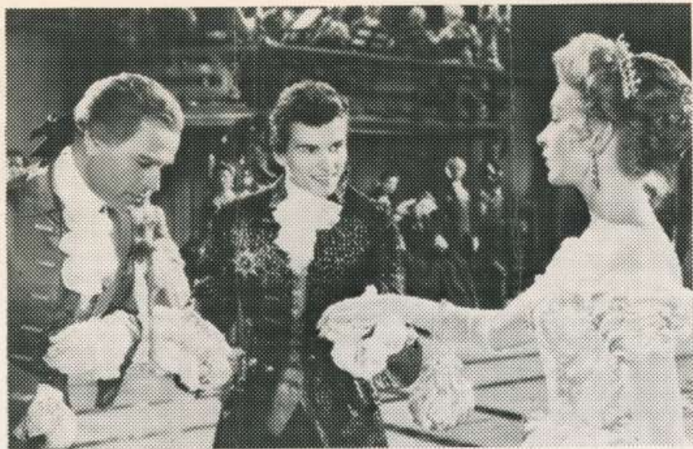
K.S.1 9/- Pictured above are international stars (from left) O. W. Fischer, Horst Buchholz and lovely Odile Versois in a scene from the exciting and dramatic "KING IN SHADOW" currently playing at the cinema. The film is in Eastman Colour.