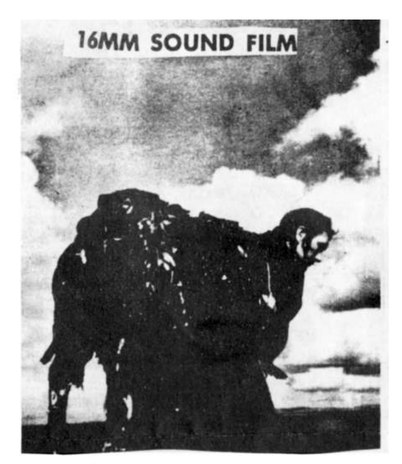
TRUE LIFE STORY OF MEN WHO LIVE BY THE SEA

To produce this film, two years were spent on the lonely Aran Islands off the coast of Ireland . Native islanders re-live for the film the drama of their daily lives. This film is a genuine record of real people.