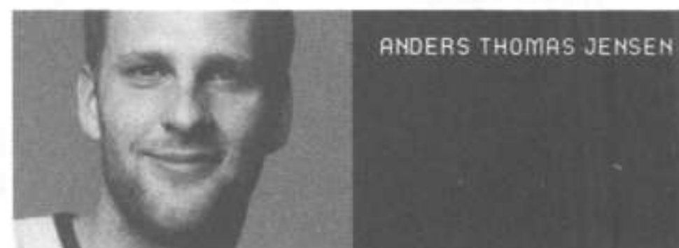
ANDERS THOMAS JENSEN

Anders Thomas Jensen was born in Fredericksværk, Denmark in 1972. His previous features as writer/director include FLICKERING LIGHTS (2000) and THE GREEN BUTCHERS (SFIFF 2004). He has been nominated for three Academy Awards for Best Live Action Short Film as writer and/or codirector, winning for 1998's ELECTION NIGHT . His screenwriting credits include IN CHINA THEY EAT DOGS (2002) and two award-winning Dogme films: THE KING IS ALIVE (2001, selected for Un Certain Regard, Cannes) and MIFUNE (1998, Grand Prix and Silver Bear winner, Berlin).