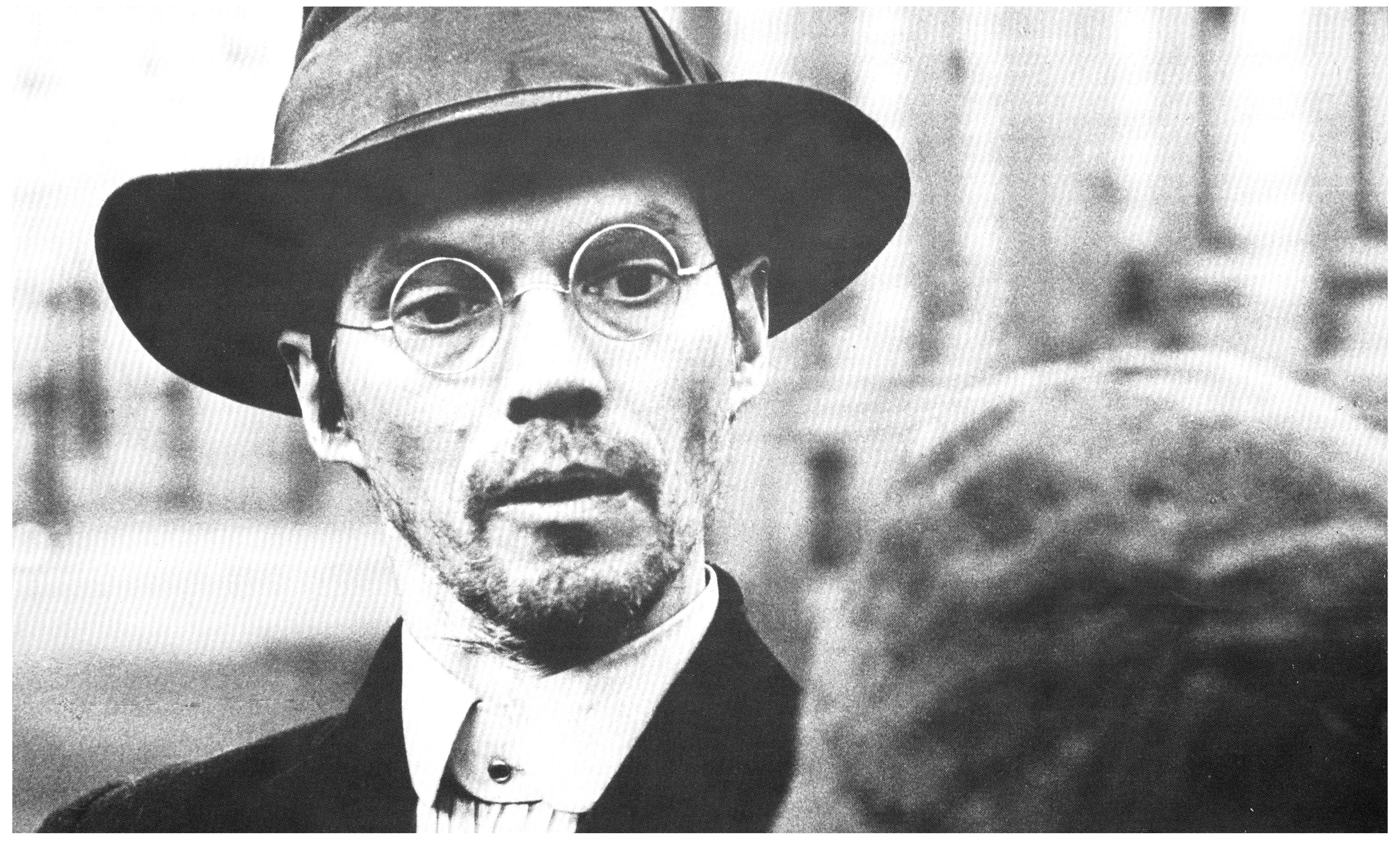
WARNING: This material may be protected by copyright law (Title 17 U.S. Code)