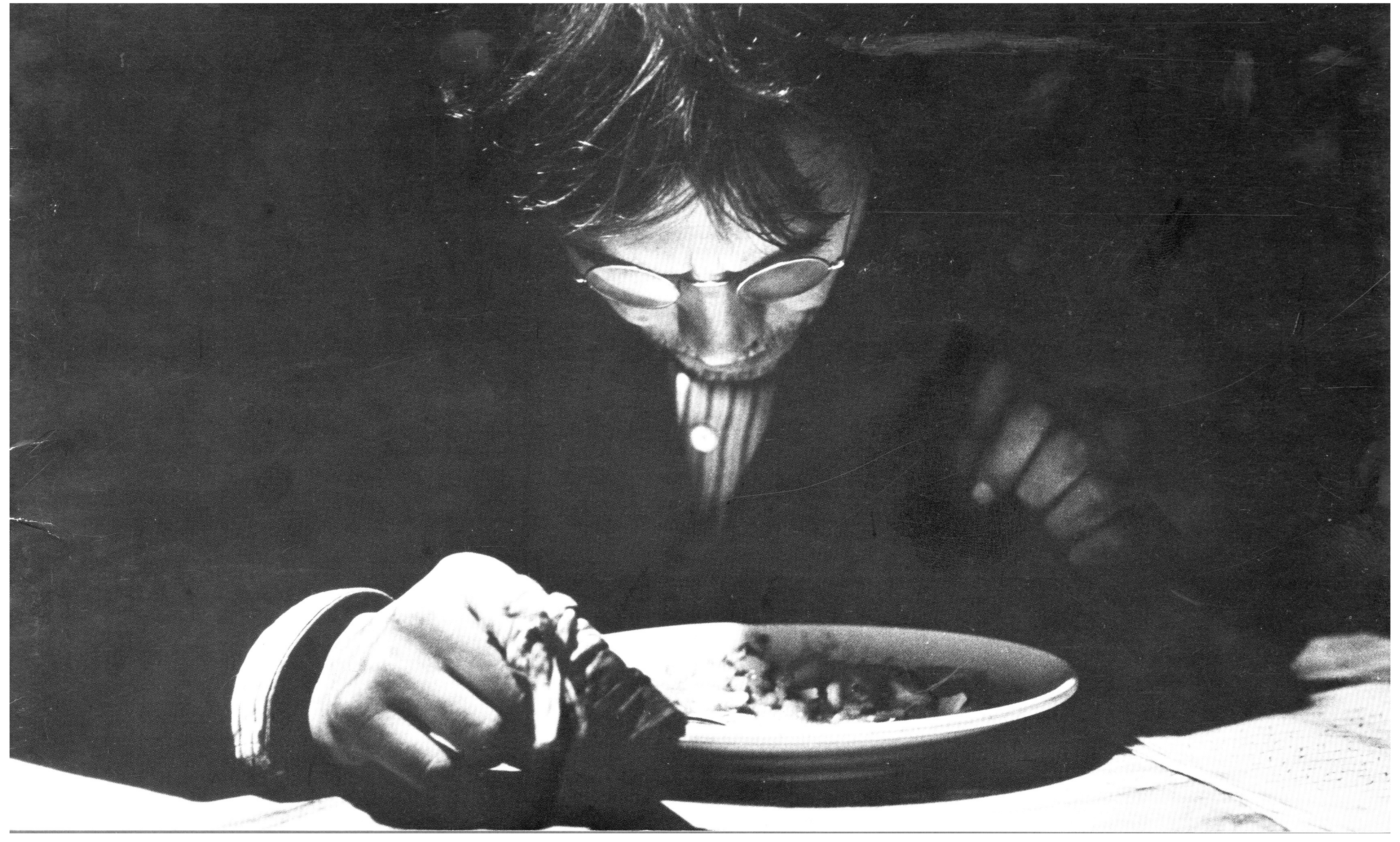
WARNING: This material may be protected by copyright law (Title 17 U.S. Code)