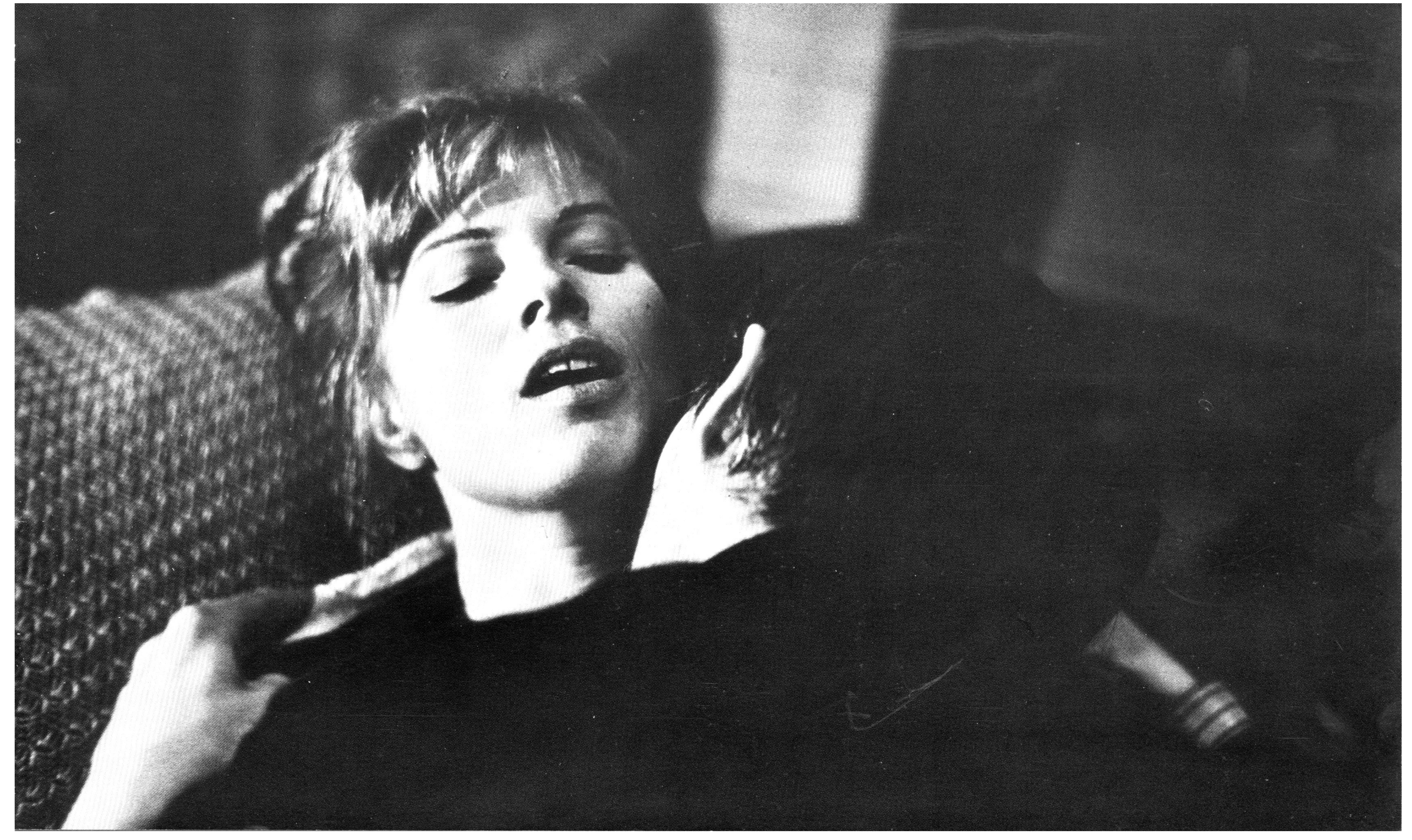
WARNING: This material may be protected by copyright law (Title 17 U.S. Code)