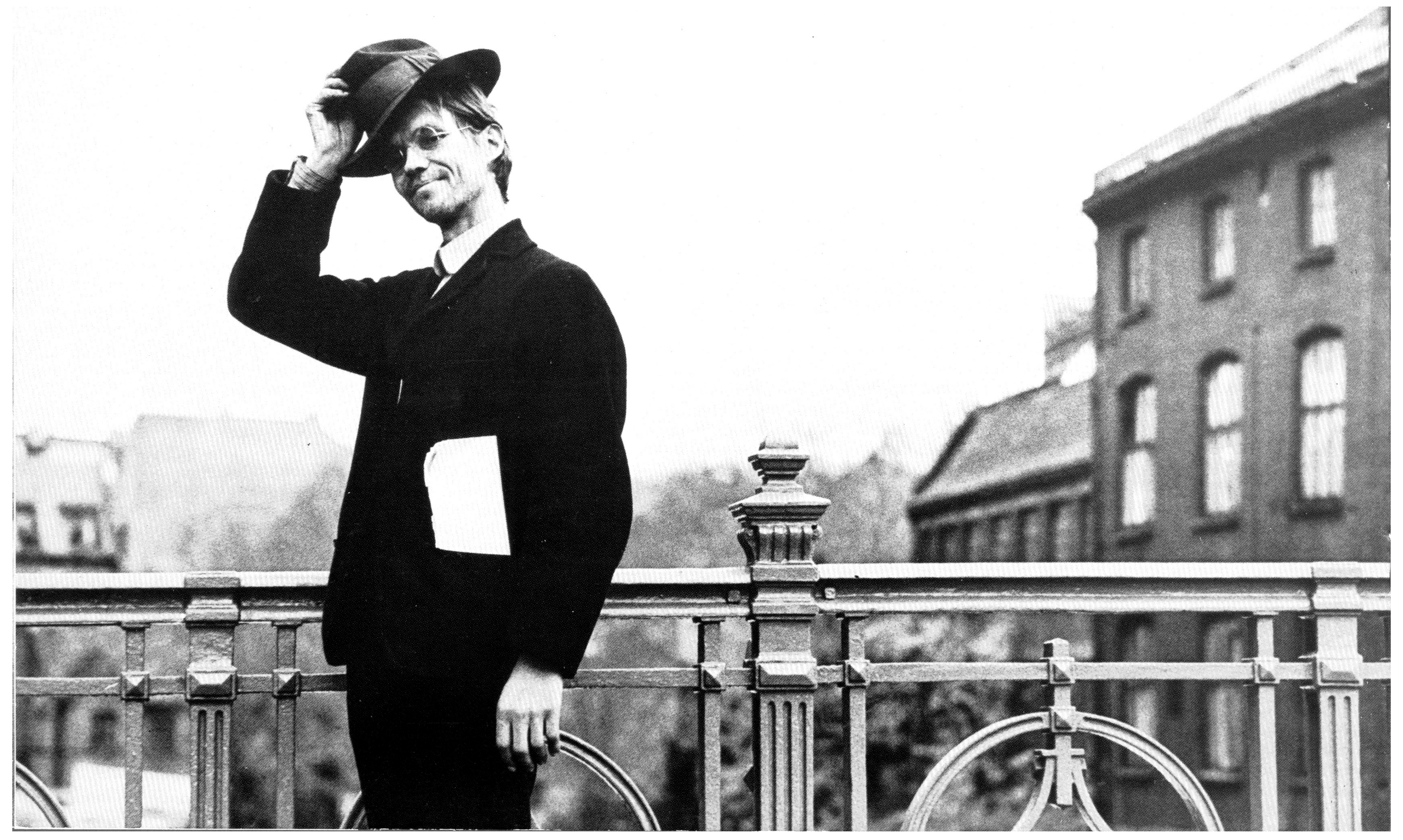
WARNING: This material may be protected by copyright law (Title 17 U.S. Code)