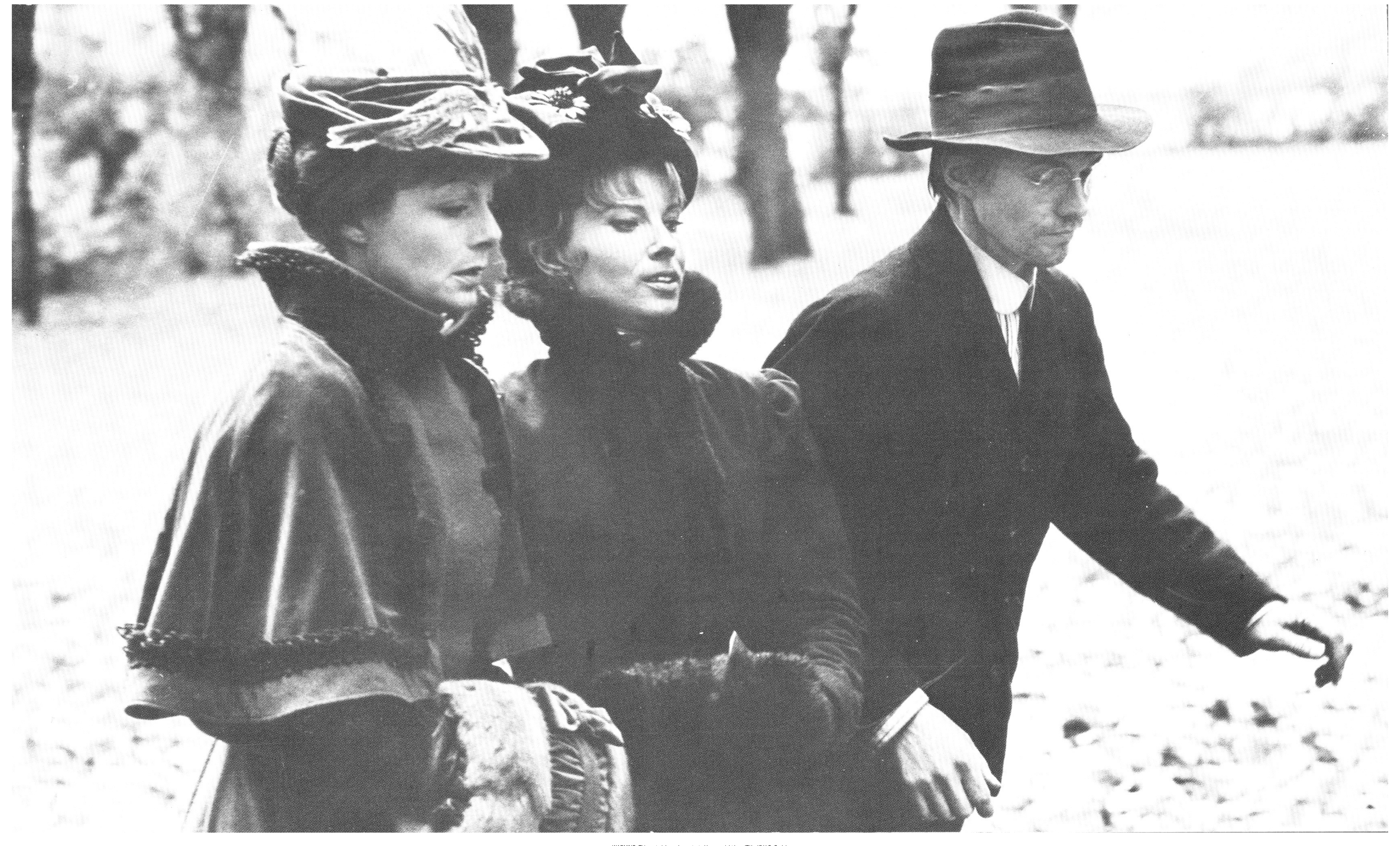
WARNING: This material may be protected by copyright law (Title 17 U.S. Code)