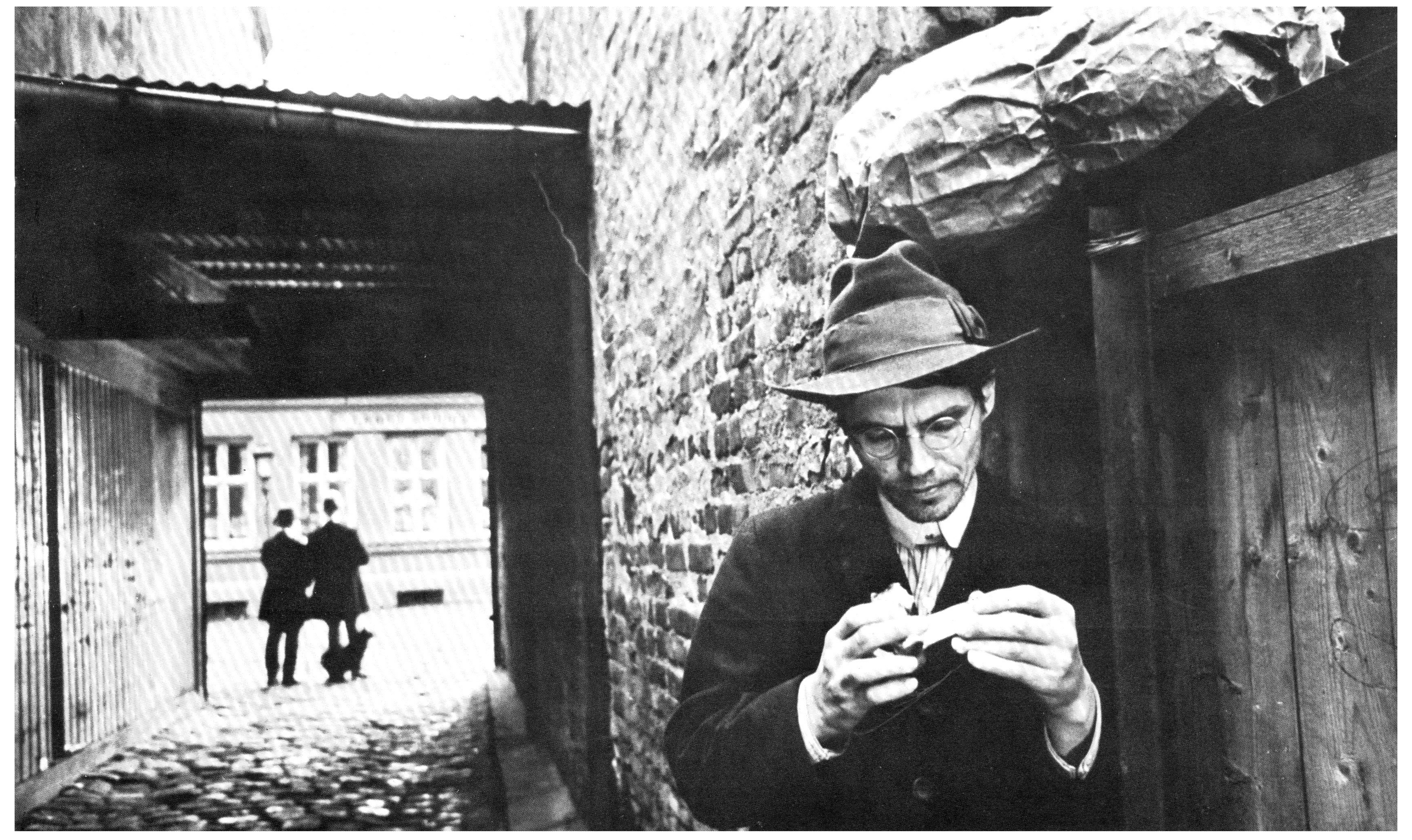
WARNING: This material may be protected by copyright law (Title 17 U.S. Code)