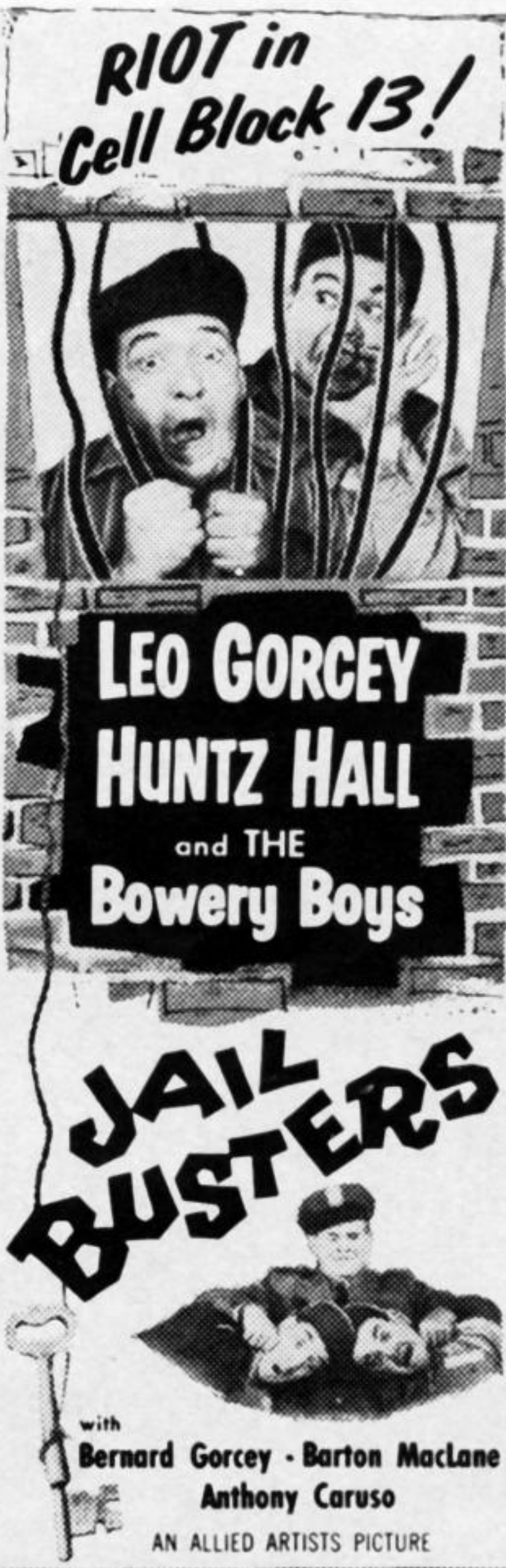
Ad No. 101 1 col. x 6 1/4" (87 Lines)