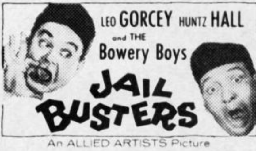
Ad No. 104 1 col. x 1" (14 Lines)