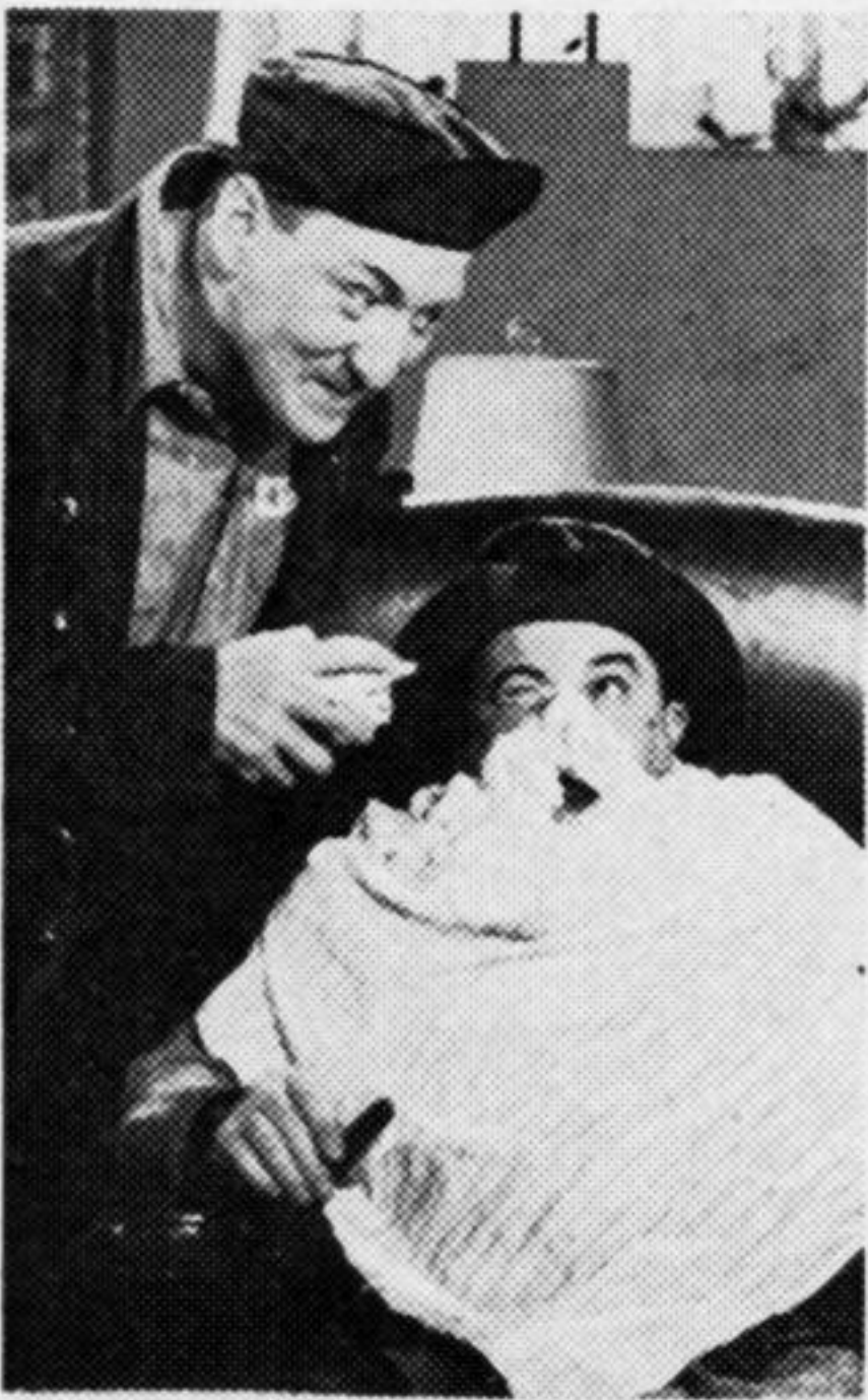
JAIL BUSTERS No. 4