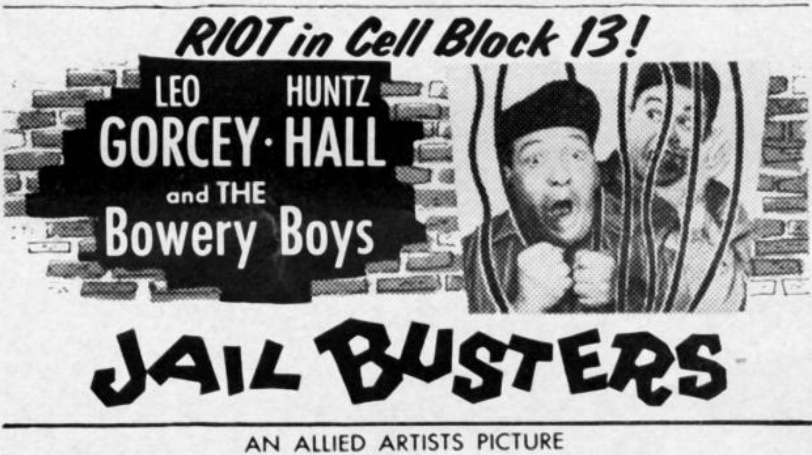
Ad No. 205 2 cols. x 2" (56 Lines)