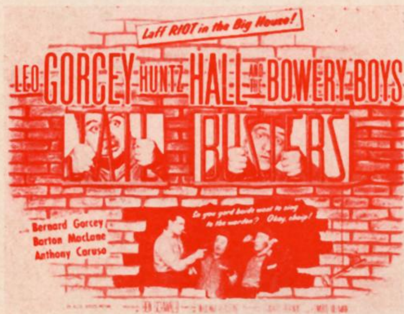
TWO 22 x 28 LOBBY CARDS

SET OF EIGHT FULL COLOR 11 x 14 LOBBY PHOTOS ALSO AVAILABLE