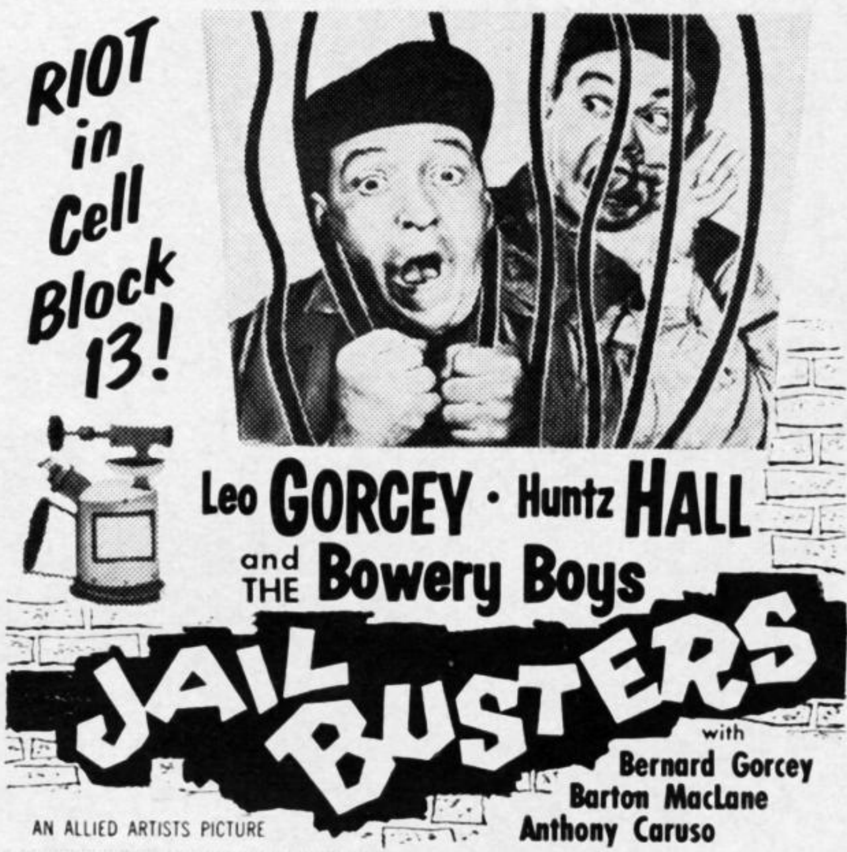
Ad No. 203 2 cols. x 3 3/4" (106 Lines)

NOTE: Any of These Mats May Be Ordered Singly At The Regular Price. Order By Number Under The Cut.