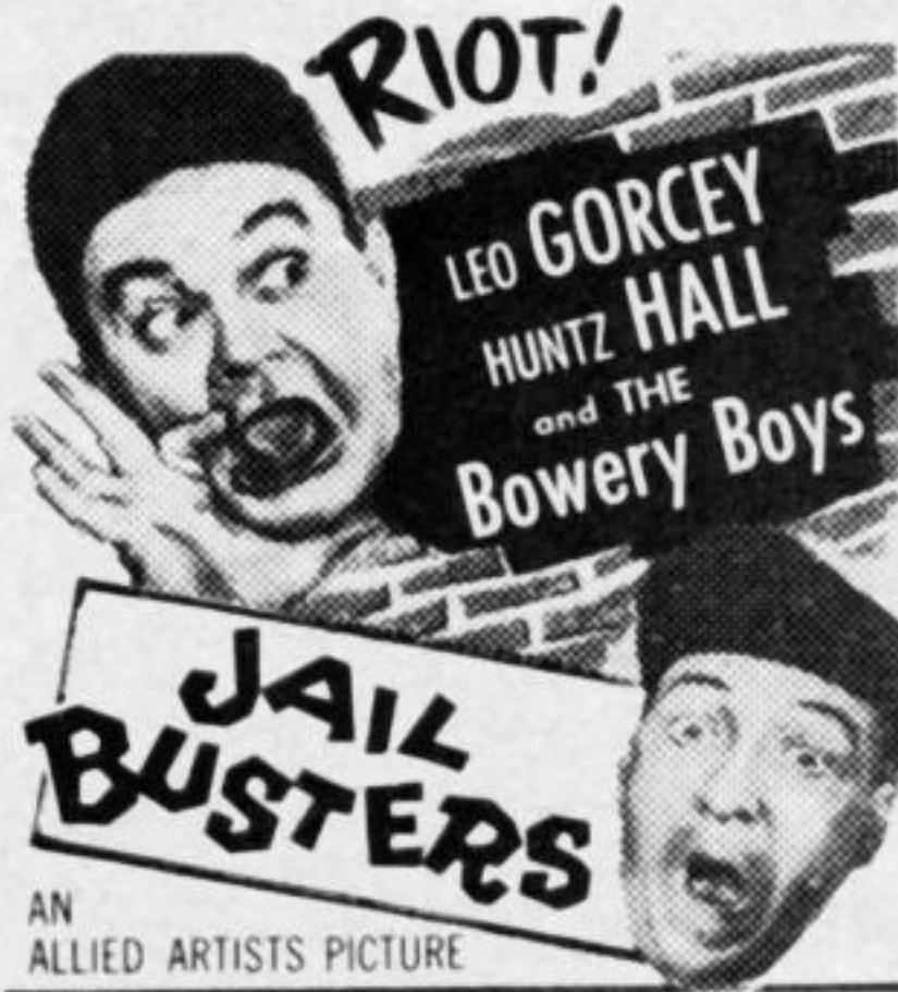
Ad No. 103 1 col. 2" (28 Lines)