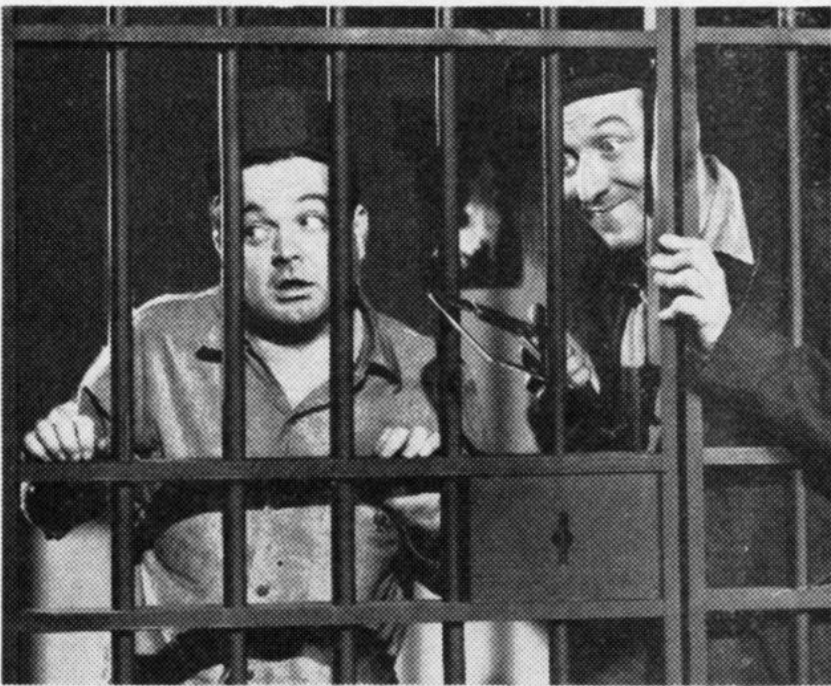
JAIL BUSTERS No. 22