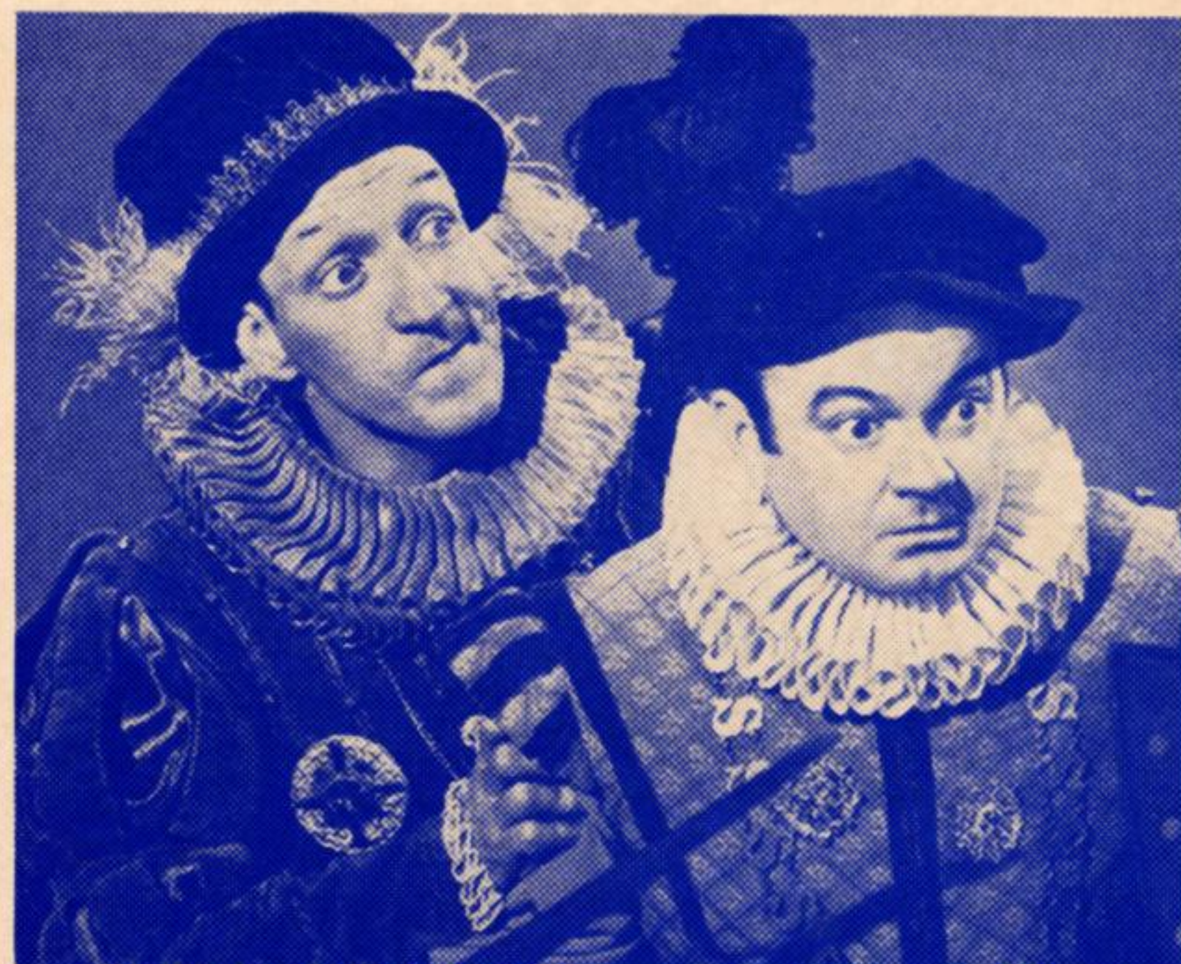
"LOOSE IN LONDON" No. 21

Leo Gorcey and Huntz Hall go Old English in one uproarious sequence of their latest Bowery Boys comedy for Allied Artists, "Loose in London," now playing at the ..... theatre. Angela Greene has the feminine lead.