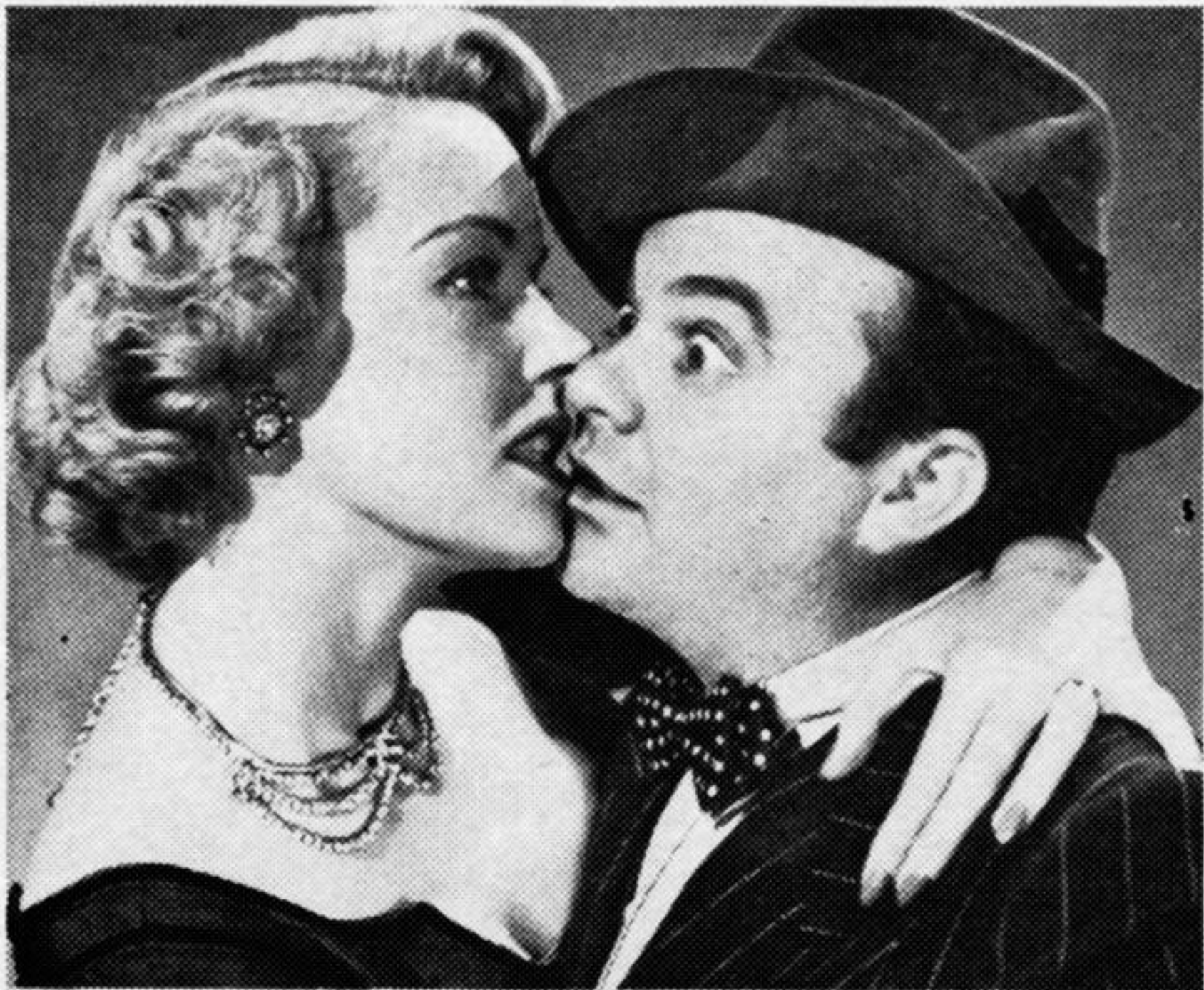
"LOOSE IN LONDON" No. 22

Leo Gorcey, to use an old expression, is vamped completely by lovely Angela Greene in his latest Bowery Boys comedy with Huntz Hall, "Loose in London." The Allied Artists picture is at the ..... theatre.