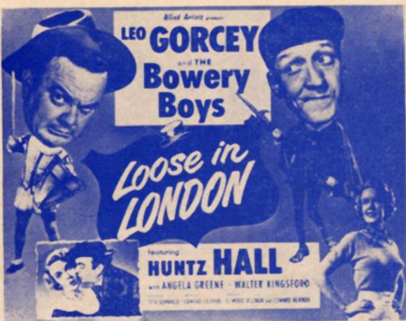
TWO 22 x 28 LOBBY CARDS

SET OF EIGHT FULL COLOR 11 x 14 LOBBY PHOTOS ALSO AVAILABLE