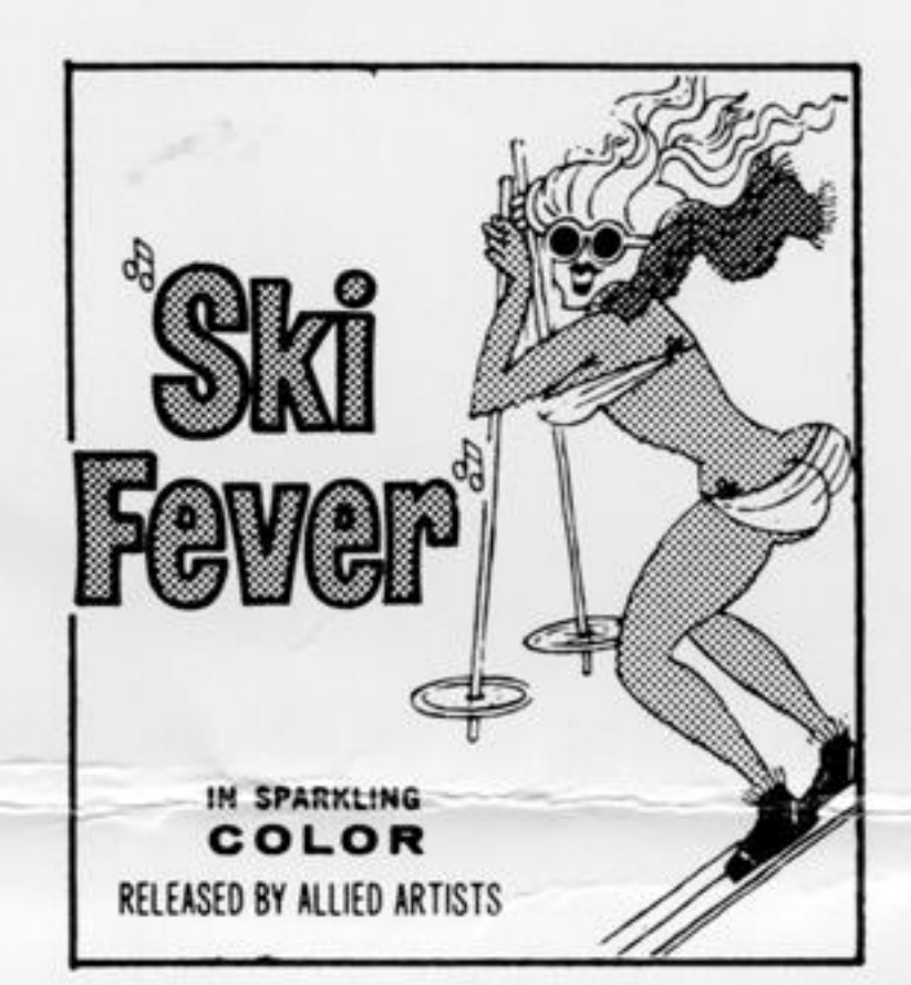
Ad Mat 106 Icol x 2" 28 lines