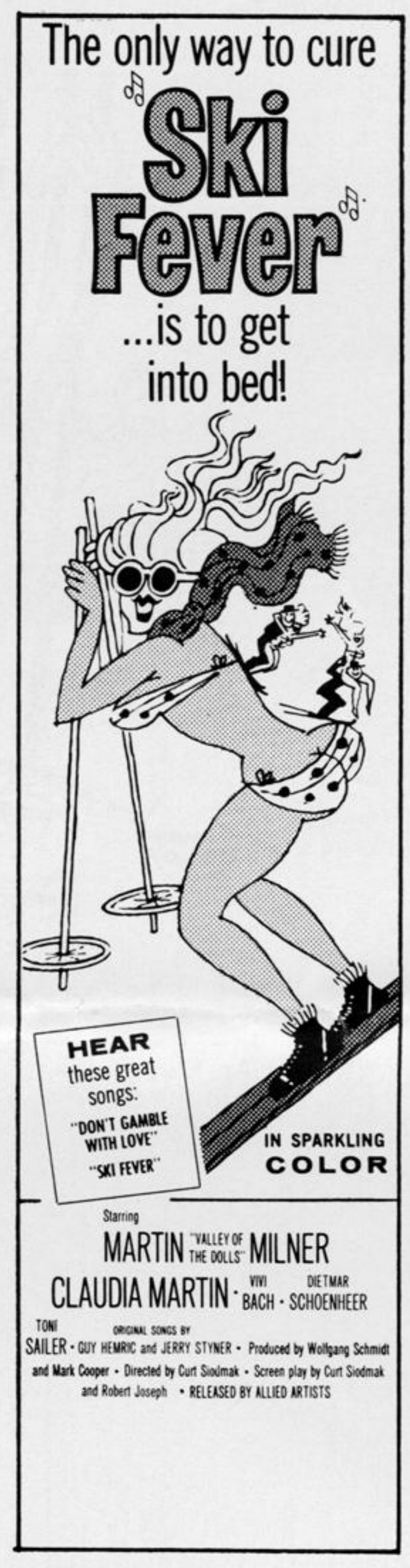
Ad Mat 105 Icol x 7" 100 lines