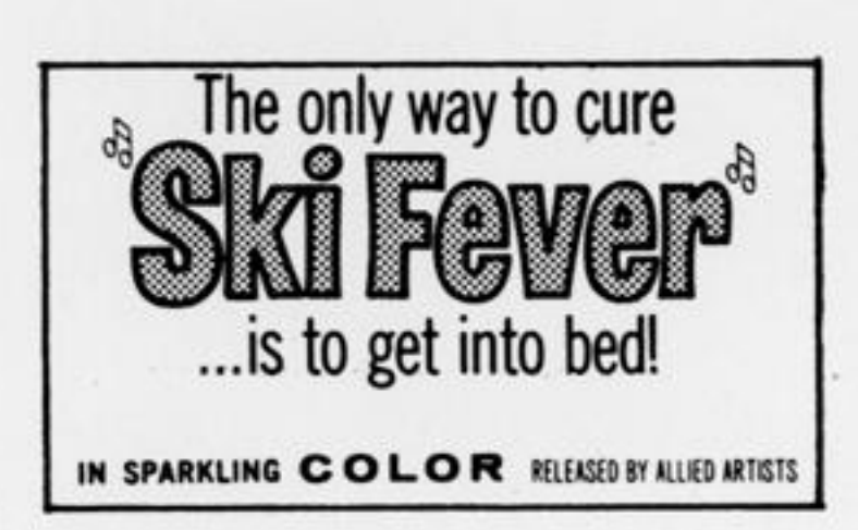
Ad Mat 107 Icol xI" 14 lines