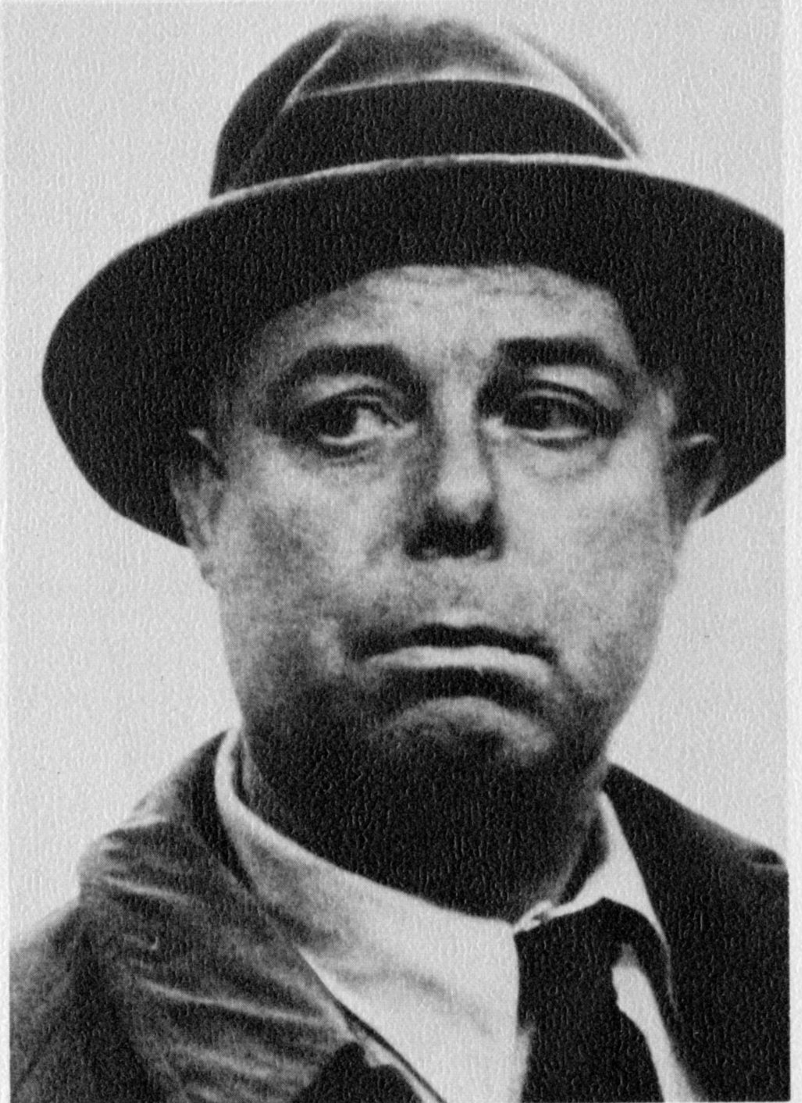
Jean Renoir as Octave in RULES OF THE GAME

GRAND ILLUSION and RULES OF THE GAME are available from the JANUS COLLECTION, the greatest single source of film classics in the world.