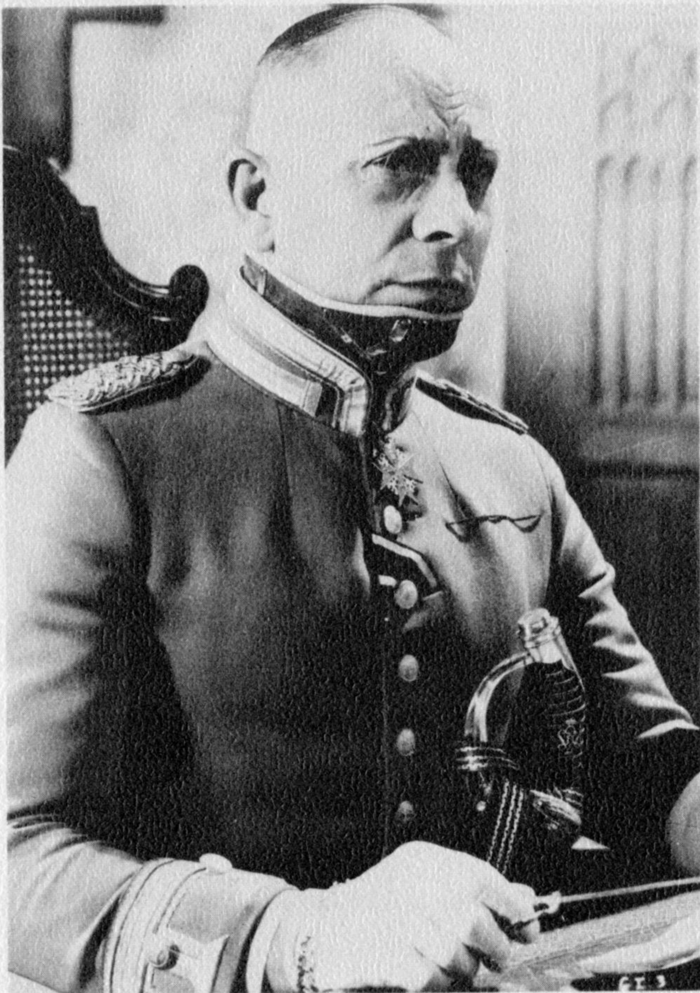
Erich von Stroheim as Colonel von Rauffenstein in GRAND ILLUSION