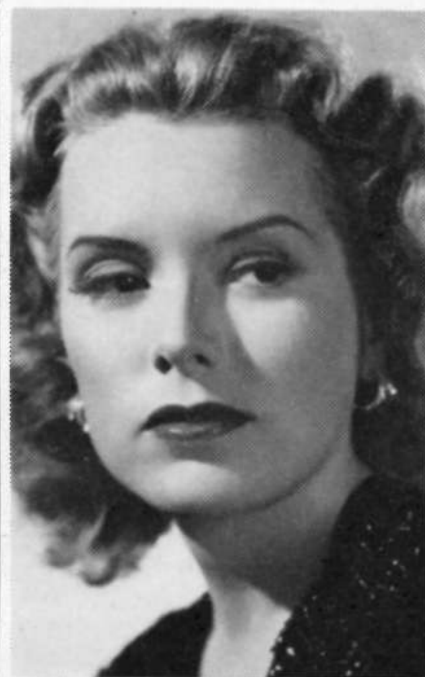
STRANGE CONFESSION (1A)

Brenda Joyce appears in the principal feminine role with Lon Chaney in Universal's Inner Sanctum mystery, "Strange Confession."