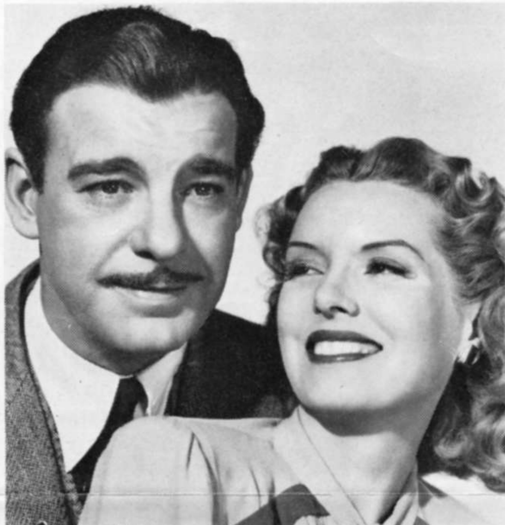
STRANGE CONFESSION (2A)

Lon Chaney is starred in Universal's Inner Sanctum mystery classic, "Strange Confession," in which lovely Brenda Joyce has the leading feminine role as wife of a famous medical scientist.