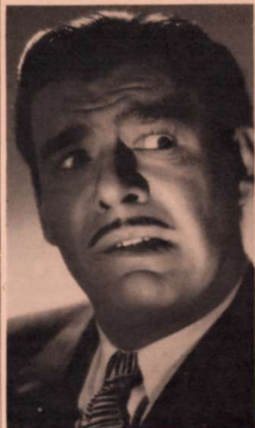
STRANGE CONFESSION (18)

Lon Chaney is starred as the frustrated scientist killer in Universal's Inner Sanctum mystery picture, "Strange Confession."