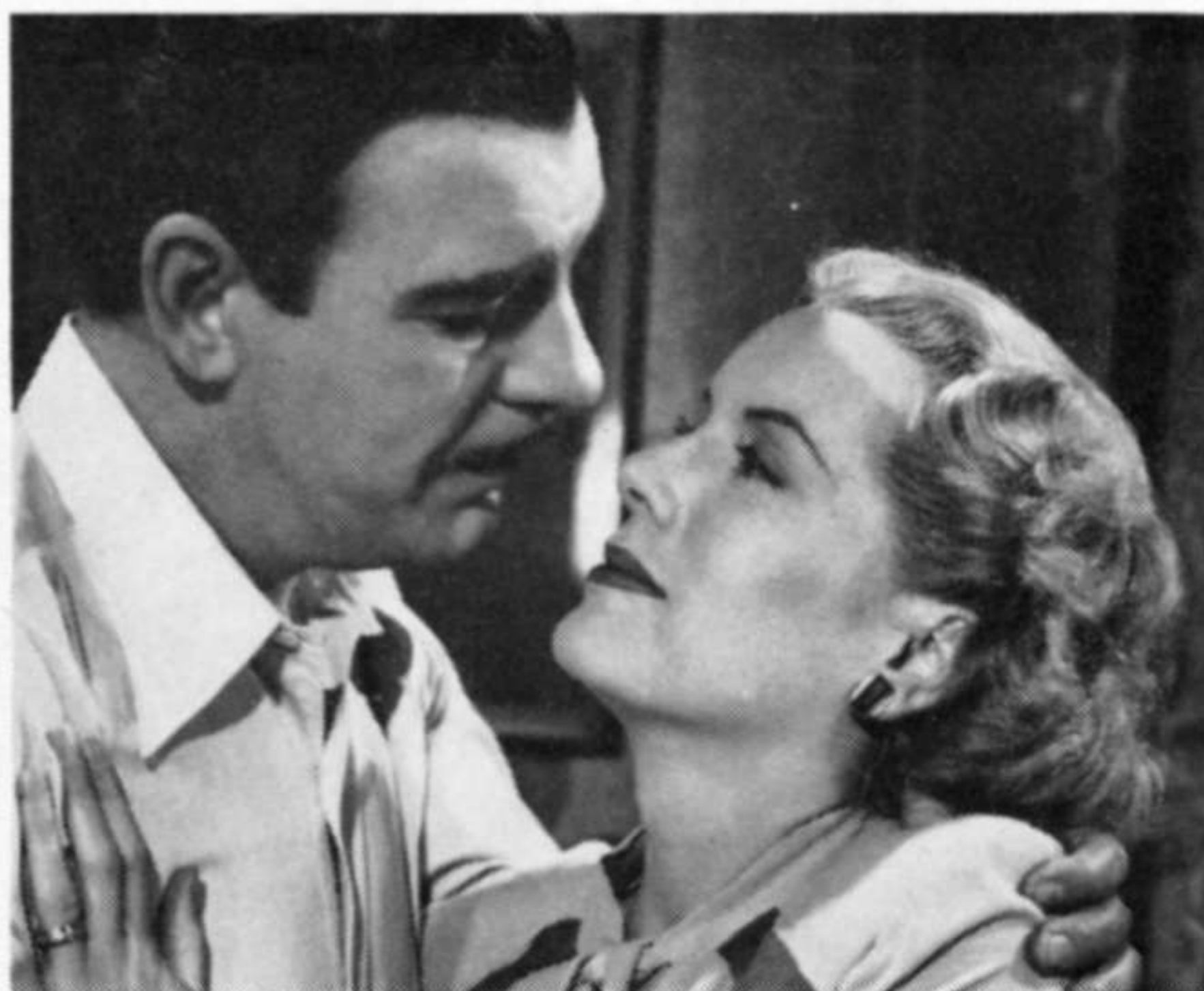
STRANGE CONFESSION (28)

Romantic heart-appeal is provided effectively by Lon Chaney and Brenda Joyce in Universal's Inner Sanctum mystery production, "Strange Confession."