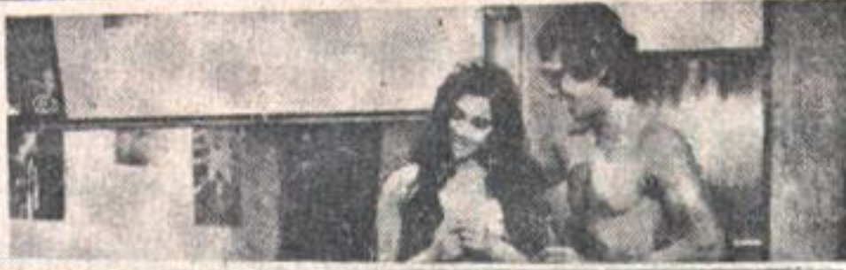
ก.เจตธรรมนรา ชะตวย ชน ชยกันเมาน์เทศ เต้นจะ