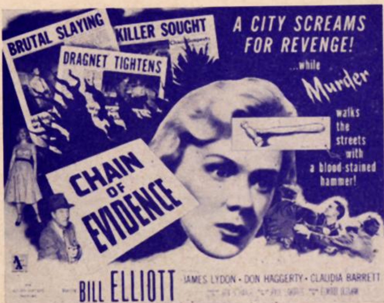
TWO 22 x 28 LOBBY CARDS

Set of Eight Full Color 11 x 14 Lobby Photos Also Available