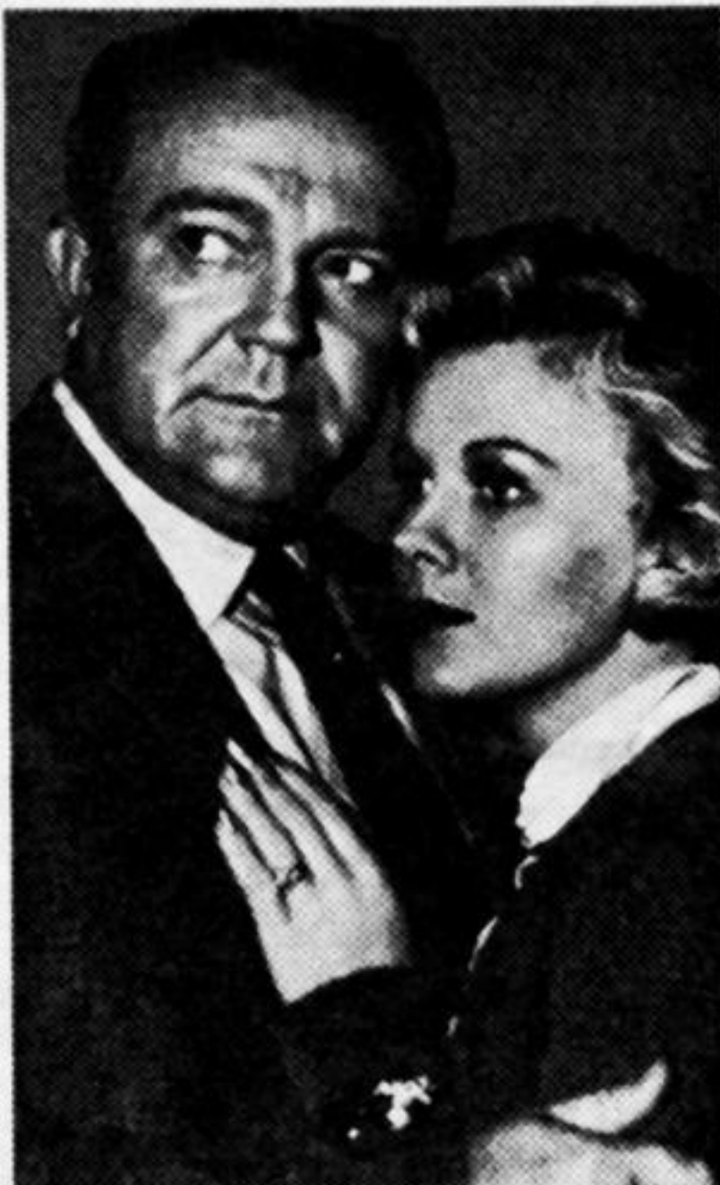
CHAIN OF EVIDENCE