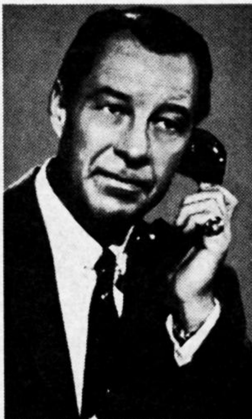
CHAIN OF EVIDENCE