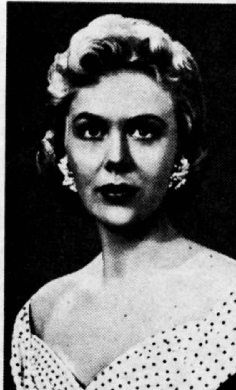
CHAIN OF EVIDENCE