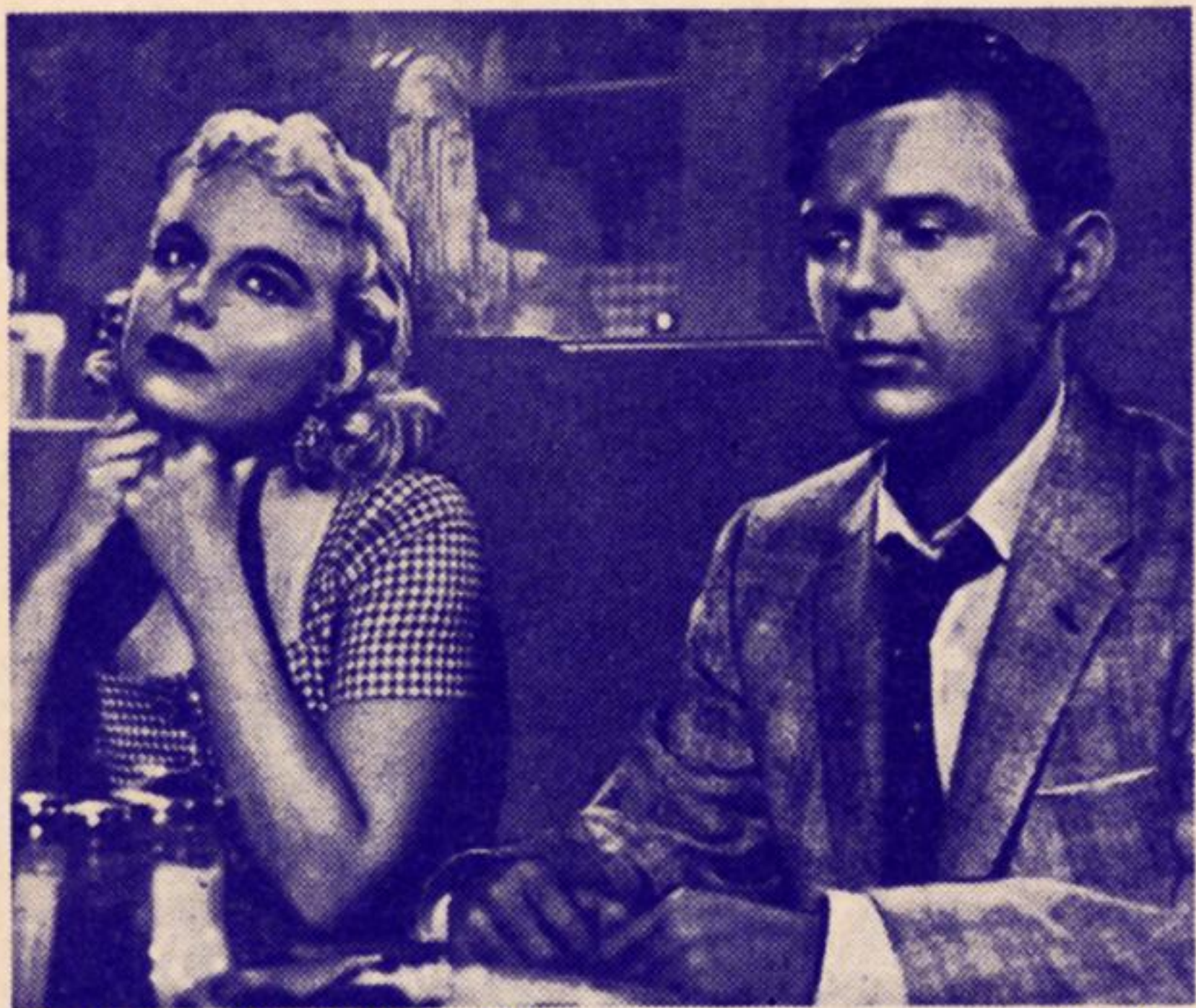
CHAIN OF EVIDENCE