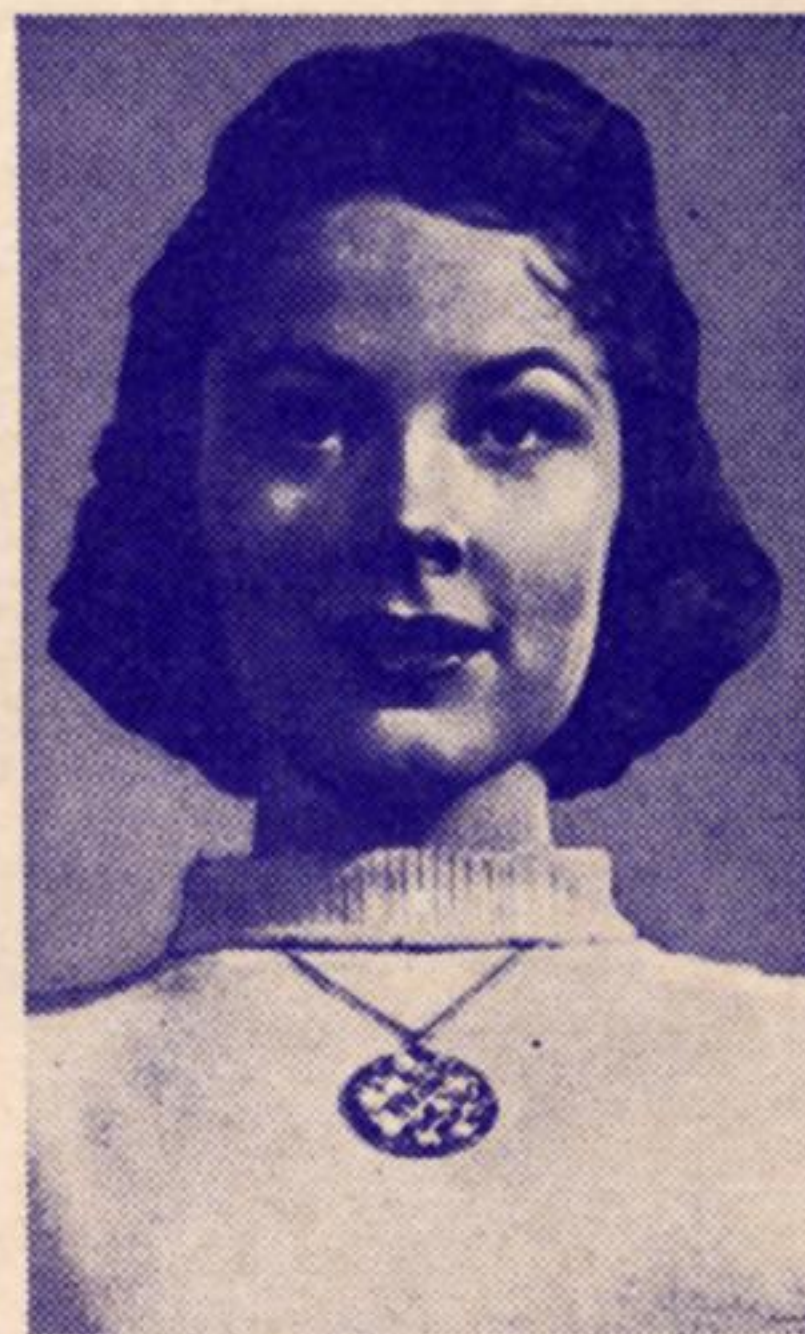
CHAIN OF EVIDENCE