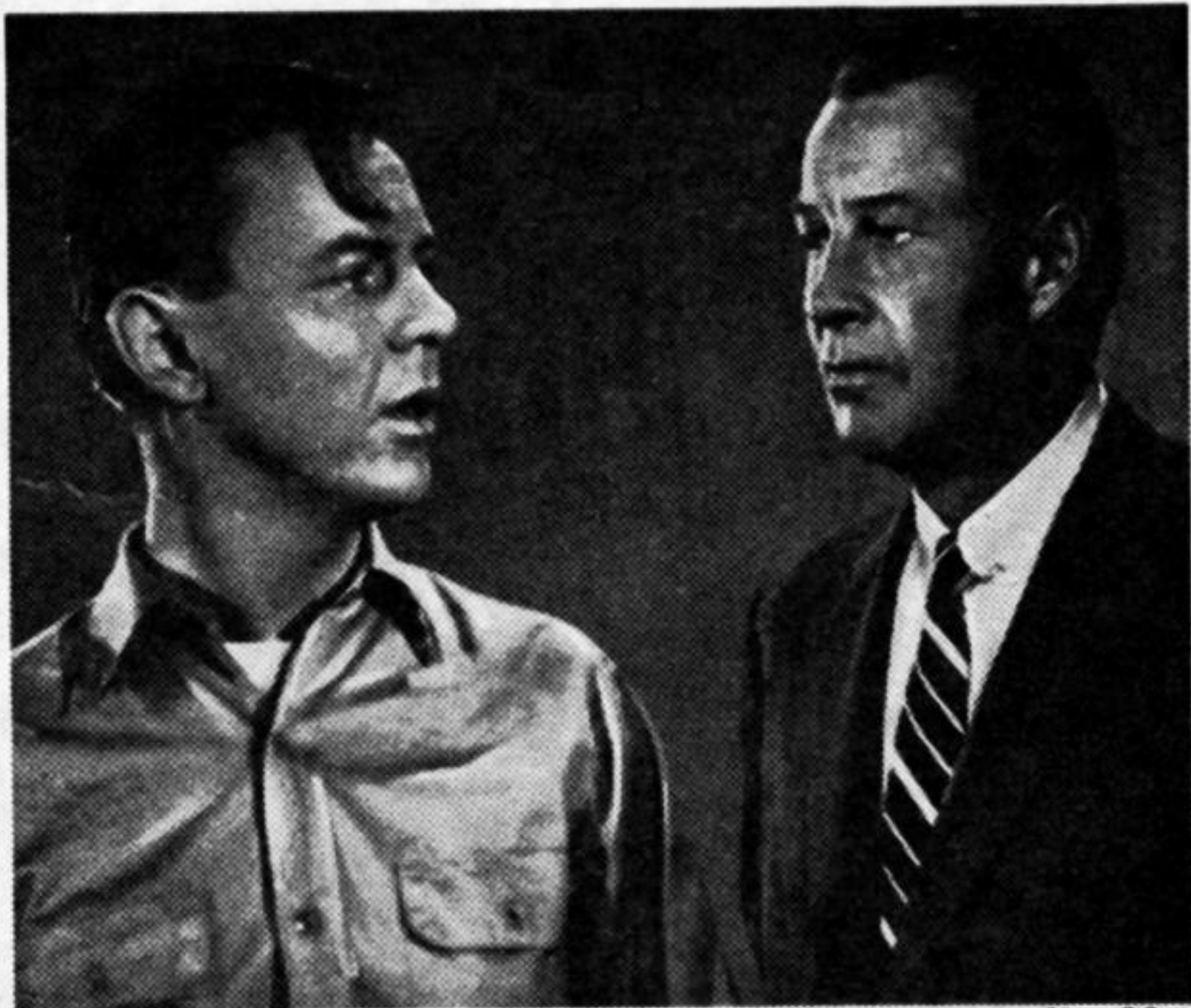
CHAIN OF EVIDENCE