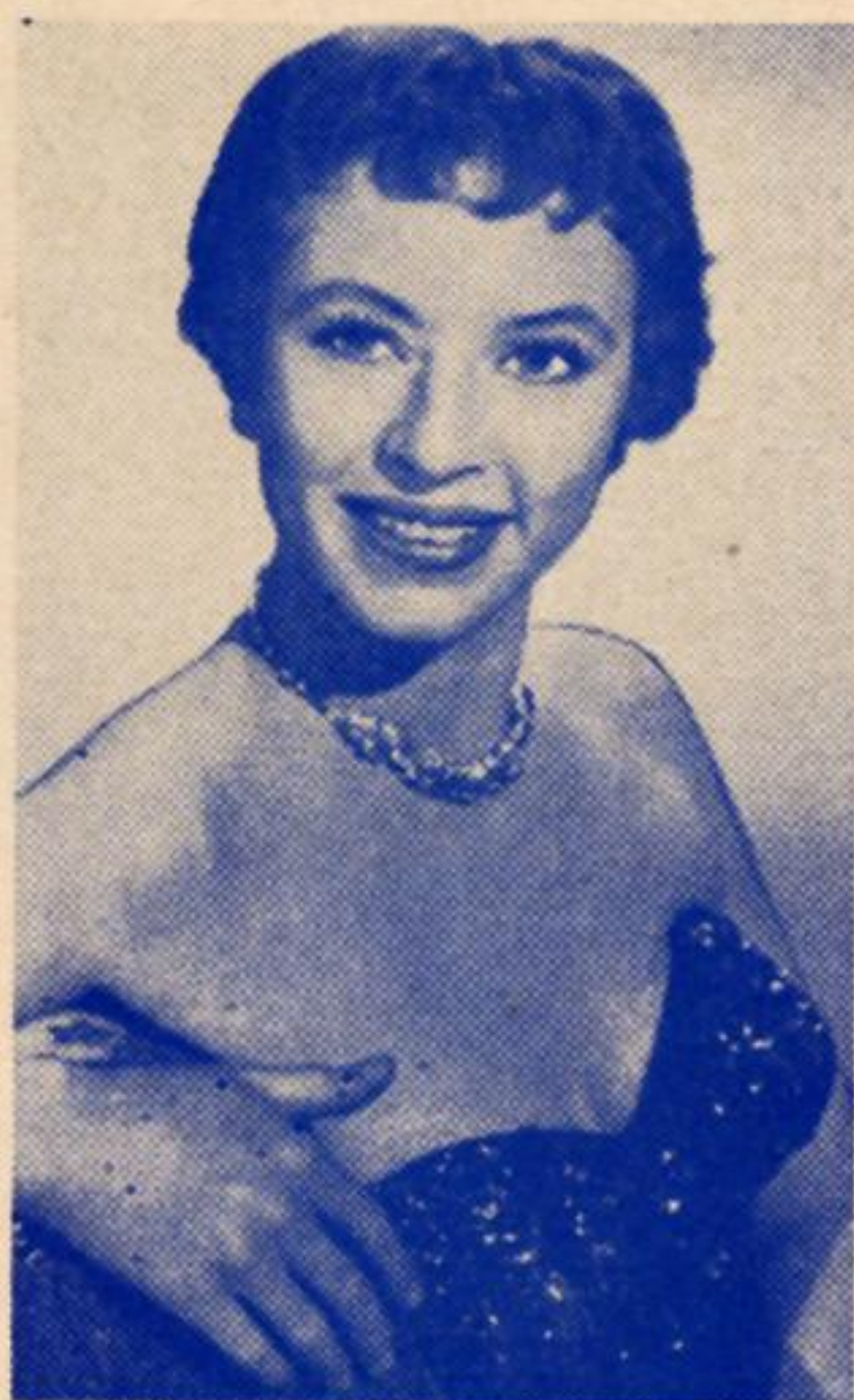
HIGH SOCIETY No. 3

Amanda Blake has the feminine lead in Allied Artists' "High Society," a Bowery Boys comedy with Leo Gorcey and Huntz Hall, at the ..... theatre.