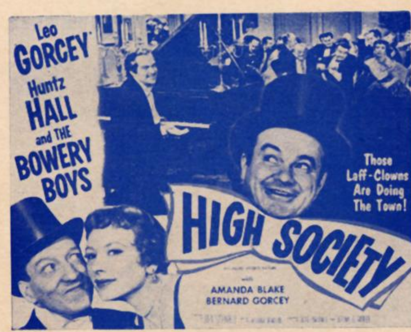
TWO 22 x 28 LOBBY CARDS

SET OF EIGHT FULL COLOR 11 x 14 LOBBY PHOTOS ALSO AVAILABLE