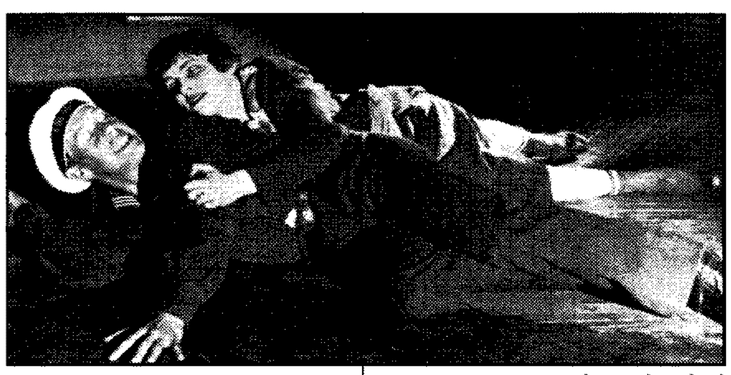
The Devil's Wheel

THE DEVIL'S WHEEL (1926; silent fragment, 42 minutes) with THE OVERCOAT (1926; 66 minutes) (live piano accompaniment) Vanya, a sailor, takes his